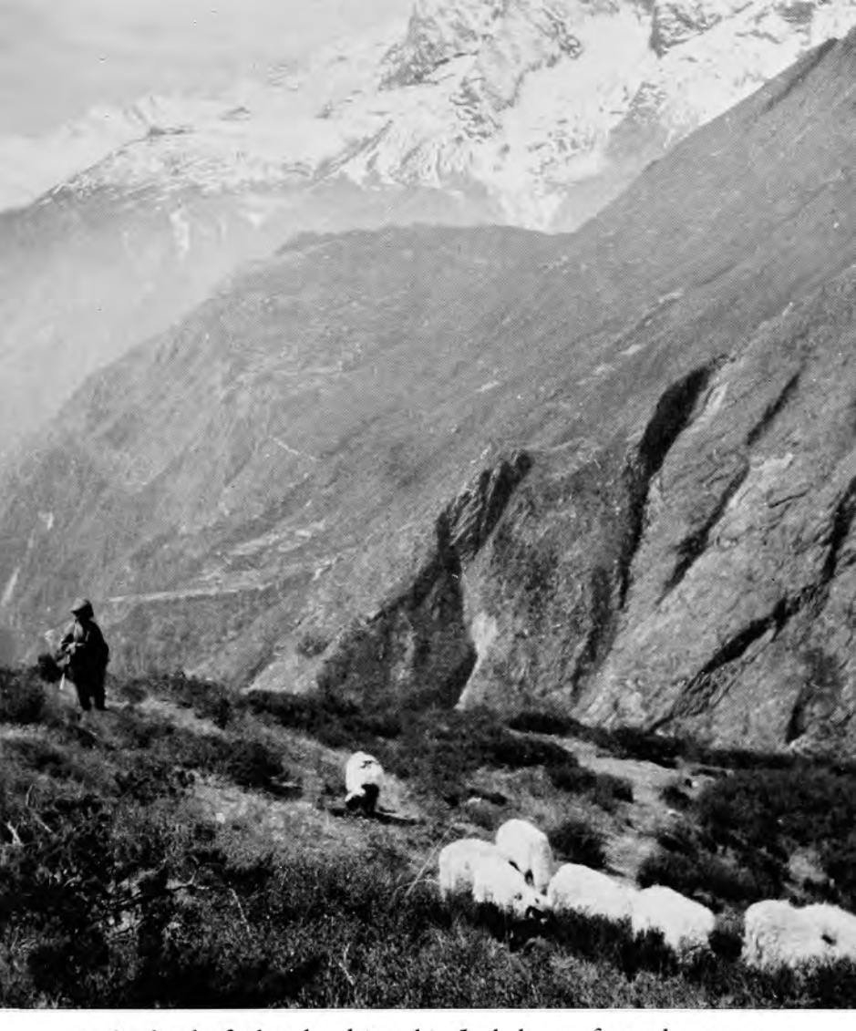
A shepherd of Phorche drives his flock home from the sparse winter grazing