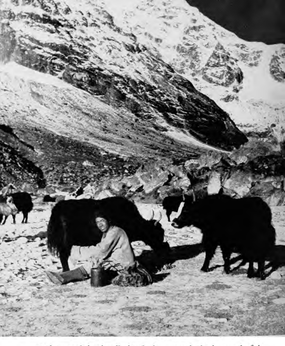
A Sherpa yak-herd milks his flock against the background of the Longmoche Kola. The range in the background marks the boundary with Tibet