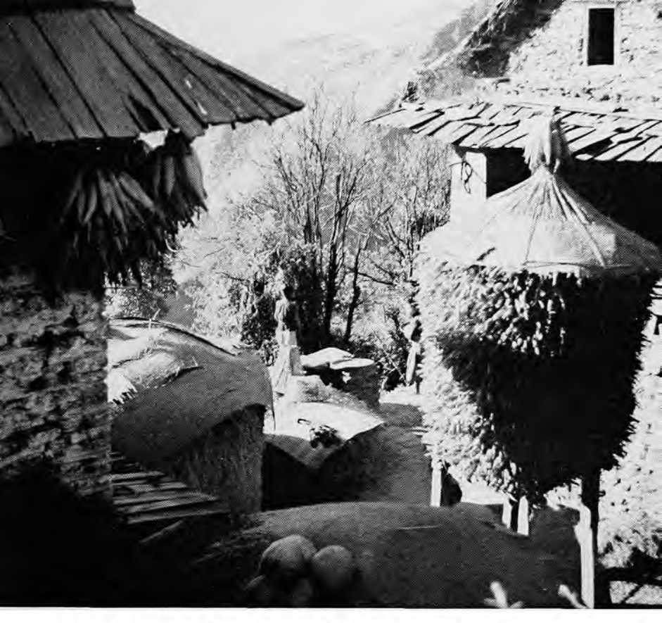
Little, self-contained steadings with their stacks of golden maize cobs are a feature of much of the country above Kathmandu