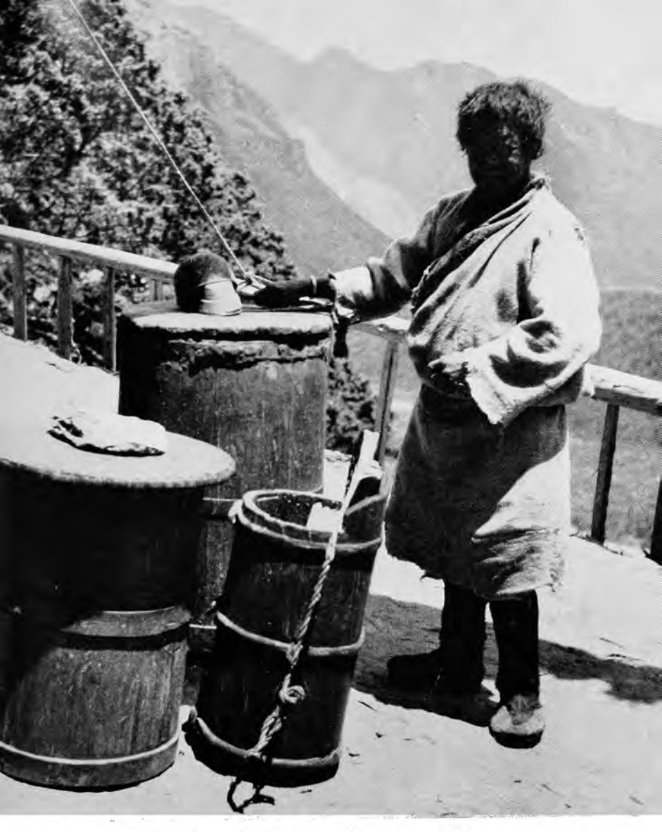
A monastic retainer ladled out milky beer to all-comers at the May festival of Gondah Monastery