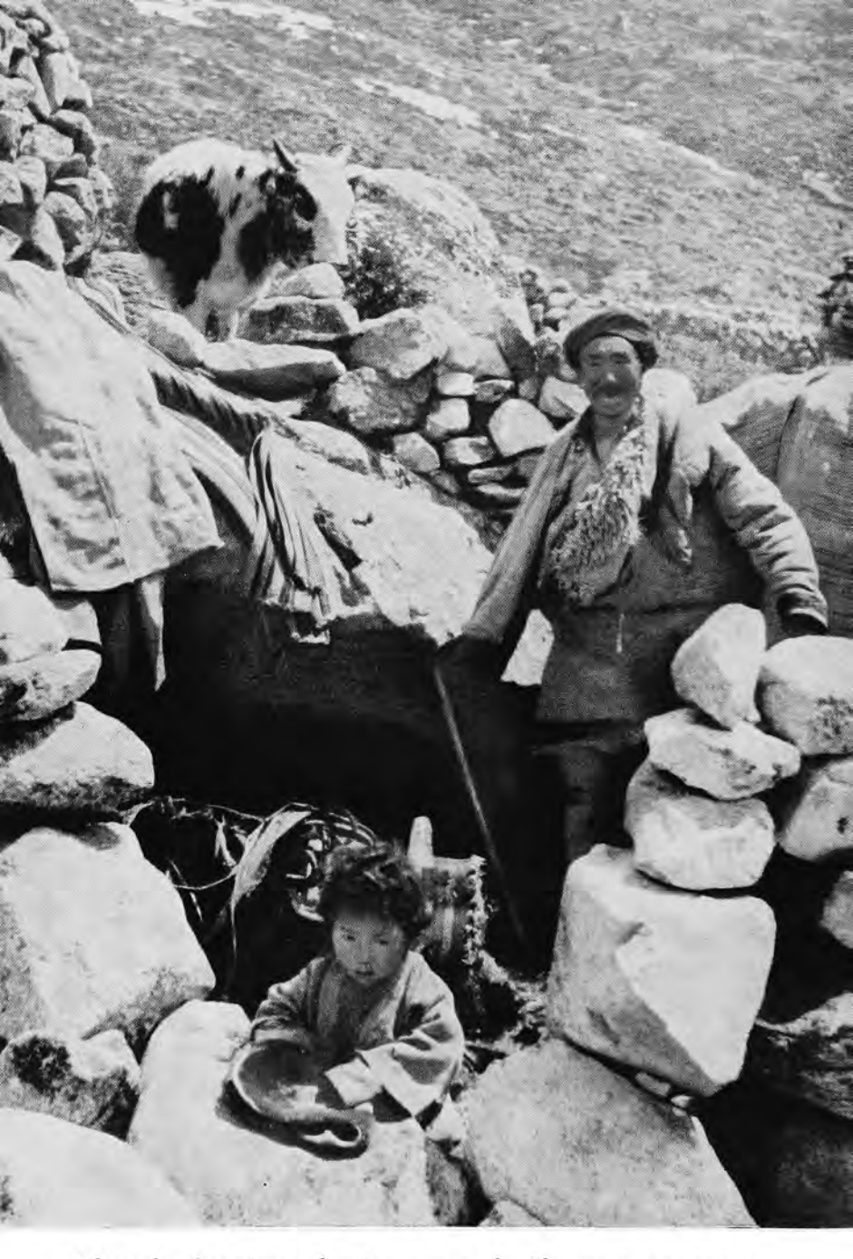
When the first signs of spring appear the Sherpas move out to their grazing grounds, camping for the night among the rocks