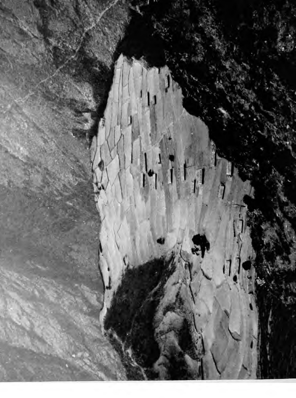
Phorche Village is spread out over a large area at a bend in the Dudh river