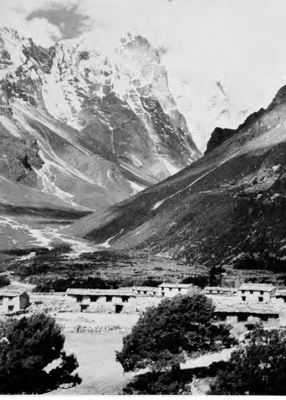
There is no more beautiful place in the Sherpa country than Thami, at the end of a valley, and overlooked by beetling ranges. Gondah Monastery is perched up above it (on the extreme right)