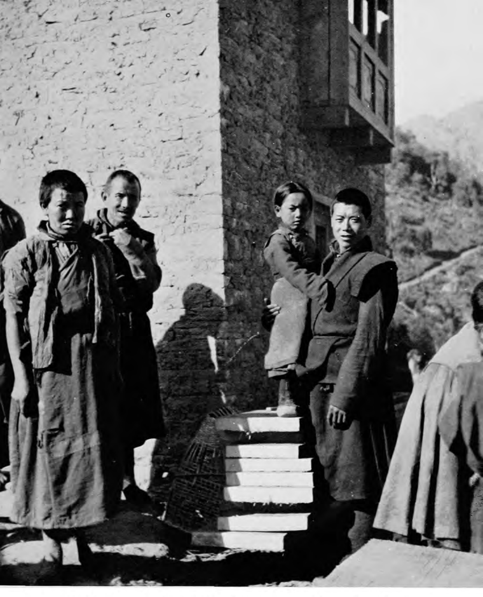
A grave-faced mite, the child Abbot seemed to know already that his was to be a life apart