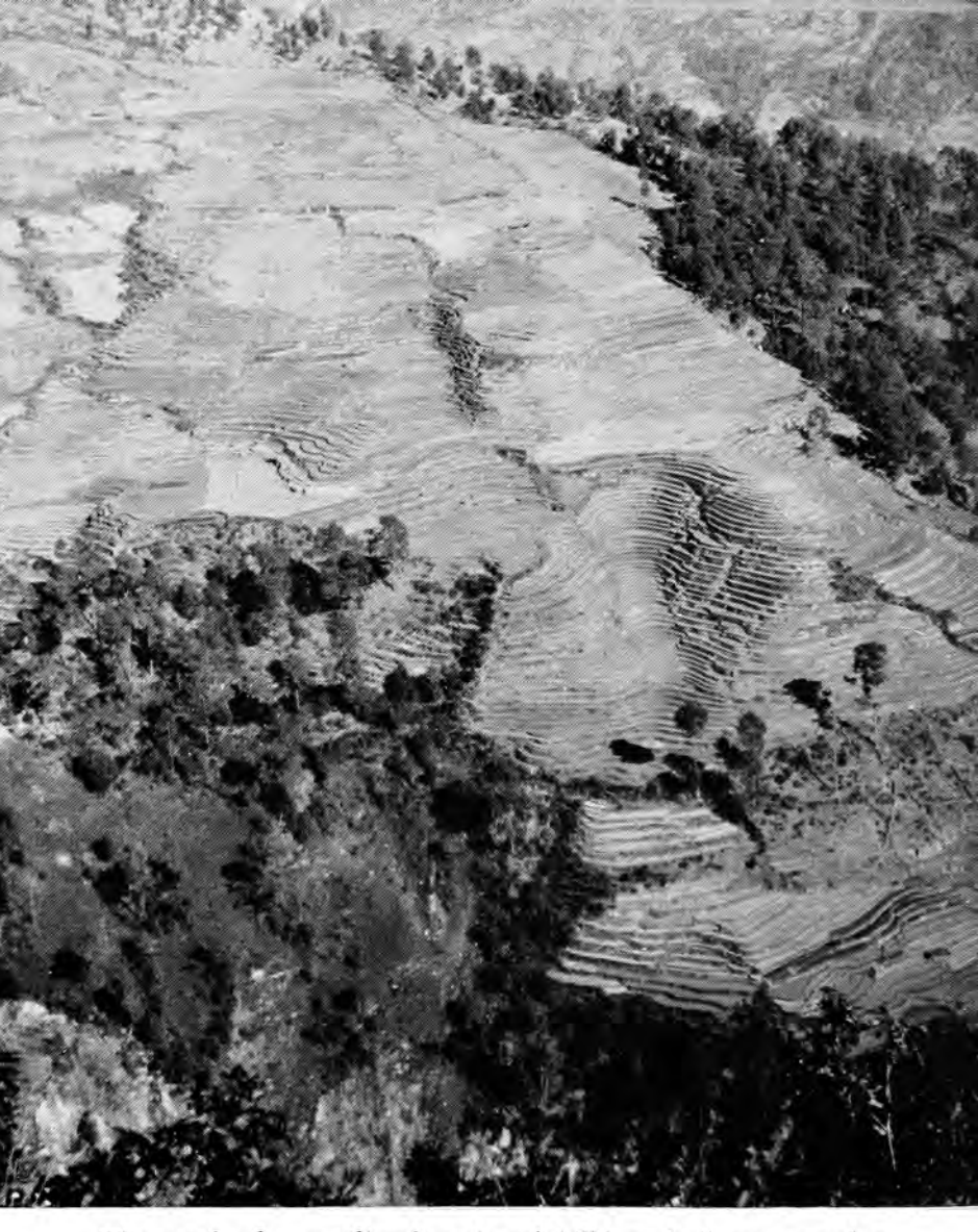
Thousands of years of hard work and skill have built up a wonderful system of irrigated terraces throughout the mountains of Nepal