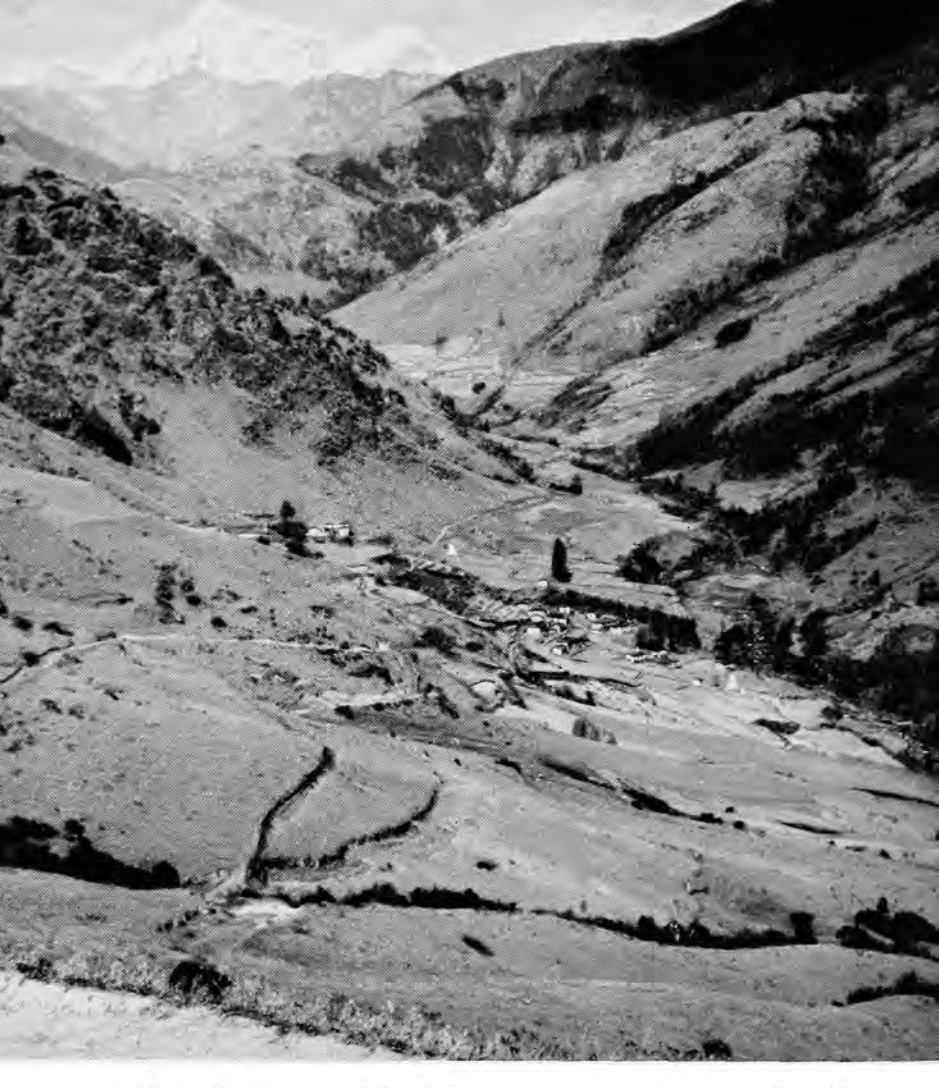
Junbesi, the centre of the Solu country, is set in a gentle valley of lush green slopes