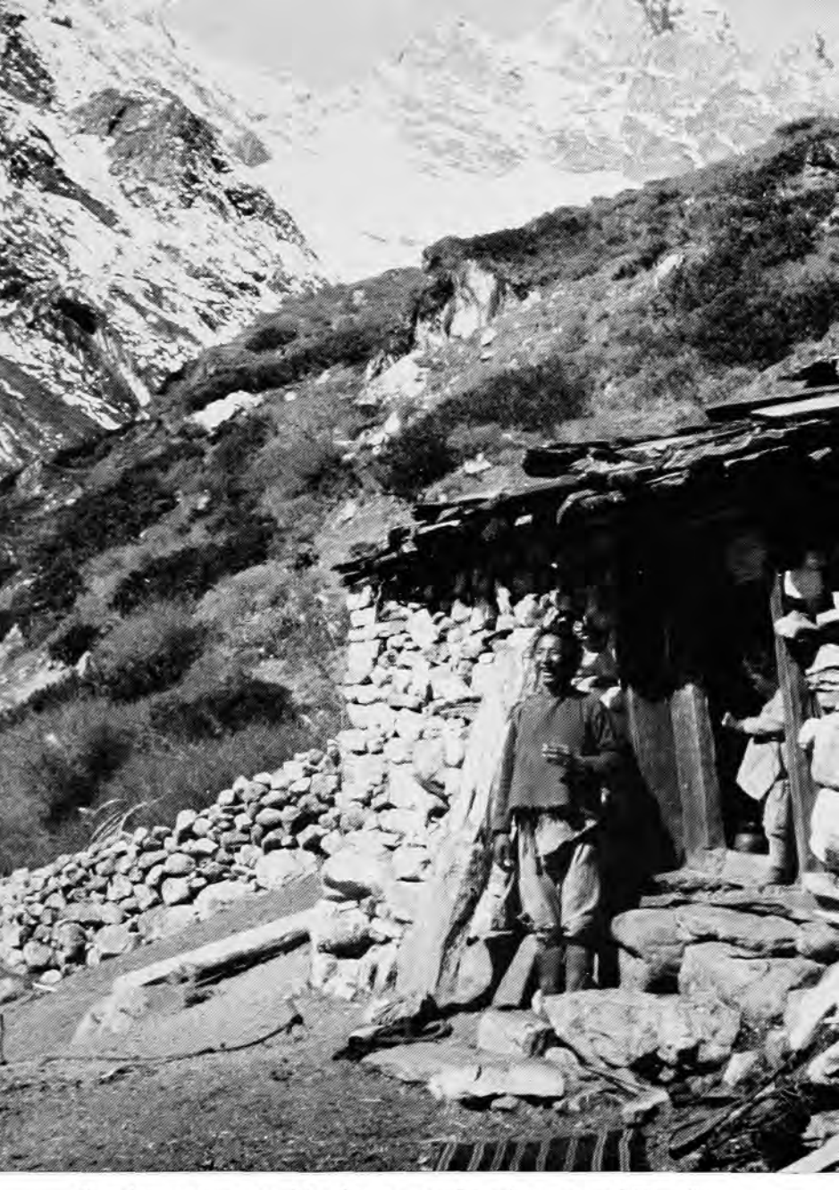
On the way up to Matchemo we found a man of Kumjhung Village out in the wilds with his yaks. He had heard a Yeti only a few months ago