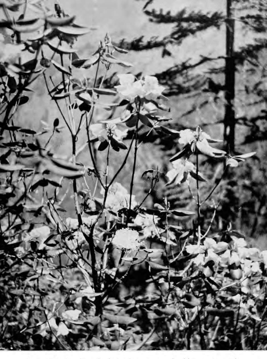
One of the loveliest rhododendrons was a shrubby species with sulphur-yellow bells ( Rhododendron campylocarpum )