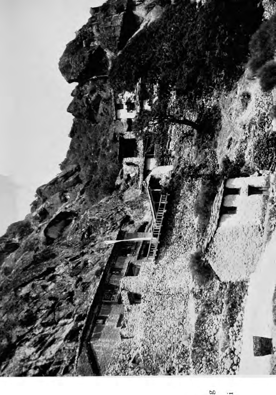
The little monastery of Gondah nestles among the crags above Thami