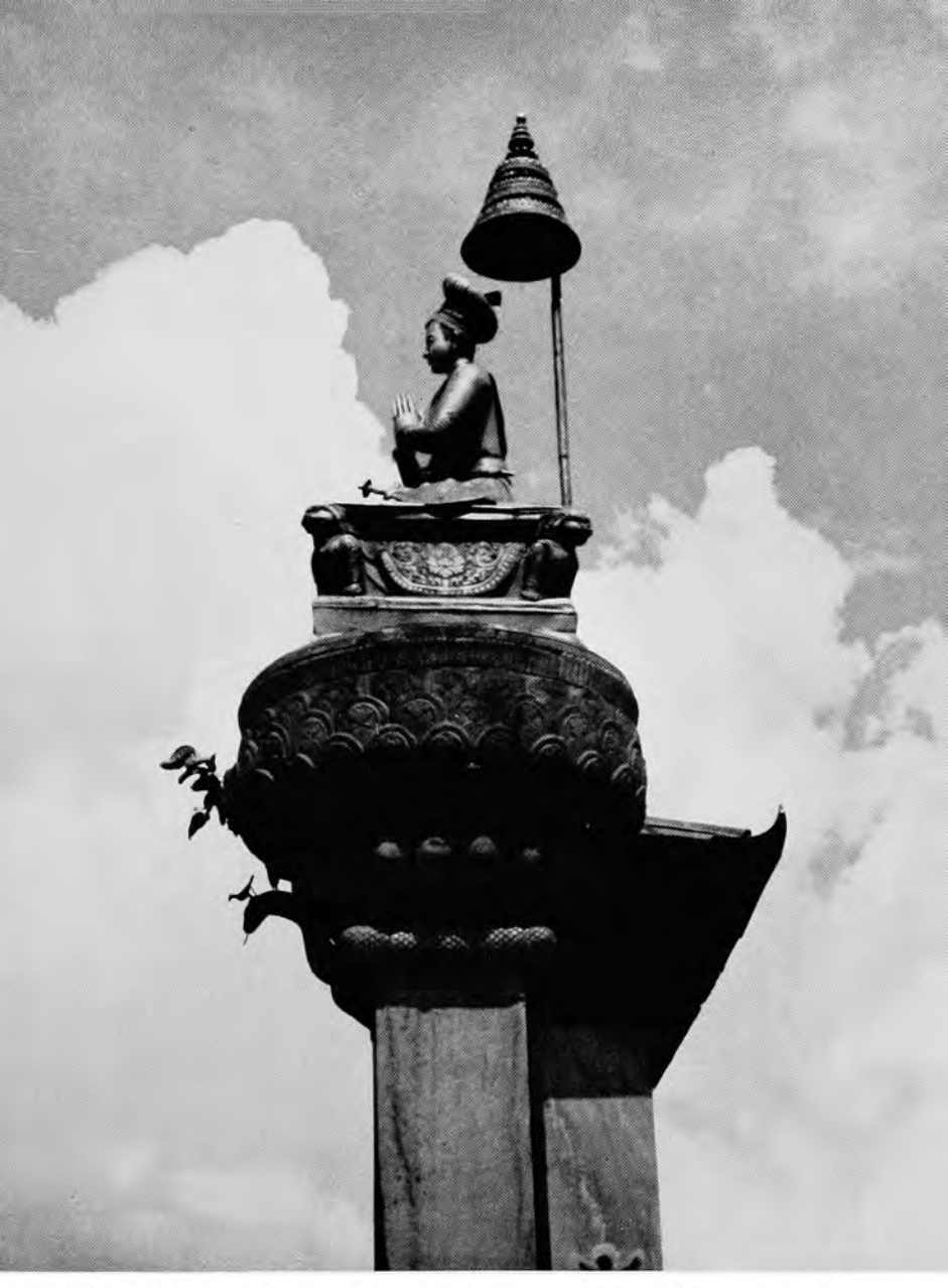
The Newar craftsmen have created many beautiful memorial figures to their past rulers. Prince Bhupatindra looks serenely down on the buildings he set up in the city of Bhatgaon