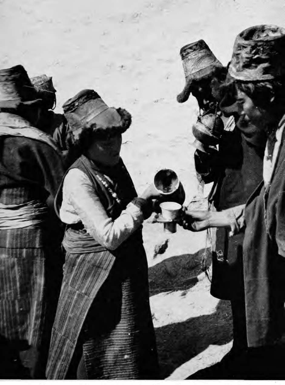
Losahrr, the Sherpa New Year, is celebrated with plenty of good cheer, and everyone vies with his neighbours in dispensing hospitality