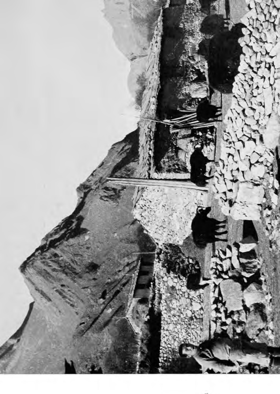
The yakherding people of Phorche village are real children of the bleak alpine world