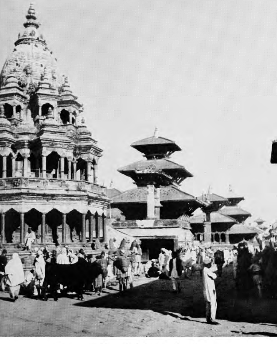
The centre of Patan includes many lovely temples