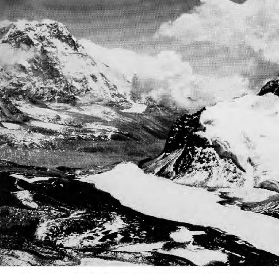
The great bowl of the Hongu glacier includes five frozen lakes, a place of pilgrimage for Gurung tribesmen from the south