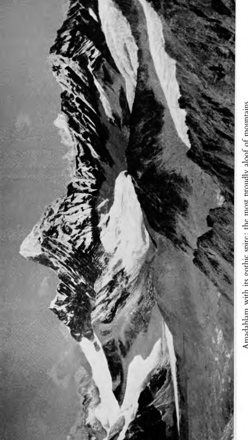
Amadablam with its gothic spire: the most proudly aloof of mountains