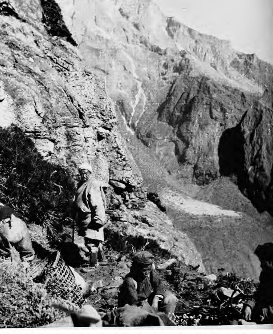
We made camp in typical Yeti country at fourteen thousand feet, across the Bhote River from Namche