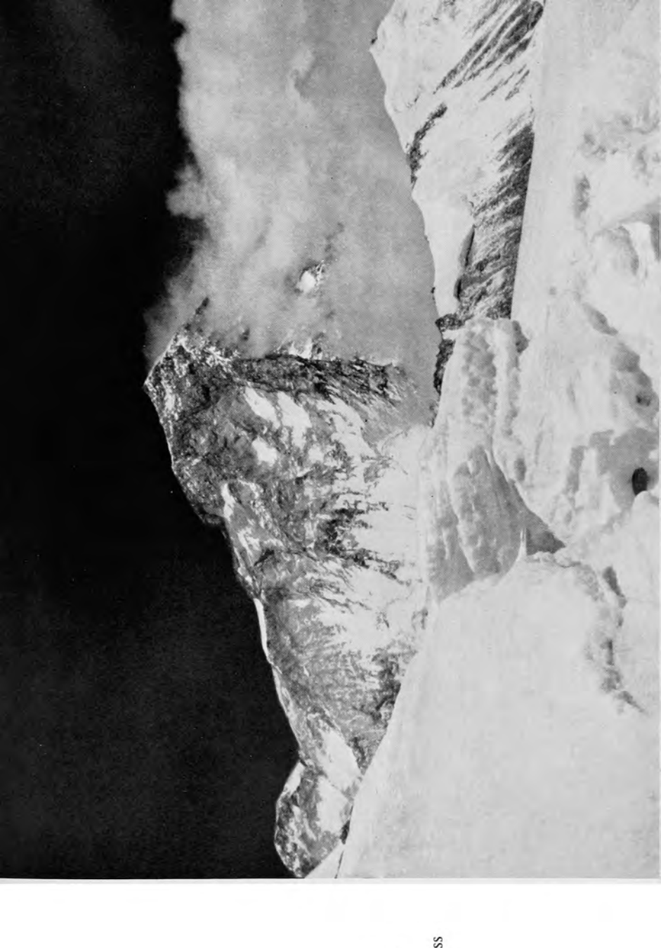
Makhalu from the Barun Pass