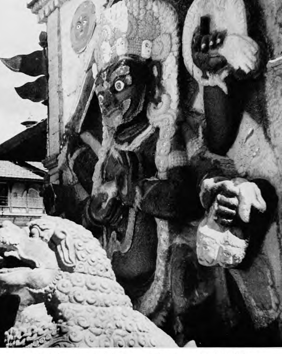
In Kathmandu, Mahakala sprawls hugely over a slab of stone, human heads clutched in his hand