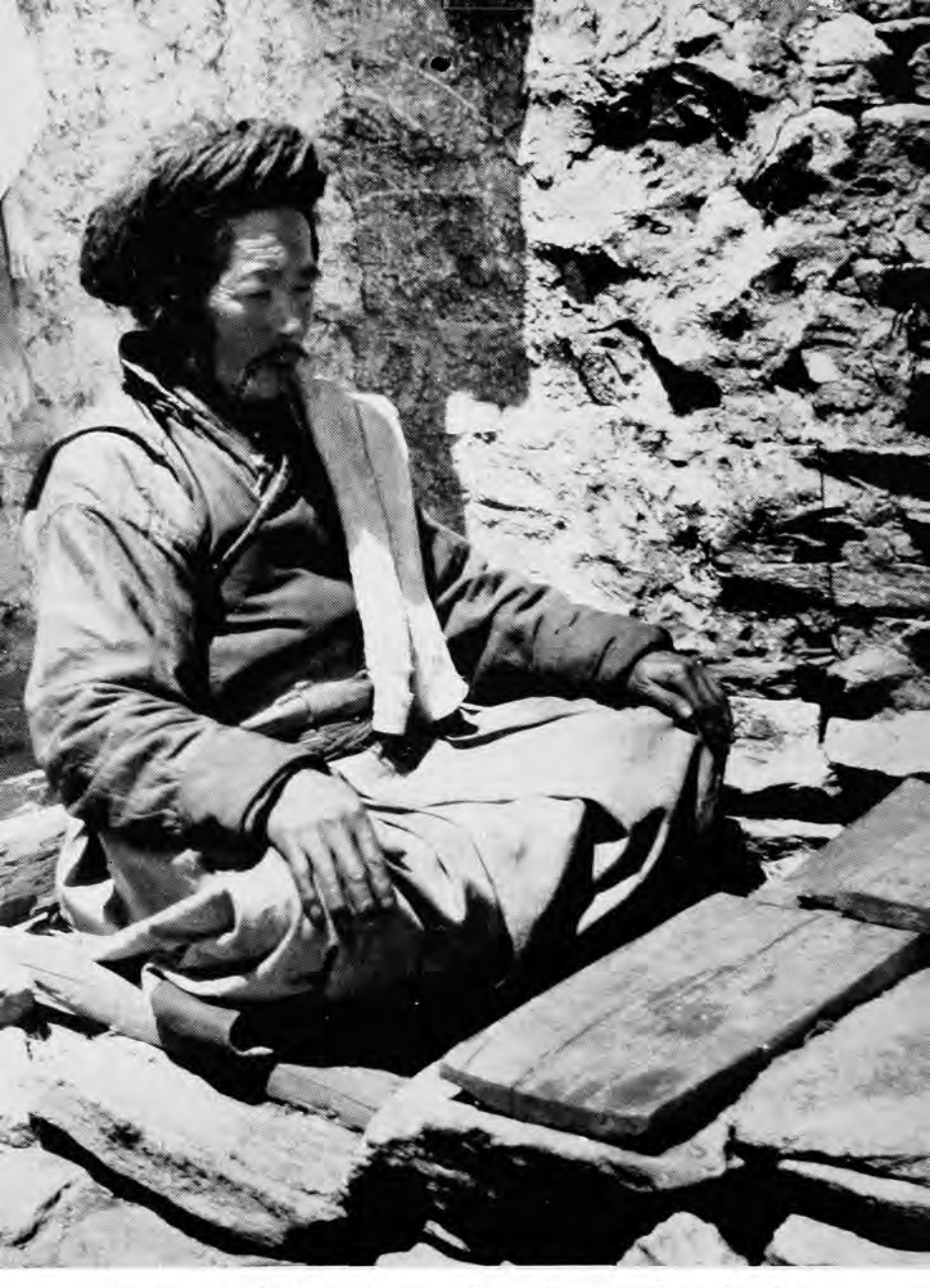
The hermit of Dingboche seemed utterly tranquil. His hands were surely symbolic of great strength of personality