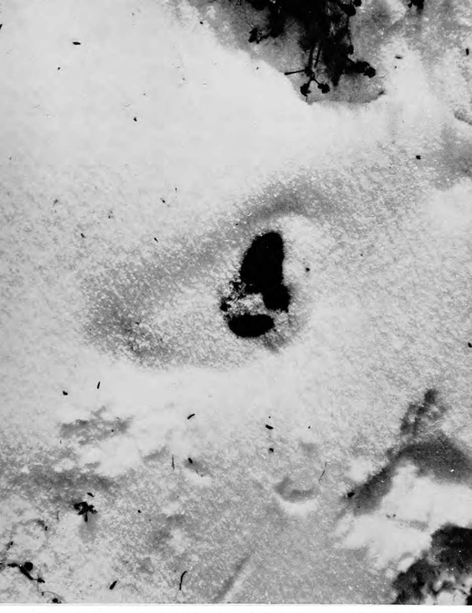
Scattered about in a patch of snow at fourteen thousand feet were numerous man-like footprints