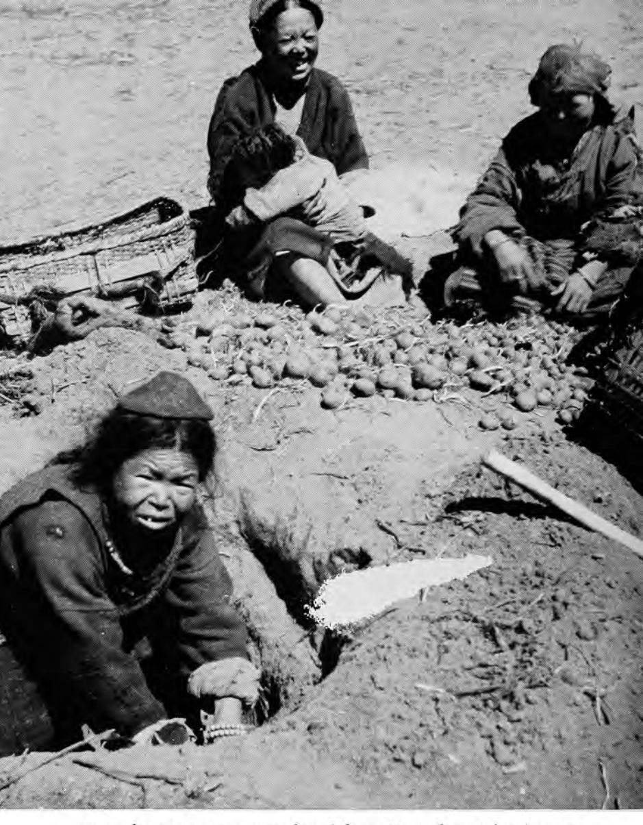
Since the potato was introduced from Darjeeling it has become a most important Sherpa crop. Potatoes are stored in deep pits against the frost