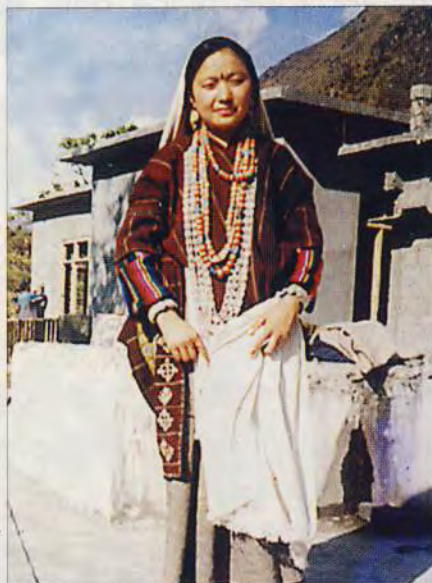
A Shauka Belle of Darchula in her traditional Dress