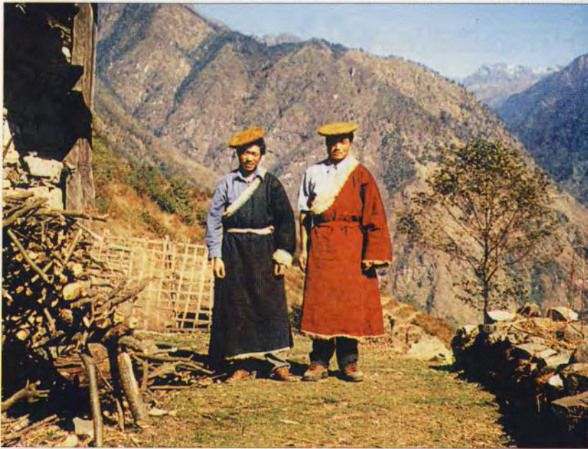
Two Gentlemen from Tokpegola, Taplejung