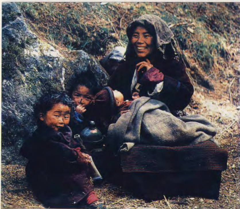
Nupriwa Woman of Gorkha with Kids