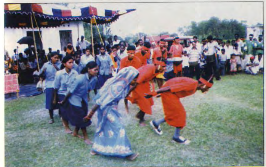
Jhangads of Southern Tarai Performing Traditional Dance