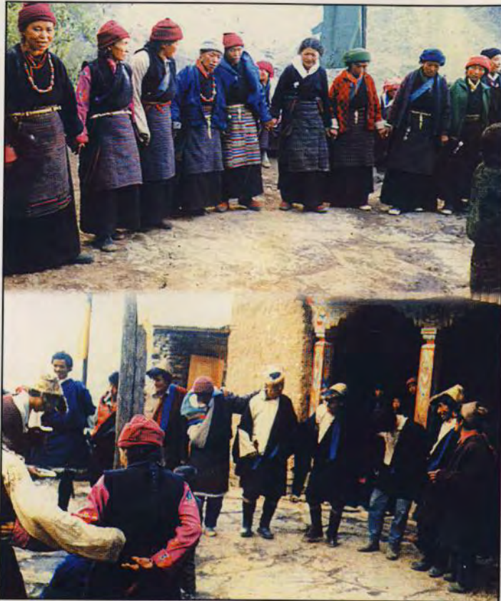
Chumbas of Gorkha Busy in Traditional Dance