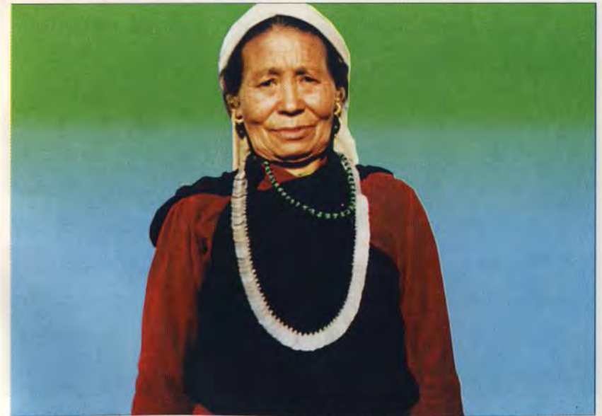
A Lepcha Lady from Ilam

Therefore, it has now become a major responsibility of His Majesty's Government (HMG) of Nepal to