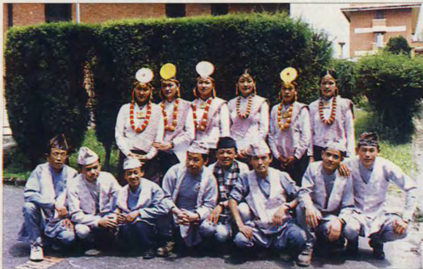
Limbu Youths from Eastern Nepal

While dwelling within this context, it must however be reiterated that considerable delays have been incurred between the time of the enactment of the Act and the actual institutionalisation of the Foundation with the formation of its own Governing Council and