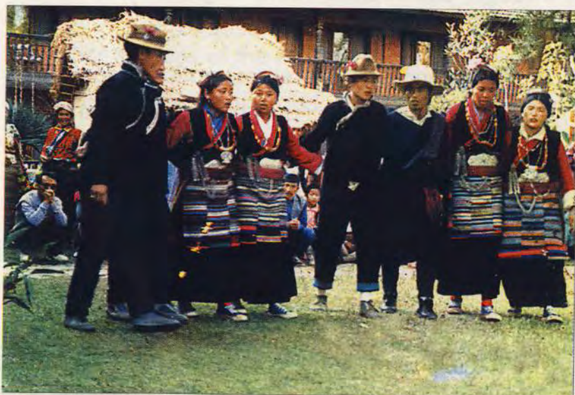
Shingsaba Youths of Arun Valley in Traditional Dance

If case of non-submission of proposals from any relatively more deprived nationalities, the Foundation may visit the concerned communities or nationalities and provide grants to run appropriate programmes by such indigenous nationalities.