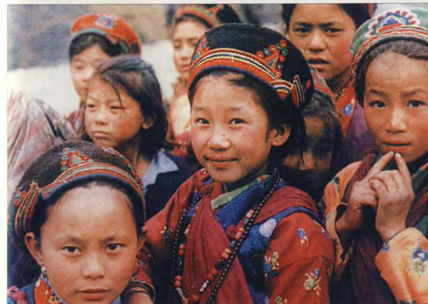
Young Tamang Students in their traditional Costumes