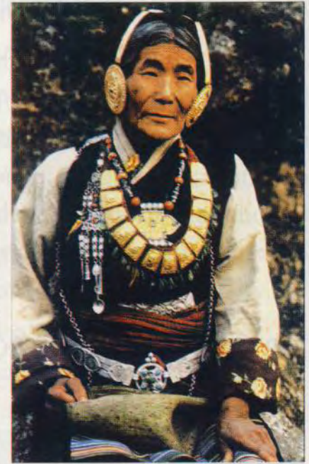
An Old Sherpa Lady

the Executive Committee. While the Act came into effect on February 7, 2002 with the provision that "This Act shall commence at once" (Chapter (I), Clause (2), the physical establishment and institutional formation of the Foundation and the executive appointments thereof took place only in June and July 2003.