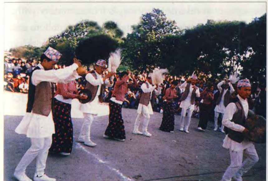
Rais in their Sakela Dance

Consequently, nobody could ever feel that the nation was moving forward with respects to the sentiments of the indigenous nationalities.