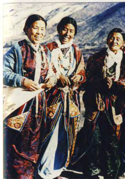
Barahgaunle Ladies from Chhume gyatsha

It is perhaps worth noting that while the Vice Chairman of the Governing Council also acts and operates in the capacity of the Chairman of the Executive Committee, the Member Secretary of both the Governing Council and the Executive Committee also happens to be the same executive officer. This