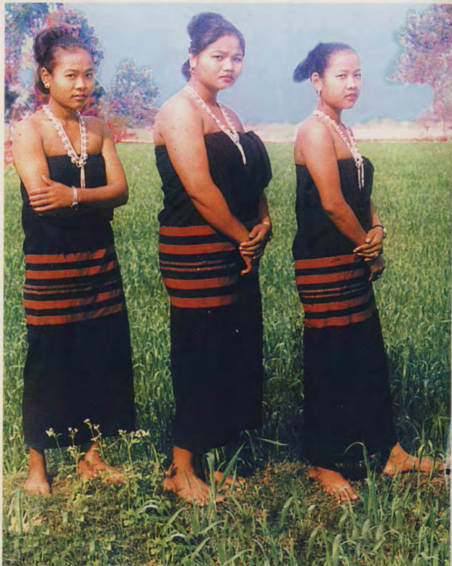
Dhimal Girls of Southern Nepal