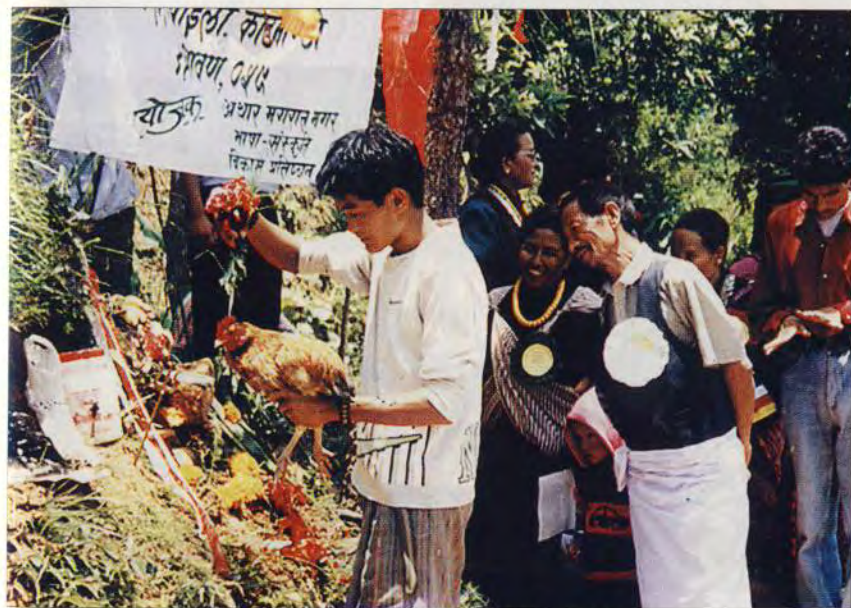
Magars performing Earth Worship

The Ordinance and the resultant formation of the said National Committee, as preparatory steps to larger developments to take place, were replaced by an enhancing Act (Act No. 20 of the 2058 Bikram Sambat/2002 AD) enacted by the Parliament in the "first year of the reign of His Majesty King Gyanendra Bir Bikram Shah Dev" "to provide for the establishment of the National Foundation for Development of