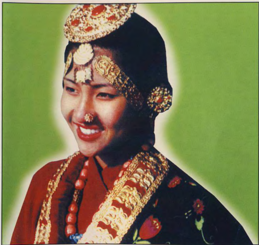
A Gurung Belle