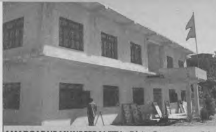
AMARGADHI MUNICIPALITY : Dirty Game