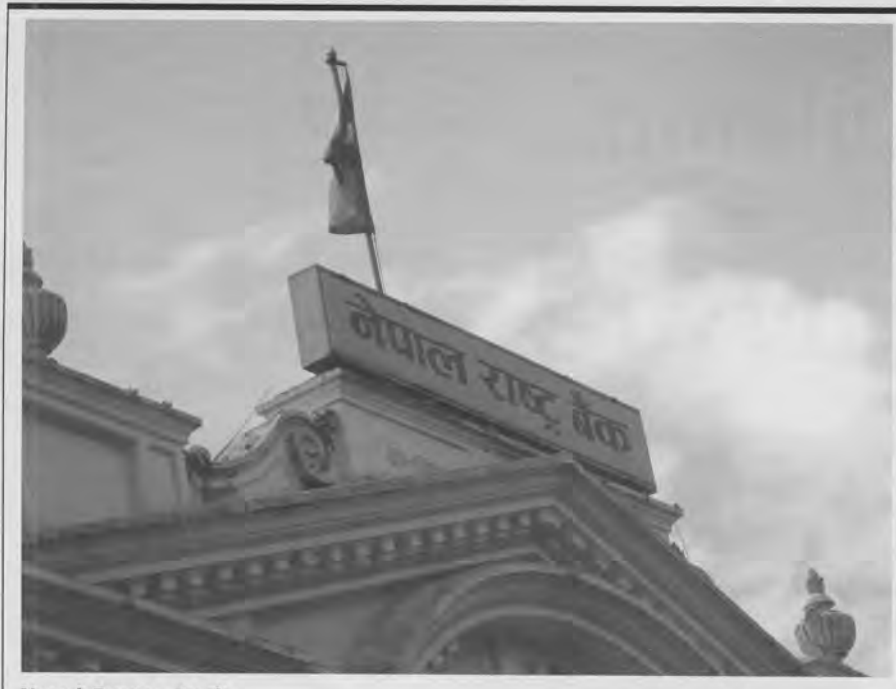
Nepal Rastra Bank