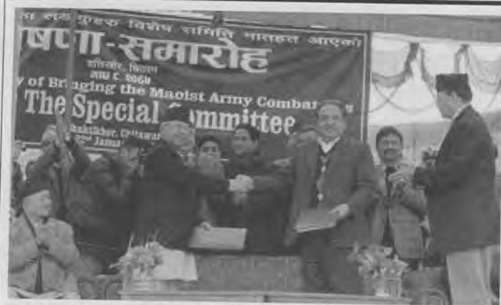
PLA Handover: Confusion Persists

government says, "Madhav Nepal's proposal to make Prachanda the new prime minister is a good move which has been appreciated by all at the Gokarna resort meeting."