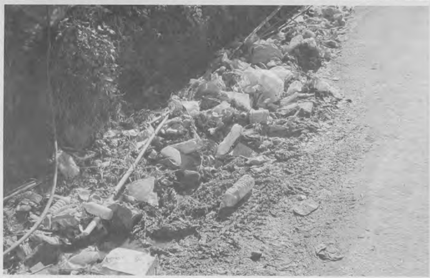
Litter on the roadside

When there is corruption, the situation will definitely go from bad to worse. Amargadhi Municipality's experiences have shown that municipal