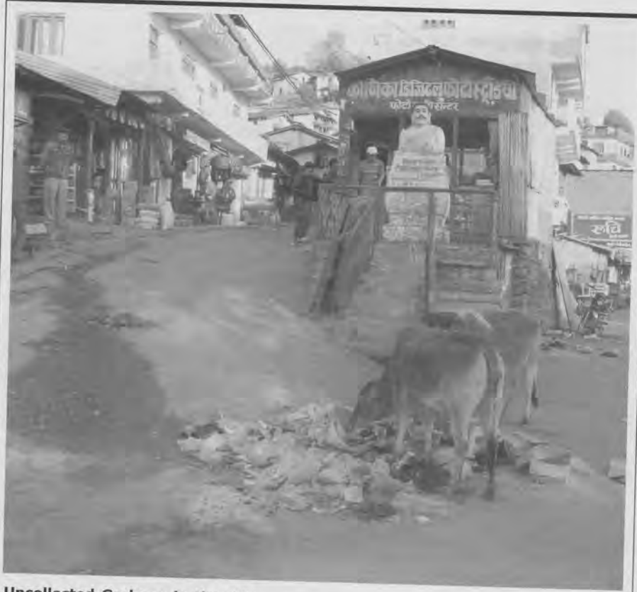
Uncollected Garbage in the City

confident that there is an irregularity in the expenditure."