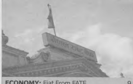
ECONOMY: Fiat From FATF