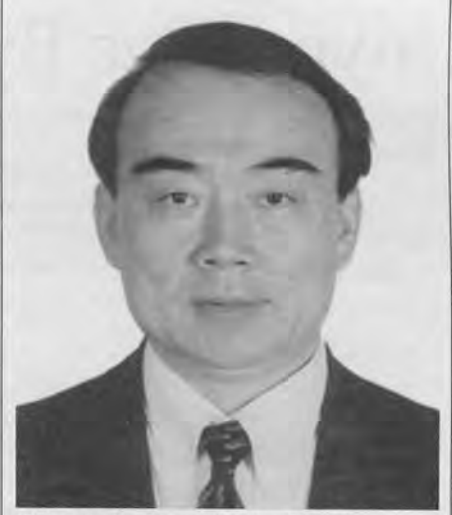
Chinese Ambassador to UN, Li Baodong

When the world body's full-fledged political mission was hounded throughout until it lowered its flag last