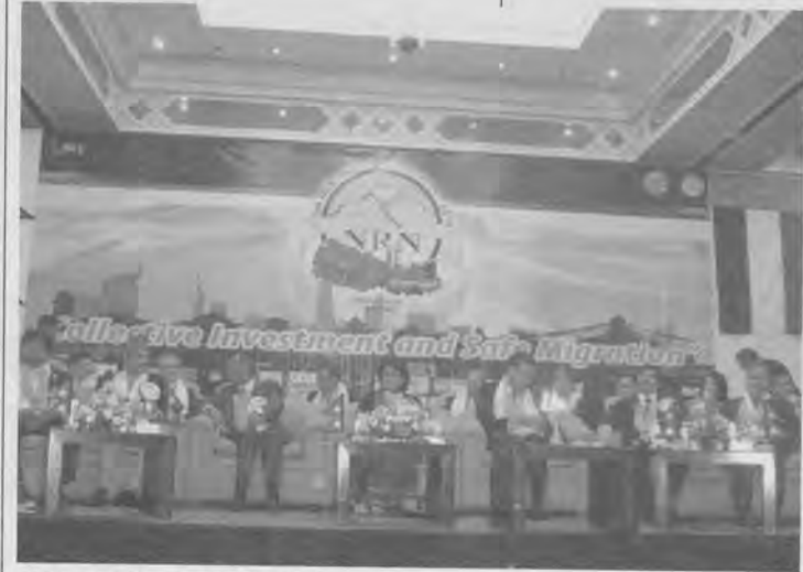
NRN conference in Dubai

Deputy Prime Minister and Foreign Minister Sujata Koirala, too, urged the