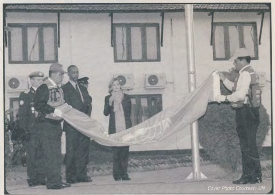
COVER STORY: UNMIN'S EXIT Common Agenda Uncommon Unity

Vol.: 04 No.-15 Jan.21-2011 (Magh 07, 2067)