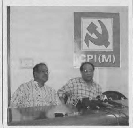
CPI (M) Leaders

opposing Bangla O Bangla Bhasa Bachao Committee commenced a 48