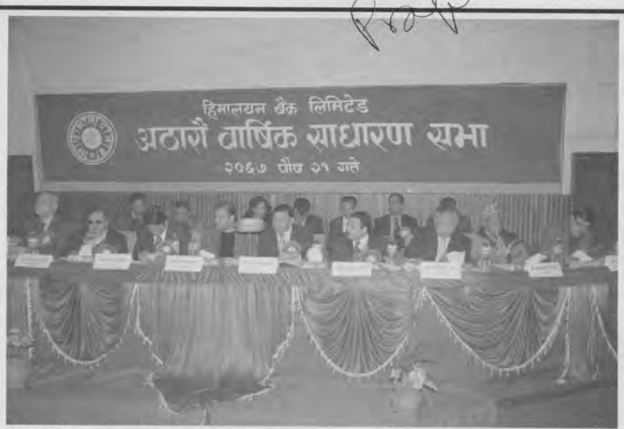
Himalayan Bank AGM