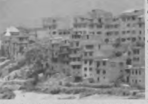
at risk from an Kathmandu Valley: Haphazard construction

But it is said K athmandu would suffer the worstlosses. Very