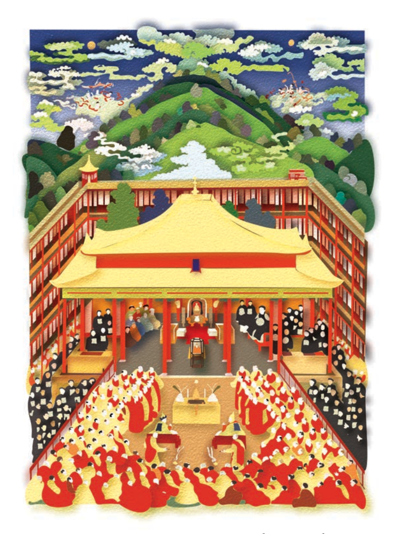
Fig. 1. Copy of "Qianlong's Painting of Ten Thousand Dharmas Return as One" © Olga Ważny ^{12}

The Qing Emperor Qianlong (1711–1799) granted an audience to Ubashi and other representatives of the Kalmyk nobility at the imperial residence in Jehol. The scene of the banquet hosted by