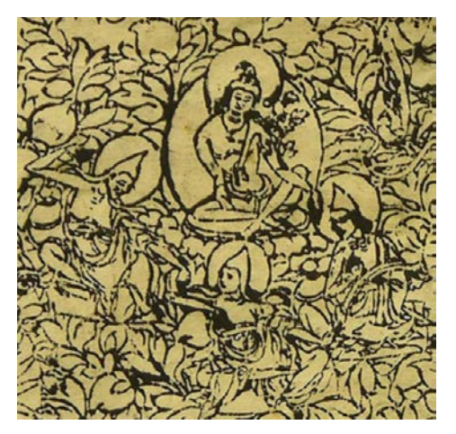
Fig. 3: Yogacāra gurus Lineage