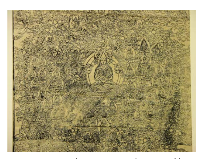
Fig. 2a: Masters and Deities surrounding Tsong kha pa