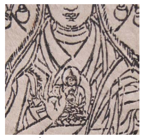
Fig. 10: Śākyamuni and Vajradhara at the heart of Tsong kha pa