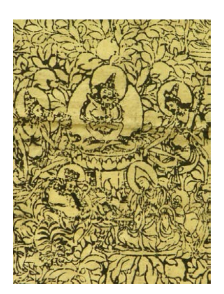
Fig. 5: Lineage of the gurus of tantric instructions