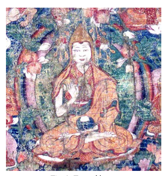
Fig. 9: Tsong kha pa