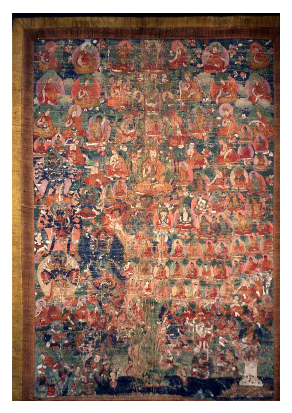
Fig. 1: Tshogs zhing . Thang ka. Private Collection.