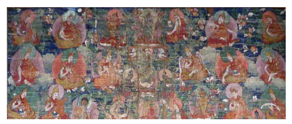
Fig. 7: Lineage of dGe lugs pa gurus of the bla ma mchod pa instruction