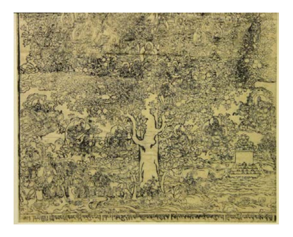
Fig. 6: Lower classes of deities and inscription