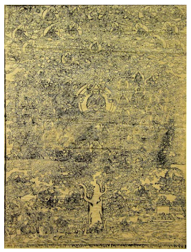
Fig. 2: Tshogs zhing. Wood-block. IsIAO Library.