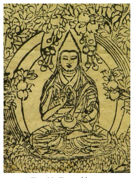
Fig. 11: Tsong kha pa