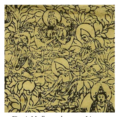
Fig. 4: Madhyamaka gurus Lineage