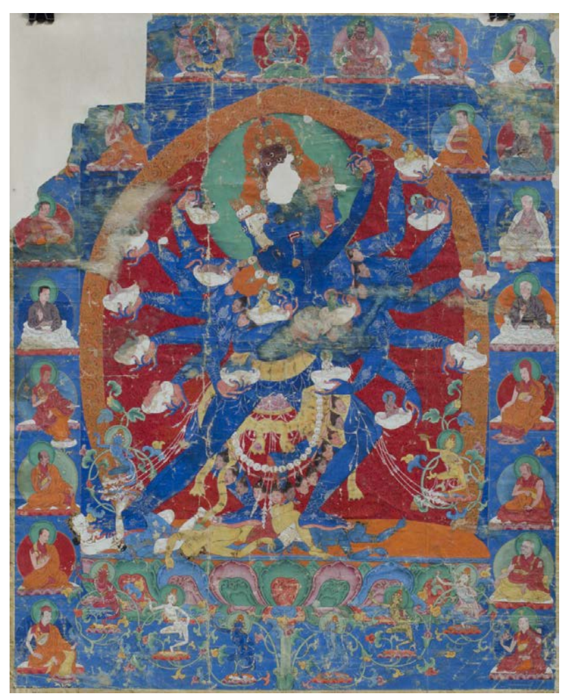
Figure 1: Hevajra Thangka; Central Tibet (Southern dBus), late 15<sup>th</sup> century; pigments on cloth; private collection; Credits: C. Luczanits 2015 (D0323).