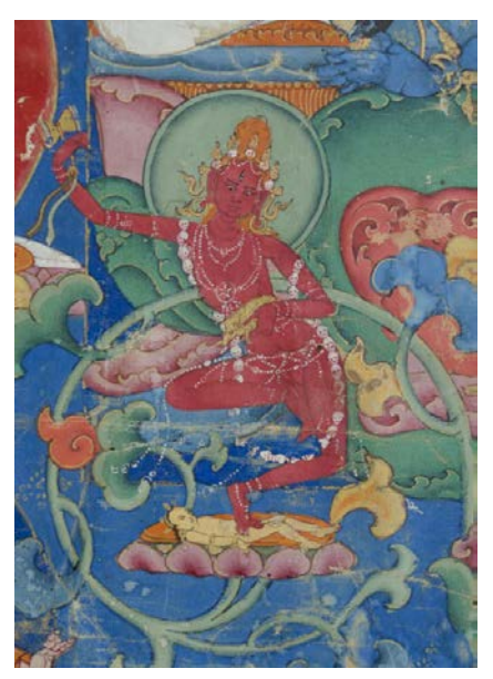
Figure 4: Caurī Dākinī; detail of Fig. 1. Credits: C. Luczanits 2015 (D0385).