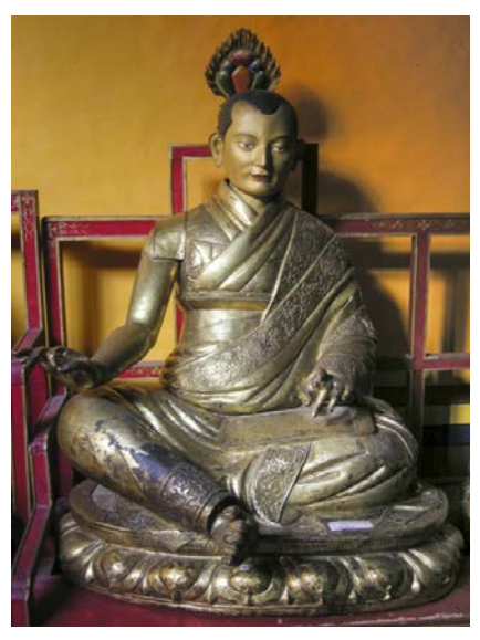
Figure 14: Theg chen chos rje Kun dga' bkra shis; Central Tibet (Southern dBus); second half of the 15<sup>th</sup> century; gilt and painted copper repoussée; h. 90 cm; sMin grol gling Monastery.