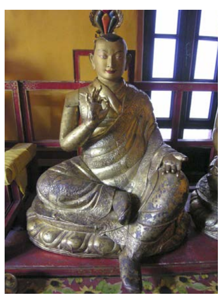
Figure 15: Last teacher of the sMin grol gling set; Central Tibet (Southern dBus); second half of the 15<sup>th</sup> century; gilt and painted copper repoussée; h. 86 cm; sMin grol gling Monastery.