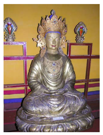
Figure 12: Indian yogin Gayadhara; Central Tibet (Southern dBus); second half of the 15<sup>th</sup> century; gilt and painted copper repoussée; h. 111 cm; sMin grol gling Monastery. Credits: C. Luczanits 2007 (D9409).