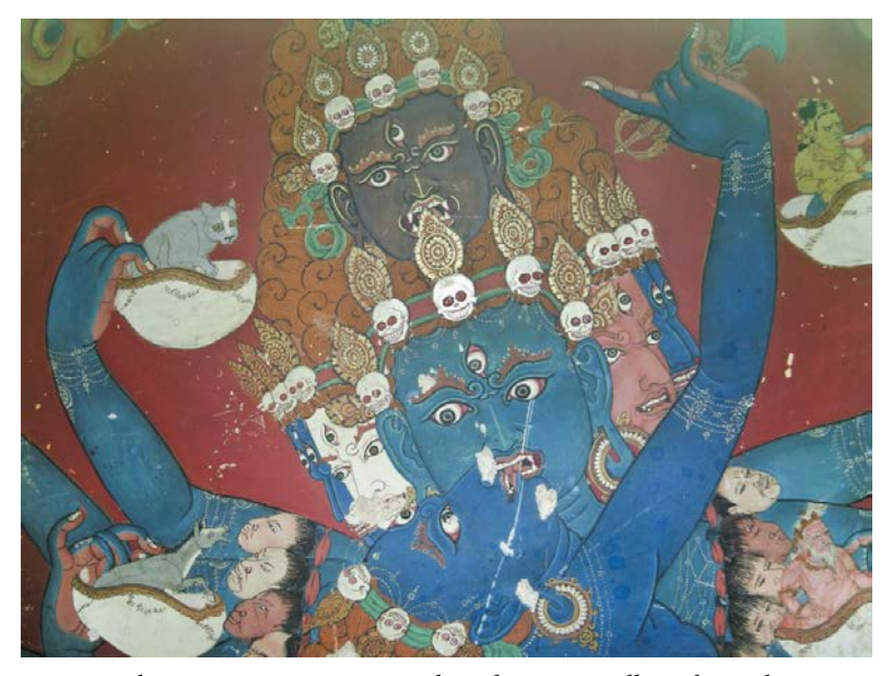
Figure 3: Heads of Hevajra; Hevajra Chapel of Gong dkar chos sde Monastery; Central Tibet (Southern dBus); second half of the 15<sup>th</sup> century.