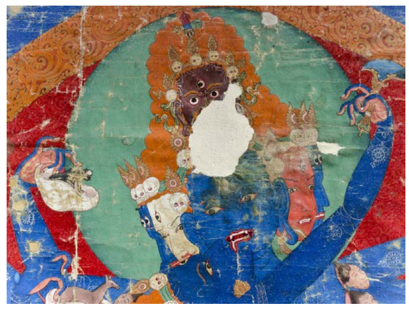
Figure 2: Heads of Hevajra; detail of Figure 1; Credits: C. Luczanits 2015 (D0330).