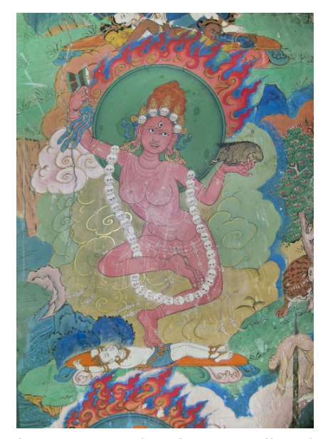
Figure 5: Caurī Þākinī; Hevajra Chapel of Gong dkar chos sde Monastery; Central Tibet (Southern dBus); second half of the 15<sup>th</sup> century.