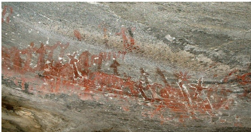
Pl. 2: Lwethap, horizontal orientation of human figures.