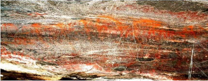
Pl. 13. Lwethap, lower rock shelter, red lines associated with human figures.