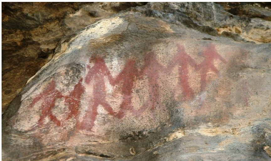
Pl. 1: Lakhu-udyar, horizontal orientation of human figures.