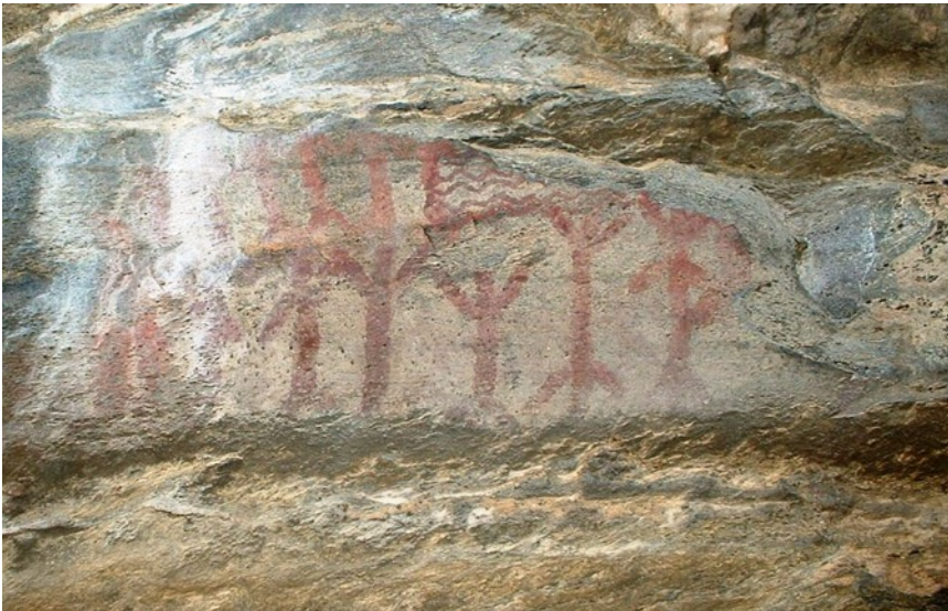
Pl. 14: LakhuUdyar, red lines associated with human figures.