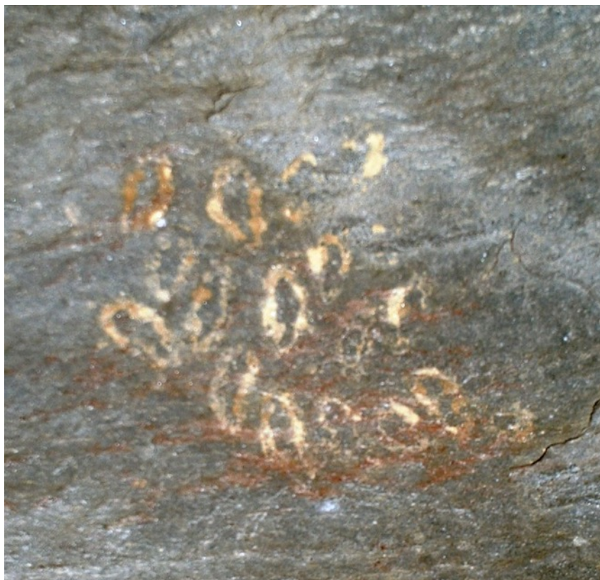
Pl. 8. Lakhu-Udyar above Forest Checkpoint, vulvas.