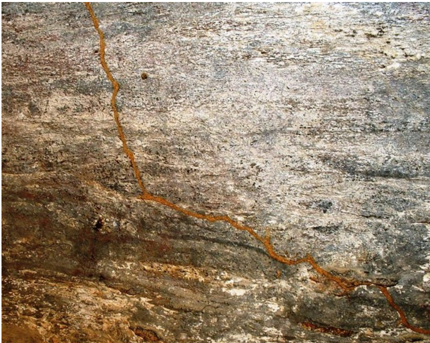
Pl. 10: LakhuUdyar, imposing rock shelter above Forest Checkpoint, long wavering red line.