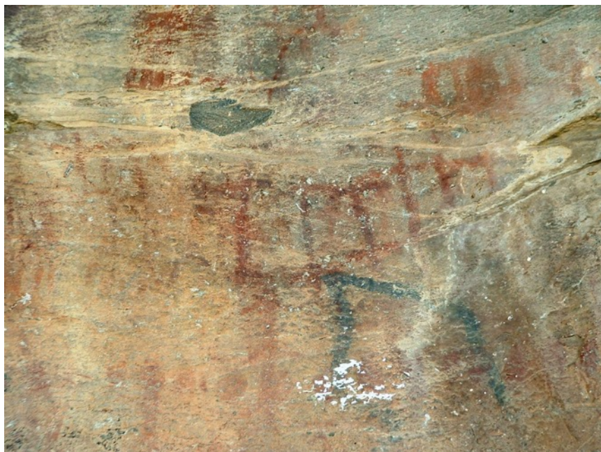
Pl. 3: Phalsima, horizontal orientation of human figures.