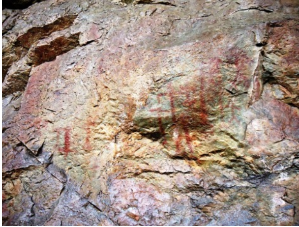
Pl. 5. Ghatgarh rock shelter, human figures jumbled up in conglomeration.