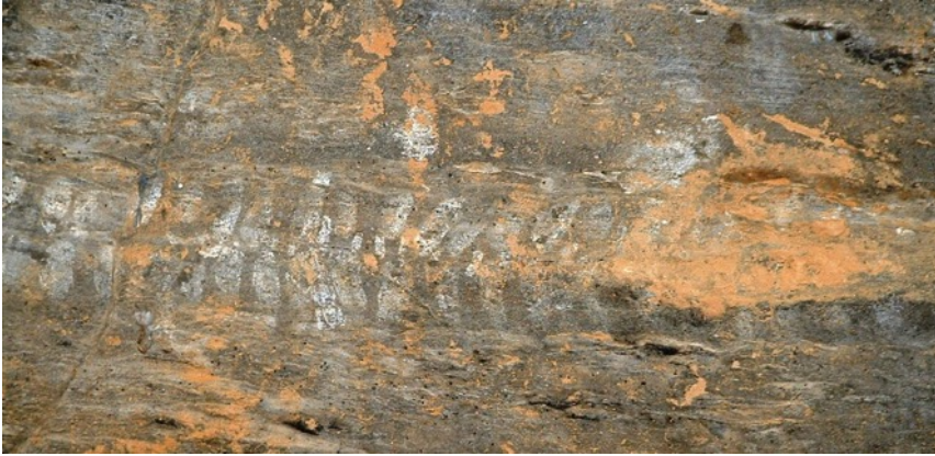
Pl. 9. LakhuUdyar, imposing rock shelter above Forest Checkpoint, alignments of short lines.