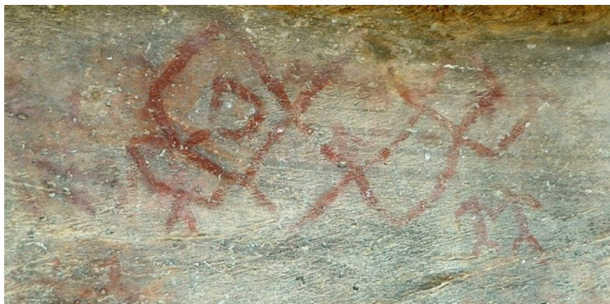
Pl. 7: Phalsima, alignments of short lines.