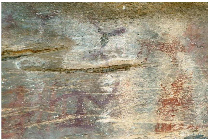
Pl. 12. Phalsima, beheaded human figures in black.