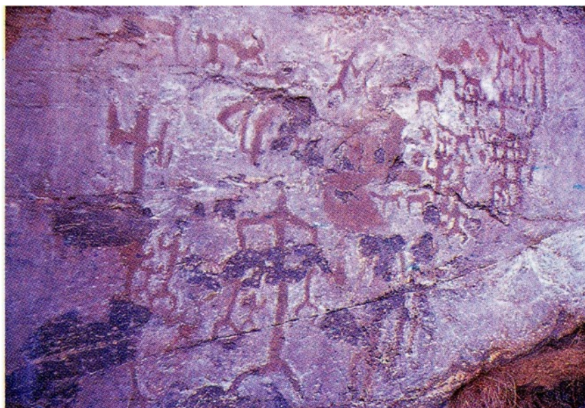
Pl. 4: Gvarkhyavadyar, human figures jumbled up in conglomeration.