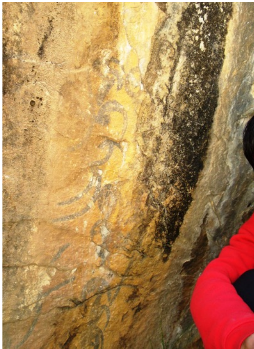
Pl. 6. Hudoli, perpendicular row of hieroglyph-like motifs.