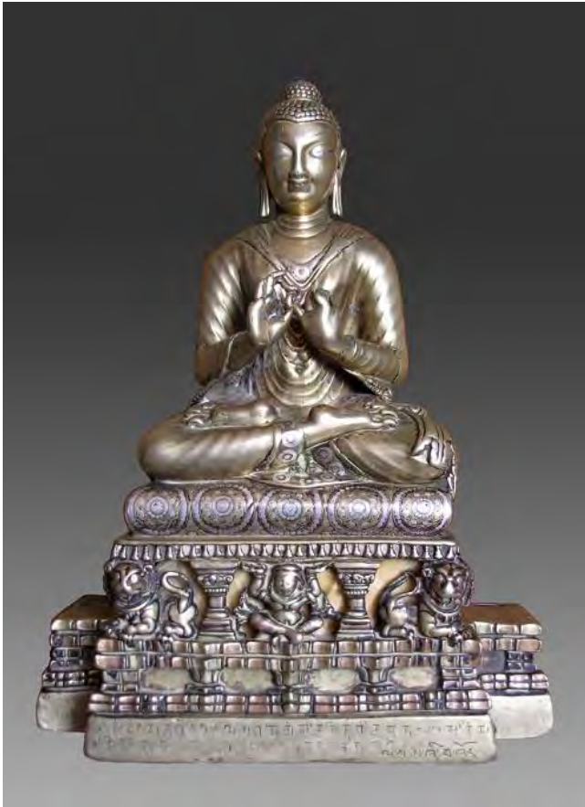
Fig. 14 — Buddha from Dangkhar, 8 th century, Gilgit, h.26cm.