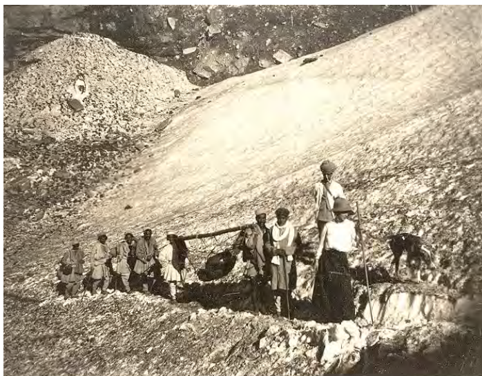
Fig. 5 — Inez Esther Dorothea Shuttleworth crossing a glacier between Kulu and Spiti.