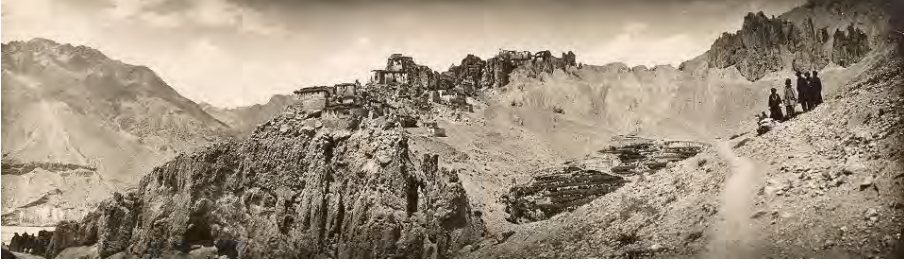
Fig. 12 — View of Dangkhar settlement, the ancient capital of Spiti. Photo: D722/30 photo 1119/5 0009 © British Library Board.

On each of his visits Shuttleworth sojourned in Dangkhar where he held office on behalf of the British Raj. The old capital of the valley was established on a prominent spur overlooking the confluence of the Spiti and Pin rivers (fig. 12-13). The settlement consisted of a monastic complex, a village, and the district fort ( mkhar rdzong ) located on top of the ridge. As the seat of the local government and administrative centre of the valley, the study of the old capital is a key component for the understanding of Spitian history. 35 Within this context, the monastery at Dangkhar was an integral part of the historical, social, economic, and religious dynamics at work. Here again, Shuttleworth's documentation is particularly relevant: