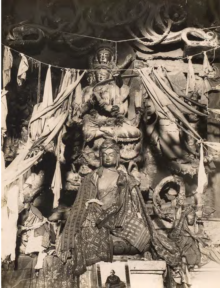
Fig. 9 — Interior view of Gumrang Temple, Lahul.

But after Francke's death in 1930, and for reasons that partly elude us today, 23 volume four of Antiquity of Indian Tibet never appeared and Shuttleworth's embryonic manuscript sank into oblivion. As for