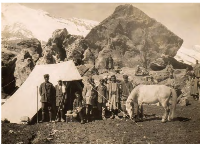
Fig. 6 — Mrs Shuttleworth in front of her tent with porters and attendants, Western Himalayas. Photo: MssEur D799/29 photo 1119/4 0016 © British Library Board.