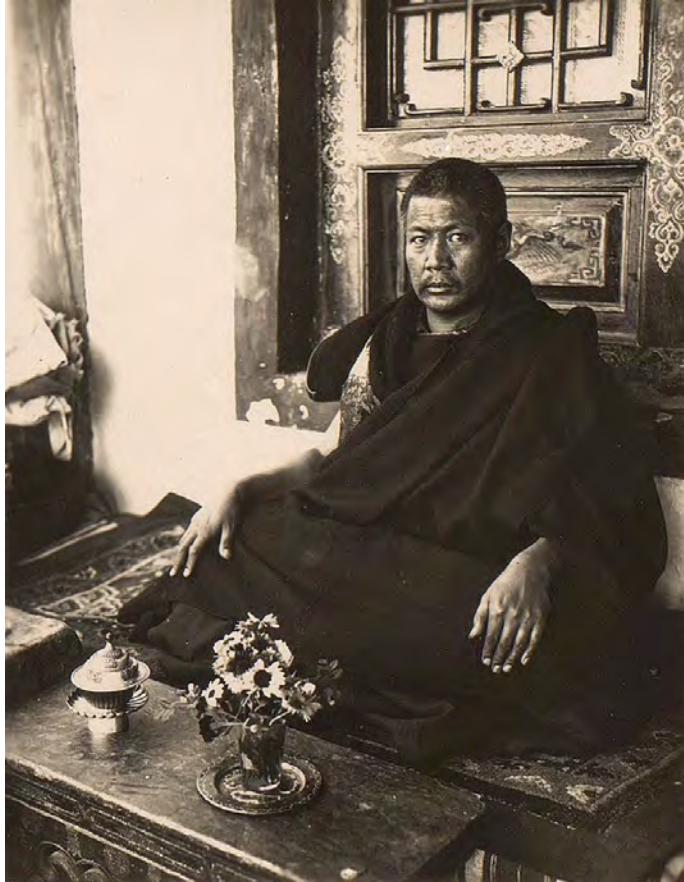
Fig. 10 — Portrait of the 5 th Kyabgon Taksang Rinpoche (c. 1884–1939), Hemis Monastery, Ladakh.

the few scholars who took in interest in them. 27 Their content, however, not only reveals the depth of Shuttleworth's erudition but also attest to his versatility as historian, linguist, and epigraphist.