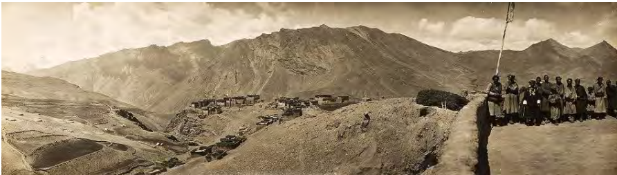
Fig. 7 — Village of Kyibar and Shuttleworth’s camp pitched in the fields below, Spiti.

“Perhaps you don’t know what I’m working on so here goes. All started long ago: Twenty-nine villages north of Sutlej River and south of Kashmir where there were Serpent Deities Naga – Devatas. Only four to five were known before I found them and the stories about one family of Nagas in north Kulu, the children of a Naga Raja and a Kulu girl; So far, in Kulu, the seven wood temples. I discovered three of the oldest form. I hope to do a monograph on these [...]; Three hill languages one not done in Linguistic survey of India. Two other languages had been wrongly placed.”