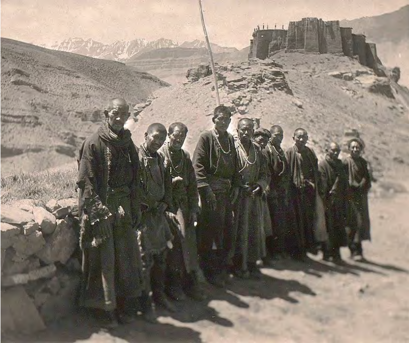
Fig. 1 — Sakyapa monks in front of Tengyu Monastery, Spiti.