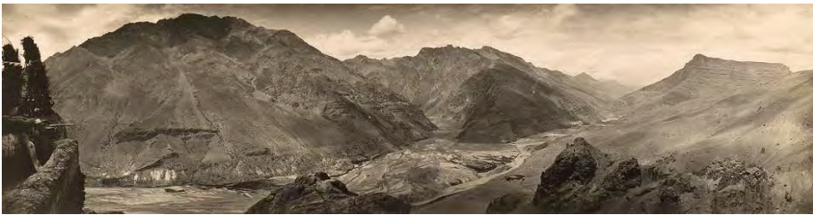
Fig. 13 — View of the junction between the Spiti and Pin rivers from the top of the district fort at Dangkhar, Spiti. Photo: D722/30 photo 1119/5 0009 © British Library Board.

Whilst the founding history of Lago Monastery remains to be explained, the mysterious image discovered by Shuttleworth at Dangkhar in 1924 had a vastly different story. This spectacular bronze not only played hide and seek for almost a century, but its enigmatic inscription filled the mind of Shuttleworth for many years (fig.14). The earliest known photograph of this image was taken in 1993 when the statue was recorded under the Antiquities and Art Treasure Act of India due to its immense value and antiquity. In 2006, art historian Robert Linrothe took a glimpse at the metal sculpture but was not authorized to reproduce it. 38 It is only in 2010 that the present author was entrusted by the monks from Dangkhar with the study of their sacred image, a request completed two years later. 39