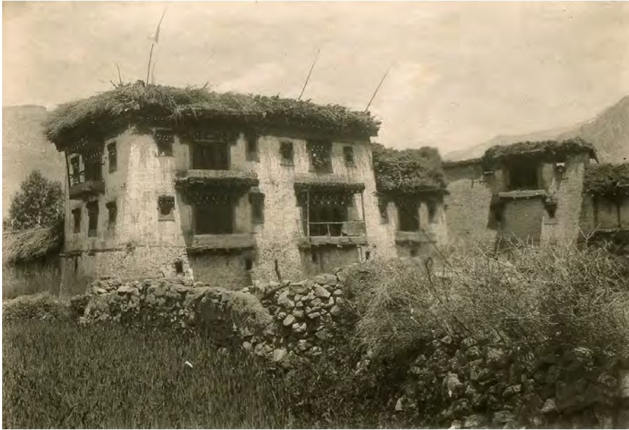
Fig. 11 — House of a village headman, Mani, Spiti. This image was first published in The Times of India Illustrated Weekly , April 14, 1920, with the following caption: “This photo depicts a large house in Mani in the lower part of the Spiti Valley. It belongs to the Gatpo Chenmo, or ‘Great Headman’ of a group of villages. Above all the windows and below the roof is an ornamentation of red and yellow paint. Brushwood is used for supporting the earth roof, also decoratively above the doors, where its ends are cut off flush.

Leaving no stone unturned the methodical civilian also conducted an ‘epigraphical survey’ during his second visit of the valley in July 1918. Shuttleworth stopped in many villages looking at ornate slates engraved with mantras and depictions of Buddhist deities forming long votive walls. In doing so, three stone inscriptions were notably recorded in Lower Mani ( mani ’og ma ) and in Dangkhar ( brag mkhar ) (fig.11). 33 These epigraphic documents of historic value were captured on paper and have been discussed in greater detail by the author elsewhere. 34 They are of significant interest as they provide the names of local donors and members of the nobility. Moreover, they refer to governors who administered Spiti on behalf of the kings of Guge and Ladakh, whose names make it possible to date the engraving of these votive slates.