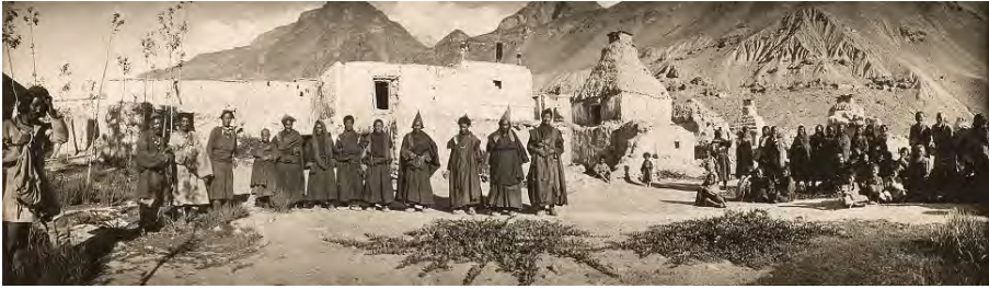
Fig. 8 — Gelugpa monks and villagers assembled in front of Tabo Monastery, Spiti.

Library and the Royal Geographical Society in London, the National Media Museum in Bradford, and other European institutions. 18 They include stunning panoramic views of these regions (fig.2, 7, 8, 12, 13), photographs of Buddhist monuments and works of art (fig.9), images of local architecture and stone carvings, as well as many portraits of villagers, nomads, aristocrats, and religious figures (fig.10).