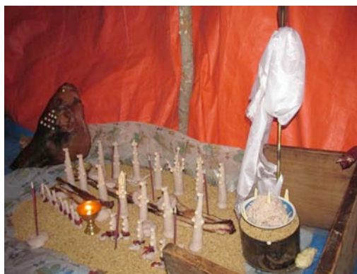
Fig. 1. Lhabse altar with pig's head, tom and offerings. Photo: Johanna Prien, 2015.

and doma . 7 The five specialists and Au Wangmo, the sponsor, stayed in the hut for four days. Each day, sessions mainly consisting of the mediums chanting and being possessed by their lha were carried out with different procedures.