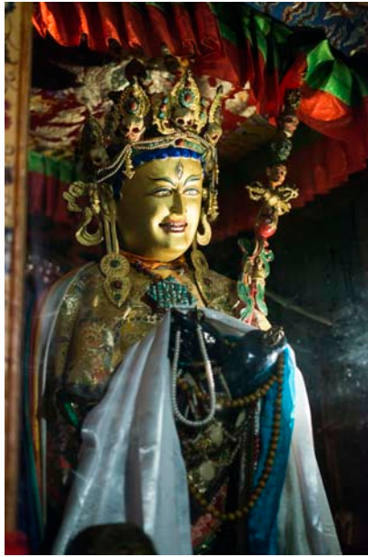
Fig.1- The Cakrasaṃvara statue at Drangsong Sinpori. According to the caretakers the statue is original and was hidden safely during the Cultural Revolution (Photograph by Matt Linden).