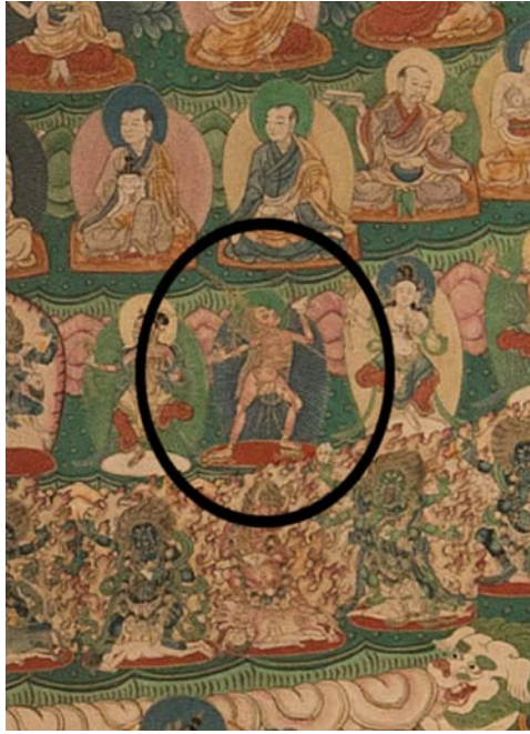
Fig. 3 - Detail of Vajrayogini from Fig. 2.