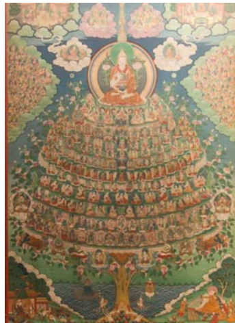
Fig.2- Thangka of the Guru Pūjā assembly field with a depiction of Vajrayoginī, ranked among the class of enlightened dākinīs . This layout of the assembly field differs from that described by Phabongkha. Qing Dynasty, Yonghegong Temple, Beijing.