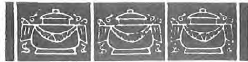
Number of cards: 6 Color of 'triple design': black