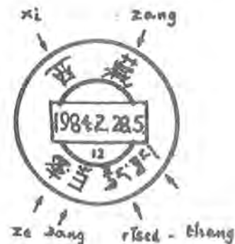
Type CIO cancellation of Tsethang