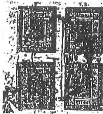
2 annas Chisapani 1928

An unusual page from the Nepal collection of Dick van der Wateren includes a fine classic 2-anna block of 4, with the upper right stamp inverted, bears a complete postal cancel. To this writer, however, the use of a relatively rare Birganj postal cancel some 20 years after it was 'retired' from postal service is unique, as we have never before seen such usage on a telegraphic receipt. Most remarkable!