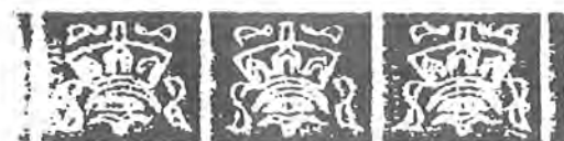
Number of cards: 12 Color of 'triple design': pink