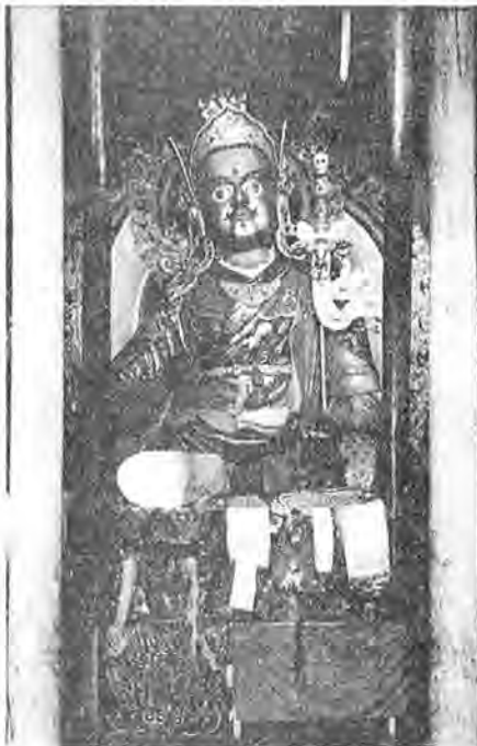
Padma Sambhava, also called Guru Rimpoche. See article on page 6, titled "BHUTAN - A CORRECTION OFFERED", by George Bourke.