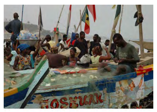
Elmina, a fishing village and site of an infamous slaving castle, lies to the west of Winneba and was our destination for the workshop free day.