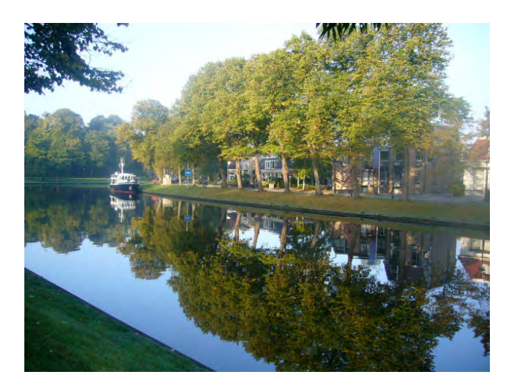
Ljouwert 2008 - a characteristic view at FEL XII