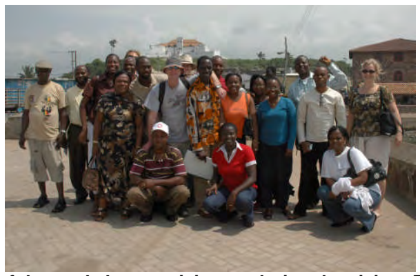
Some of the workshop participants during the visit to Elmina.