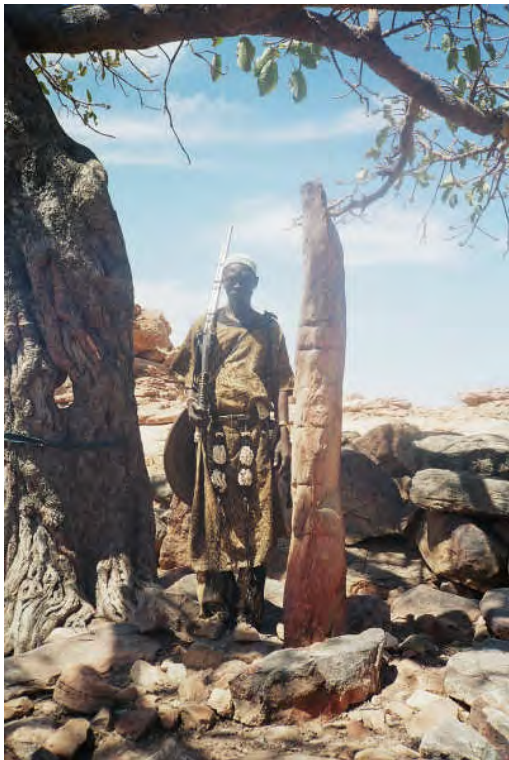
Photo 2: A villager from Menti dressed up as a warrior, standing by a sacred fetish (stone)