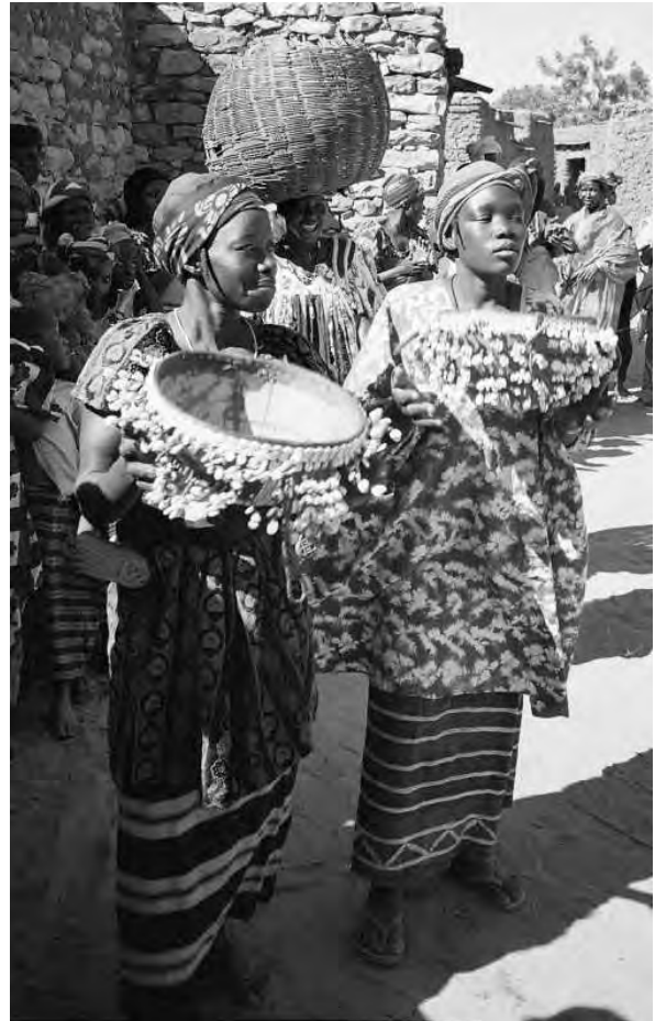
Photo: Cowrie-calabash tambourines.

sic. At the end of a group's performance, they sometimes dance towards us, touching the ground at our feet "in respect".