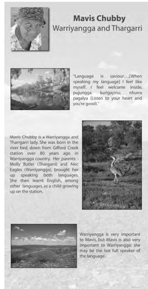
Image above: Banner from the Nghanungu Wangga exhibition currently on show in Western Australia. (Page. 13)