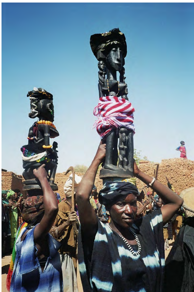
Statuettes of fertility goddesses, Menti and Mali. (Page 3)

OGMIOS Newsletter 3.11 (#36): — 31 August 2008