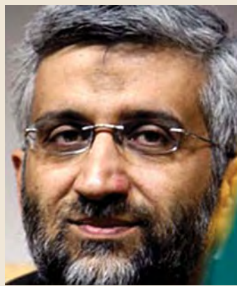
Jalili said he defended Iran's rights to nuclear technology at talks with the EU

They had decided that if the reports by the International Atomic Energy Agency (IAEA) and Solana did not show "a positive outcome", they would agree on more sanctions against Iran and put it to a vote in the security council.