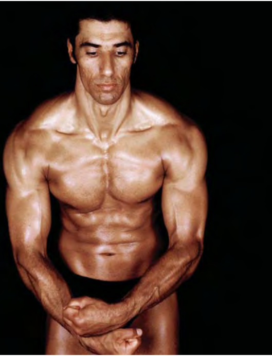
The burly dreams of Afghani men - a film from Denmark.