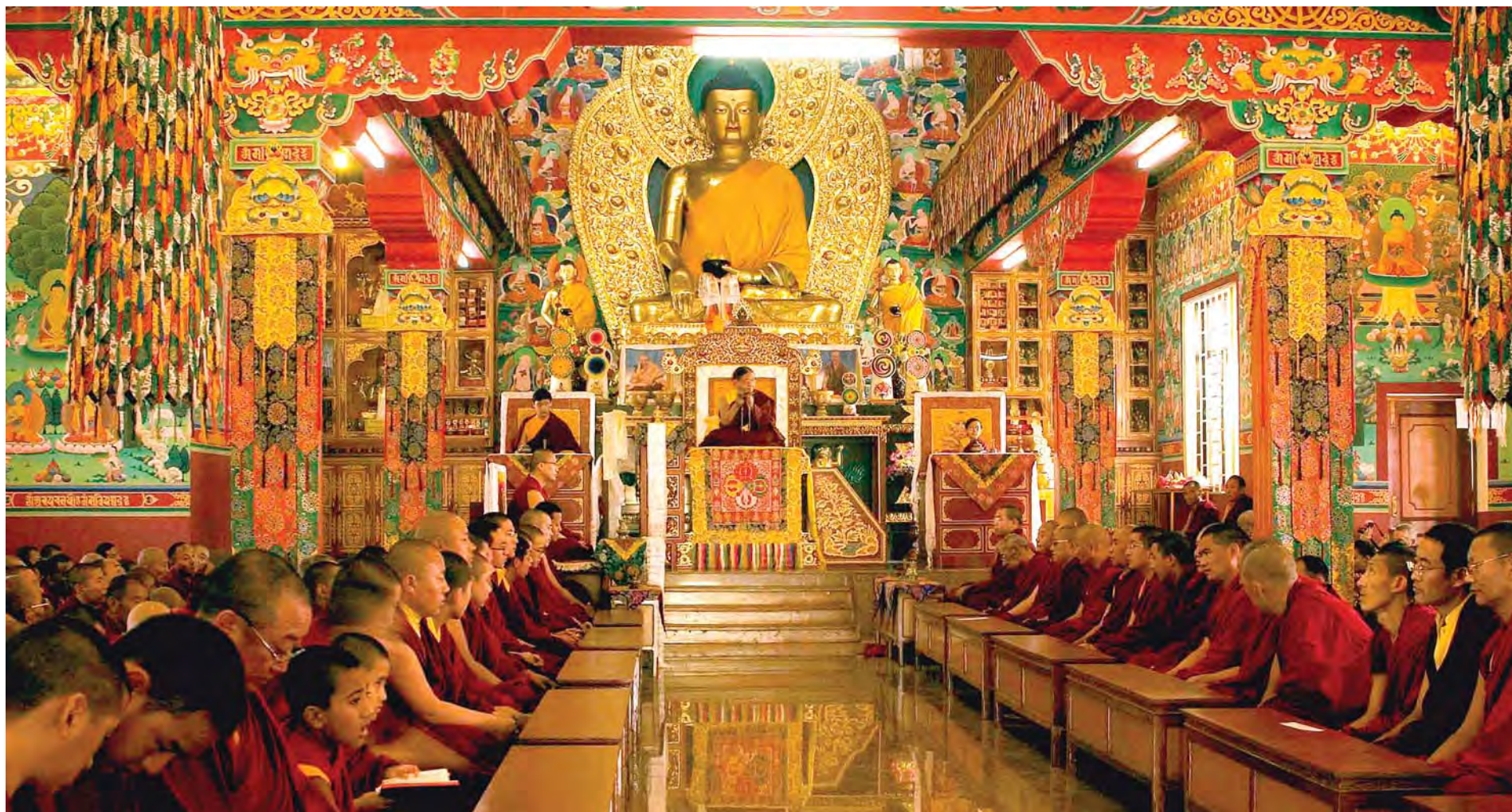
Monks performing Monlam prayer festival for world peace at Rabten Ling Monastery, Lumbini.

Kathmandu | 3-9 Dec, 2007 | # 43 | Price Rs. 25