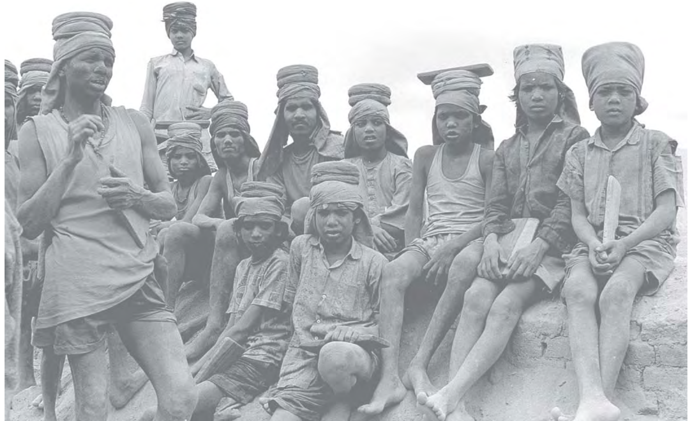
Brick factory workers covered in dust. Bungamati, Lalitpur, Nepal.