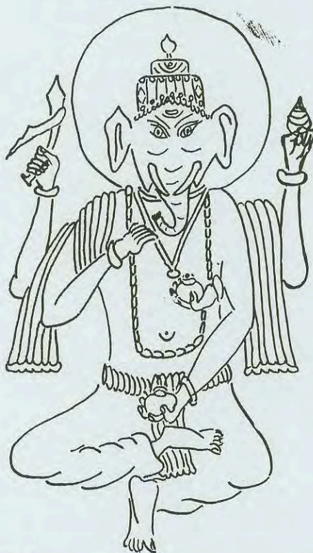
Plate 2 Sketch of a new image of Lha Laangbaa Nhurbu as proposed by Mr. Narendra Gauchan