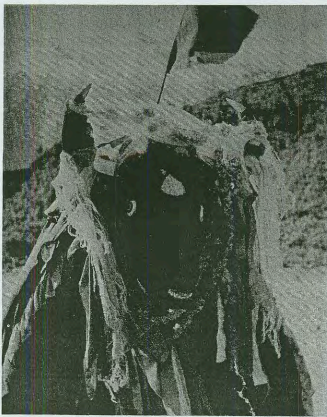
Plate 9 The head of Lha Hyaawaa Rhaangjyung