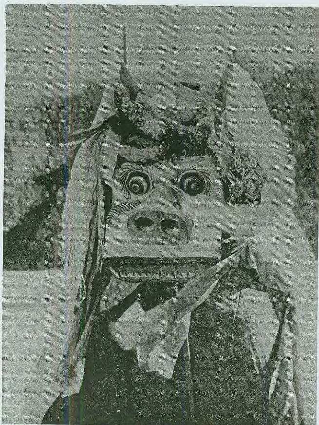
Plate 5 The head of Lha Ghaanglaa Singi Karpo