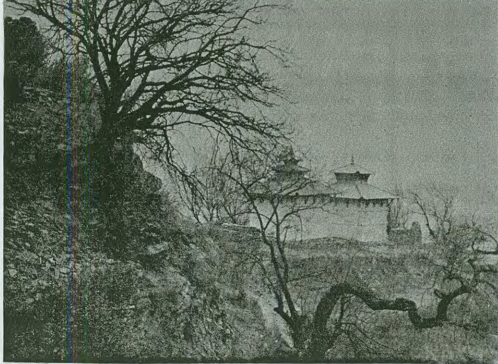
Plate 8 Chyoki Lha than (the temple of Lha Laangbaa Nhurbu and Saalki Lha than (the temple of Lha Chhyuring Gyalmo) at Nakhung Ghaangta near Nakhung