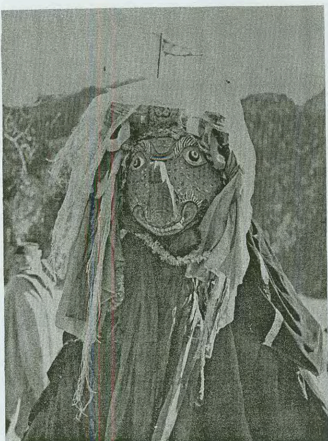
Plate 3 The head of Lha Chhyuring Gyalmo