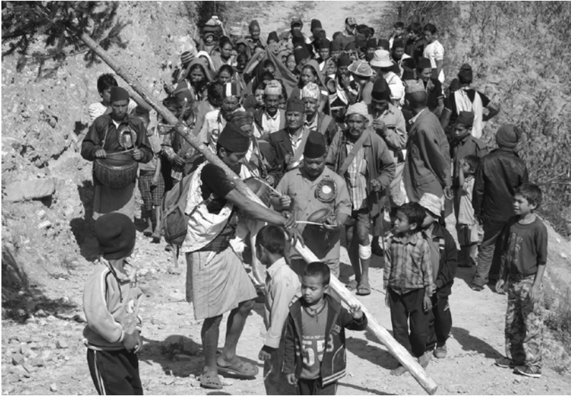
Plate 1. Young villagers, accompanied by Tailor-Musicians, returning from the hilltop site of the Braha temple with a tree-trunk to set up in the dance-ground during the Bhume festival.