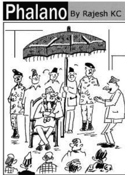
Plate 1. On the day of Ram Nawami (24 March 2010), President Yadav and former king Gyanendra Shah both visited the Janaki temple within the space of only two hours. Each of them entered the temple for the puja shaded by the same honorific parasol (source: Republica, 26 March 2010).

Mr President !... Ex-King wants the umbrella back.