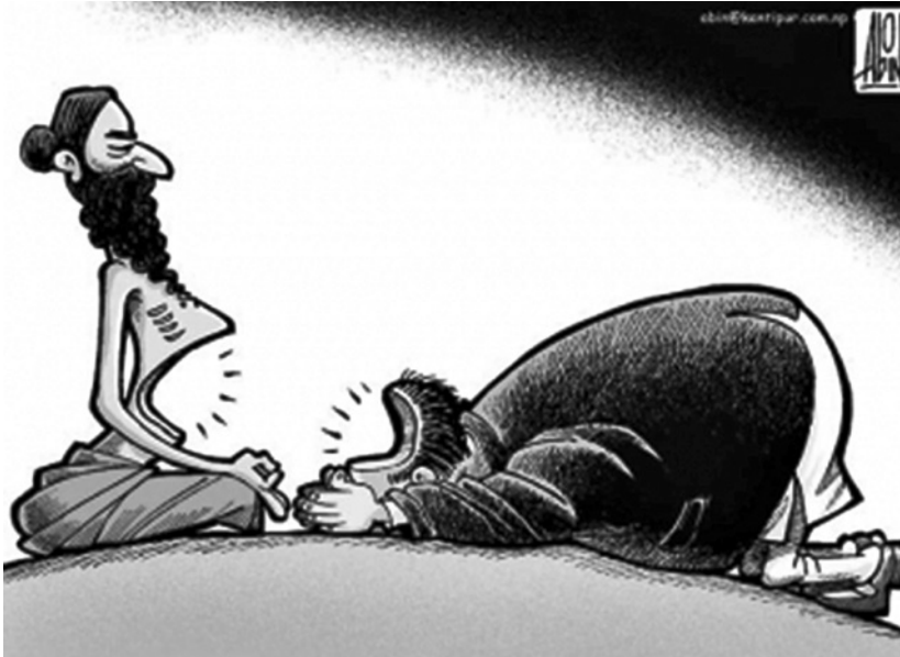
Plate 5. A cartoon mocking political leaders, including from the UML and UCPN (Maoist), who along with thousands of other people attended Swami Ramdev's yoga camp in Kathmandu in March 2010

To the disbelief of Maoist cadres, the Maoist leader Prachanda worships a buffalo in a religious camp in Chatara, Sunsari district, to appease the