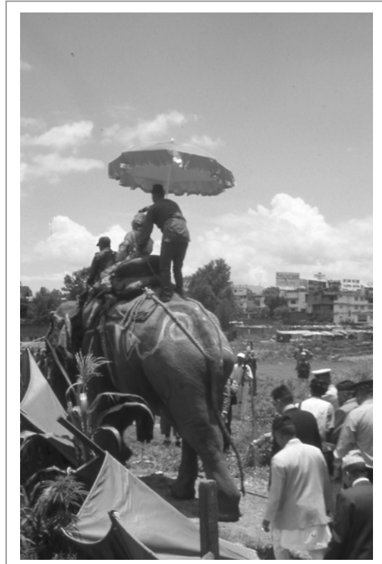
Departure on the elephant, heading for Jawalakhel.

Some of the priests and palace officials, all similarly dressed, were busy getting everything ready for the brahmin to be led in at any moment. One did not have to wait long for him to appear. Dressed in a white dhoti and wearing the janāi , 22 he was