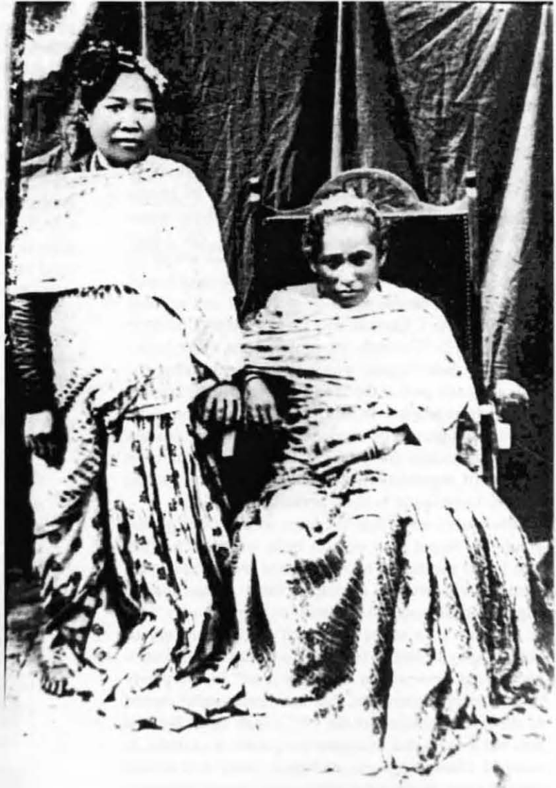
2. Two Newar women. Late 1930s.