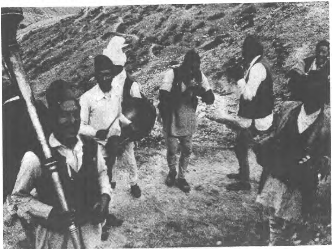
A Damai band in a marriage procession.

The Damai have a double function, so they are in contact with the higher castes in two ways. As musicians they are hired for special occasions and paid in cash, as tailors they work, like the Kami, for a bista , on a contractual basis. But, unlike the Kami, generally the whole Damai family come and work at the bista's house. They bring their sewing machine with them and sit in the courtyard, one of them cutting the material, the others sewing it either by machine or by hand.