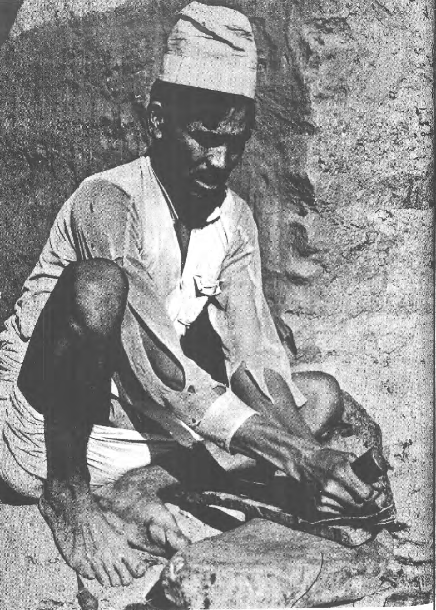
A Sarki making the sole of a shoe.