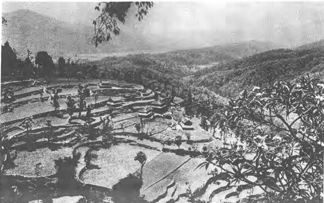
View to the south over the Kar Khola Valley in Central Nepal. A few Ban Raja live in the village of Satobati located in the upper center of the photograph. (1968)