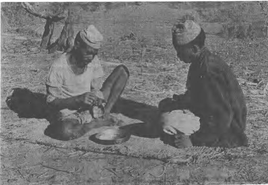
The shaman on the left is performing divination with rice. (West Nepal 1969)

Seances normally take place at night. A small area is cleared and water sprinkled around to purify it. Sal ( Shorea robusta ) leaves are used to make a mat for the shaman to sit on. Other items necessary for the seance are made ready by the patients family. After the shaman has washed, he offers a libation of liquor to his tutelary deity and drinks a little himself. He lights a small oil lamp and throws hulled rice in 4 directions, as he says a spell. In the course of offering incense, he circles his necklaces (one of seeds of Sapindus mukerossi and one of iron) through the smoke. A plate containing a rice offering is next waved through the incense smoke and rice is again thrown in the four directions (to bind them and his body from evil spirits). Next, several boughs from the sal tree