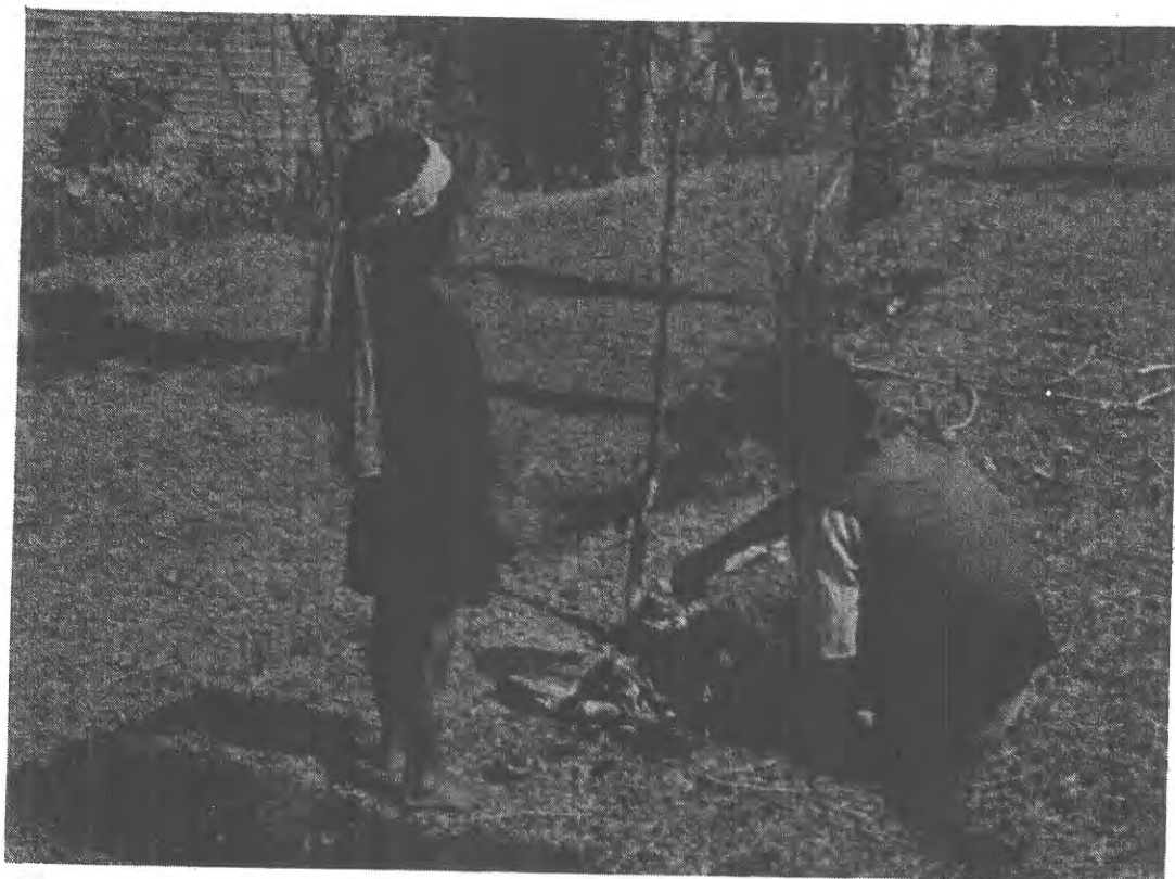
Making offerings to ancestor spirits. (Central Nepal 1968)

I initially thought, however, that the Ban Raja language might be related to the Mundic languages, since it shared a feature many linguists considered to be characteristic of that family. (12) This feature is called pronominalization, because the pronoun, or more commonly a segment of the pronoun, is affixed to the verb. It has more recently been ruled out as an archaic Mundic characteristic by some linguists (e.g. Holmer 1963). There appears to be a concensus now that pronominalization can not be exclusively associated with any one language family. (13)