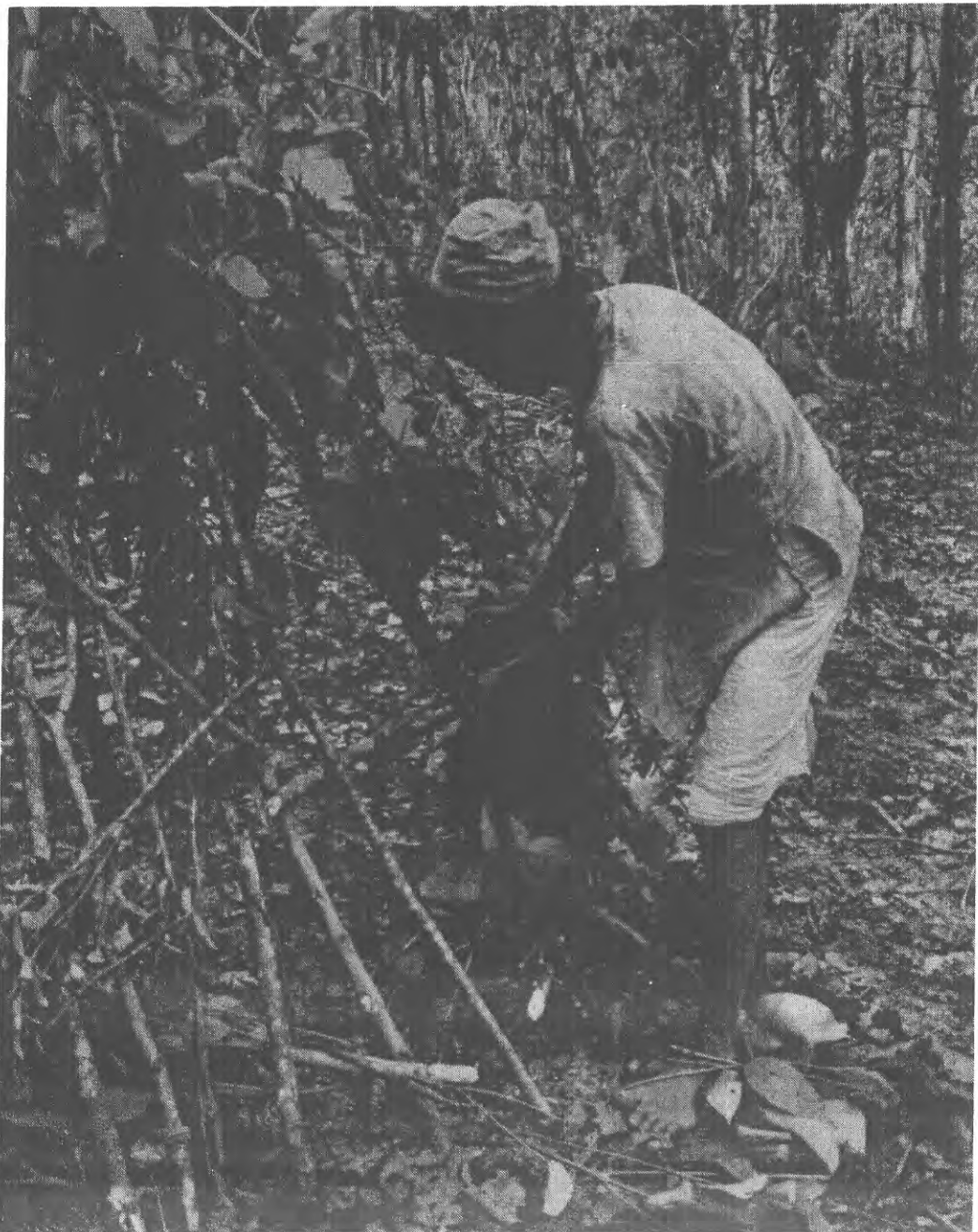
Construction of a lean-to. (Central Nepal 1968)

This means that the Ban Raja language is probably one of only two languages in Asia to be unrelated to a major language family, and thus must be of considerable importance to linguists. (14) The fact that there are only a few speakers left alive - indeed I personally know of only two - indicates just how urgent it is that research be conducted in the near future. (15) It is hoped that this article will serve as a stimulus to some researcher to undertake work with the Ban Raja before a tribe unique in Asia will indeed have "vanished".