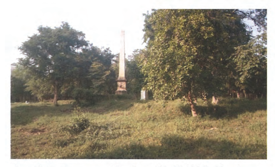
above: the handsome memorial to the murdered British Resident (see page 101)

below: the Booth graves uncovered in Calcutta (see page 101)