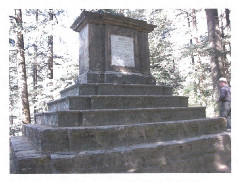
above: Colonel Charles Parker's memorial, Simla (see page 100)

below: Rajpura cemetery Delhi, in 1944 (see page 103)