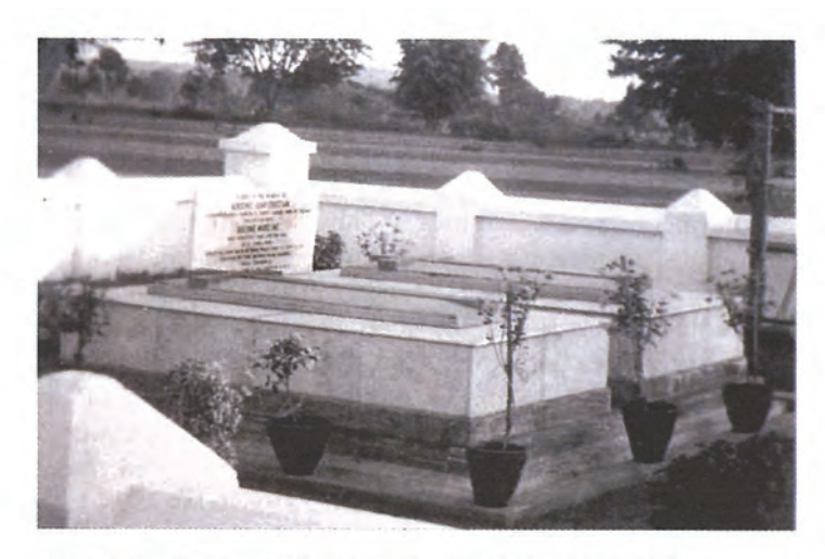
above: double grave at Sundargarh, Orissa (see page 104)

below: the restored Baillie memorial at Seringapatam (see page 106)