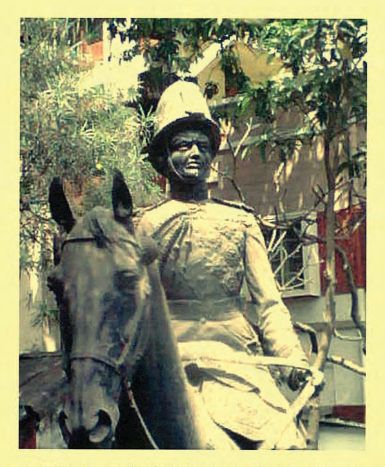
BACSA has been asked for its help in identifying this old statue in Calcutta (see page 72)