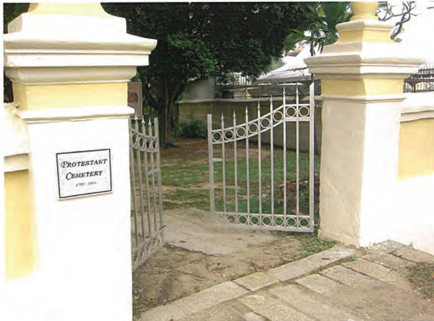
below – newly restored gates at the same cemetery (2007)