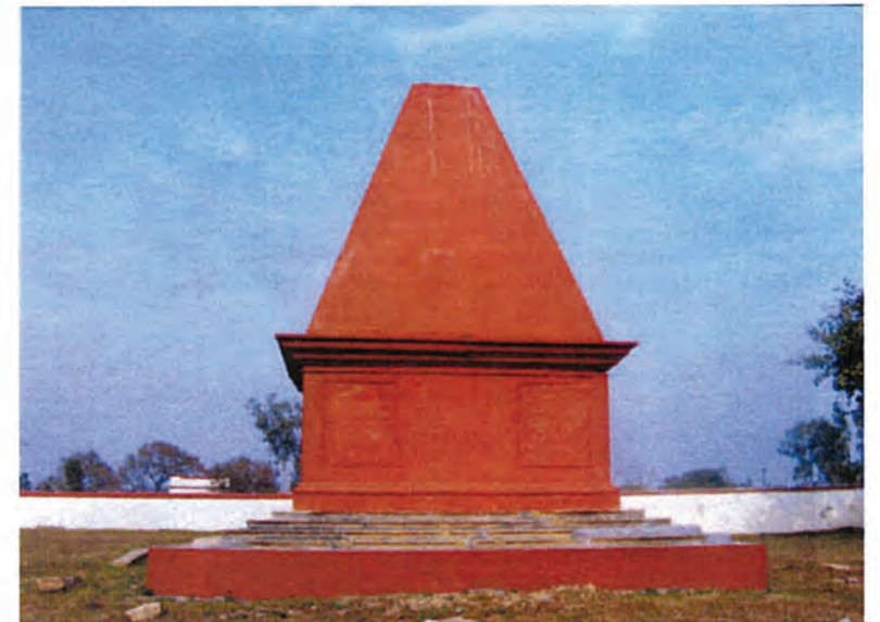
below – the newly restored Rohilla War Memorial at Bhitaura (see page 85)