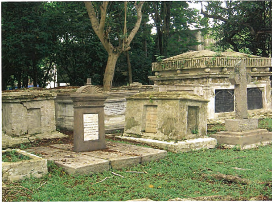
above – tomb of Captain Francis Light in the Old Protestant Cemetery, Penang (see page 83)