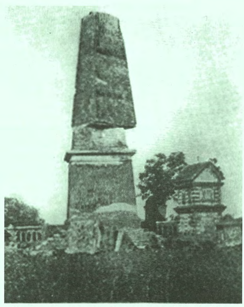
Damage to the George Inglis monument at Chhatak, Sylhet, caused by the earthquake of 1897 (see story on page 33)

Designed and printed by Seagull Print Ltd Registered Charity No. 1003168 A not-for-profit organisation providing rehabilitation and training for people recovering from mental health problems Tel. 020 8944 7366 www.seagullprint.co.uk