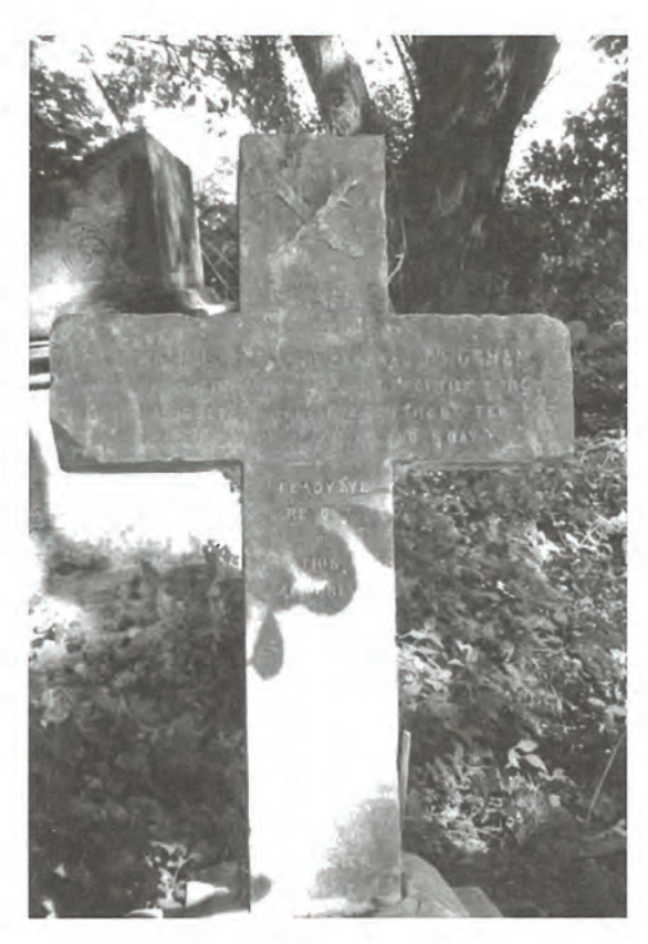
left: Captain Vaughn's tomb at Kyar Nyat, Burma (see page 4)