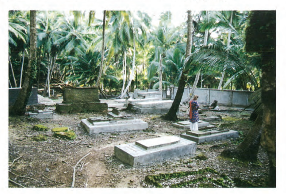
below: Ross Island cemetery (see page 104)