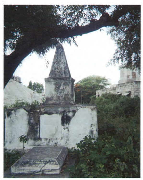
left: the little cemetery at Udaipur (see page 97)