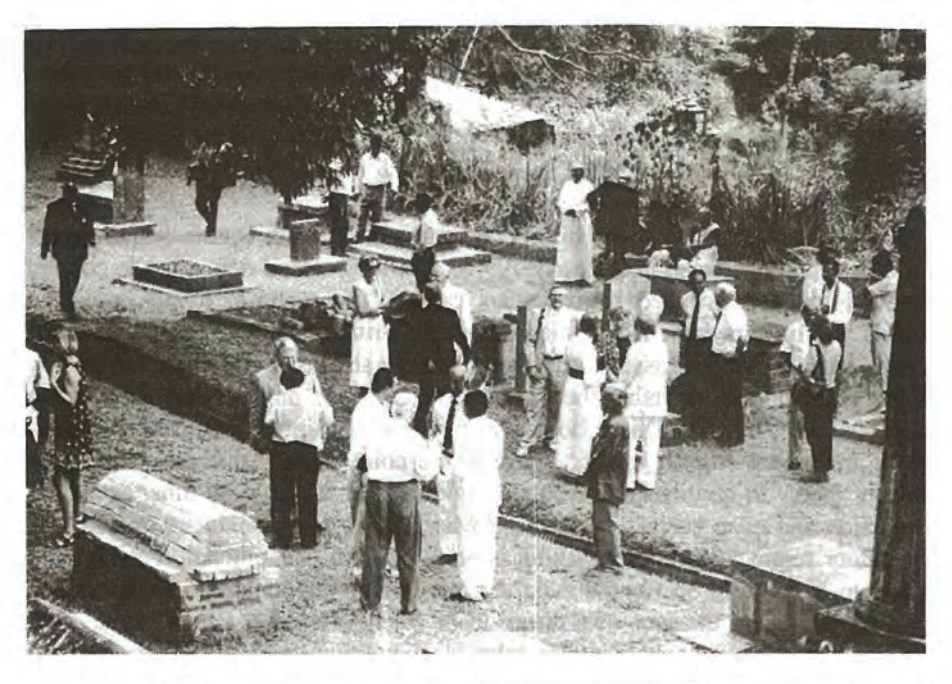
above: the Old Garrison Cemetery at Kandy, Sri Lanka, recently restored (see page 121)

left: grave marker of John Holland, died 1897, at Agra Cantonment cemetery (see page 119)