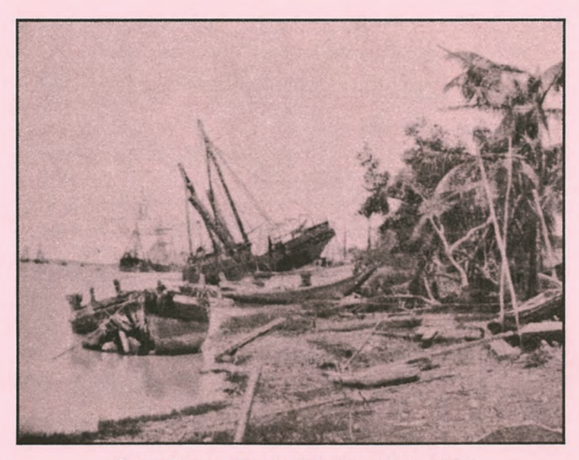
Storm damage after the Calcutta cyclone, 1864