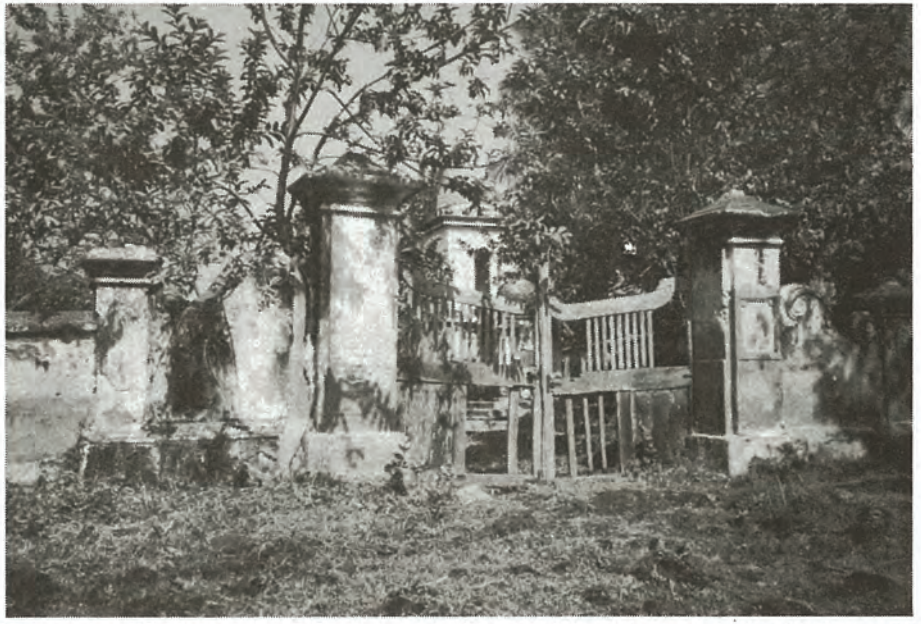
Entrance to Seringapatam Cemetery, with a wealth of fine tombs inside (see p28)

rianti Ganzel Villa Inconta ni la dani estano dal canto dal da mere fin dalla il Hamedala e i falima canton dalla dalla canto dal da mere fin in Recordificienzita (il internanti di tana dal versionenta)