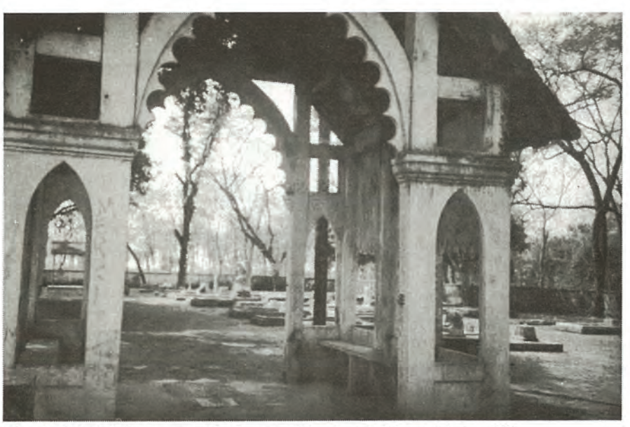
The delightful Rangamati lychgate, Jalpaiguri District (see p28)