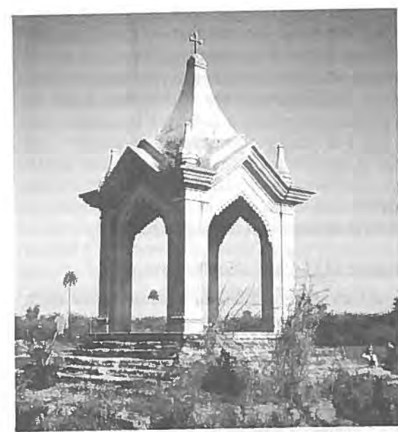
General Sir James Willcocks' memorial today at Bharatpur (see p50)