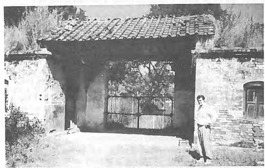
The lych-gate at the cantonment cemetery, Faizabad (see p52)