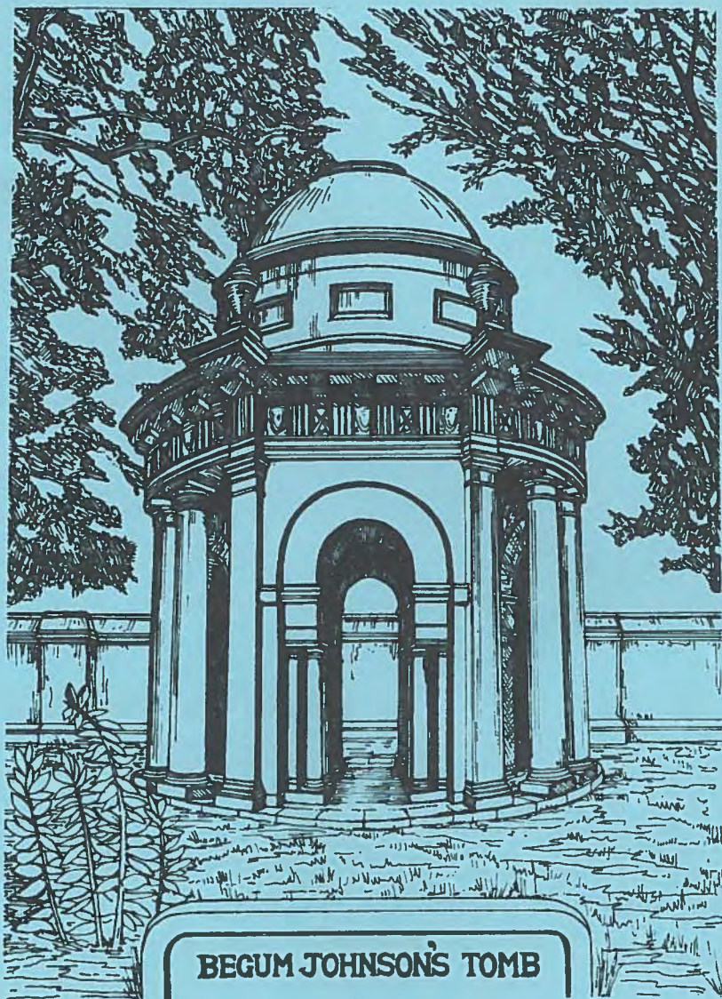
BEGUM JOHNSON'S TOMB