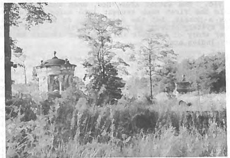
below: handsome tombs at Mhow cemetery stand in a pastoral scene before the annual grass clearing after the monsoon.