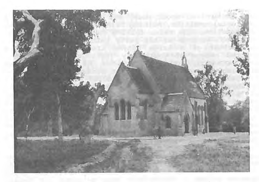
The Montgomery church at Dera Ismail Khan (see p.73)