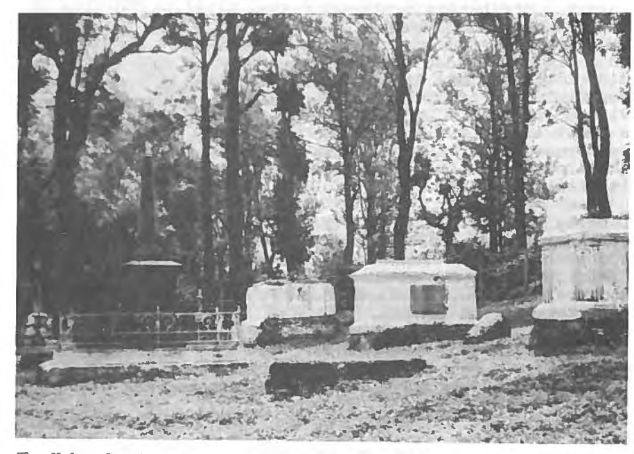
The Helen Cemetery, Ochterlony Valley (see p.73)