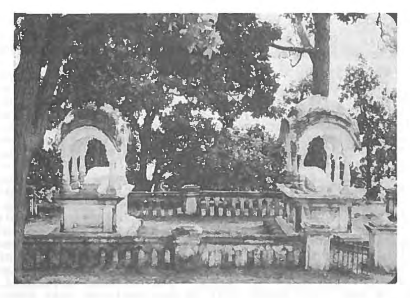
The Pearsall tombs, Nahan, east of Chandigarh (see p.77)