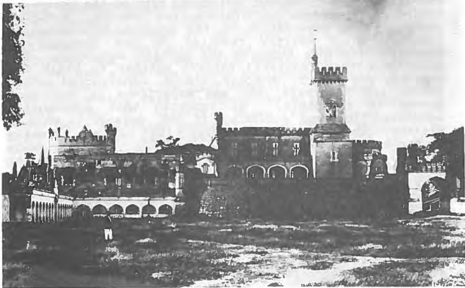
Below: Kenilworth Castle (Brett's Folly)nr Bangalore (see page 46)