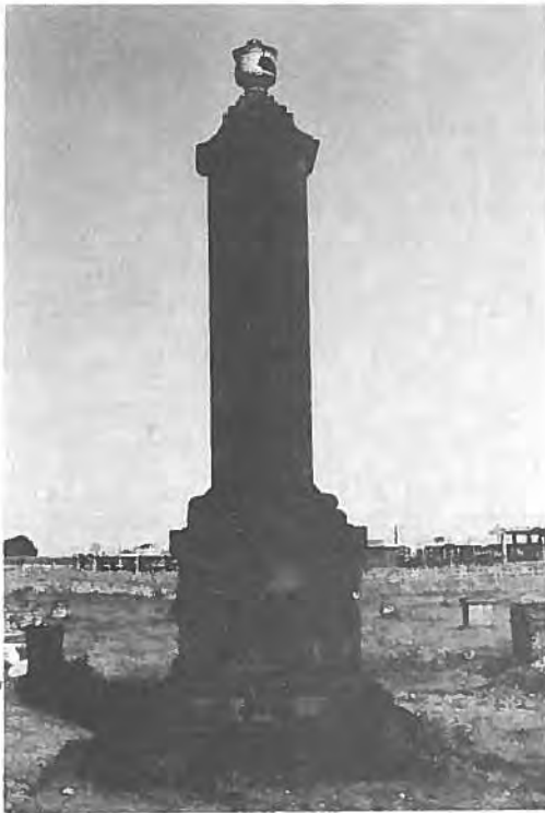
Left: The Wallace obelisk at Sirur (see page 49)