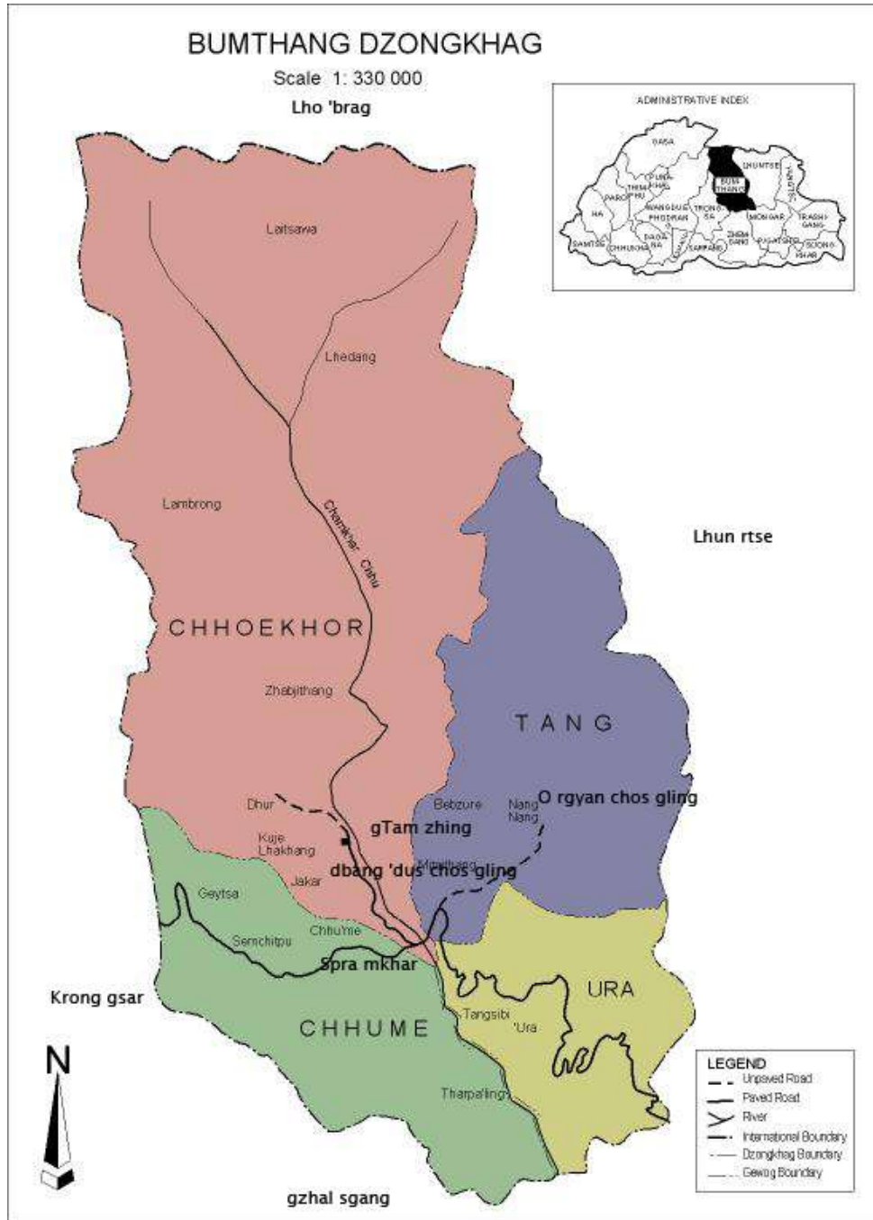
MAP from SURVEY of BHUTAN with added names