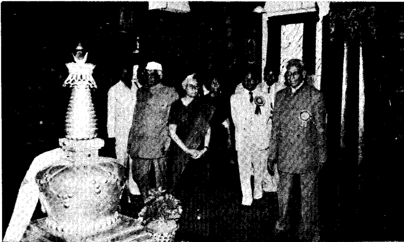
Prime Minister on the first floor of the Institute after placing the khada on the Chorten.