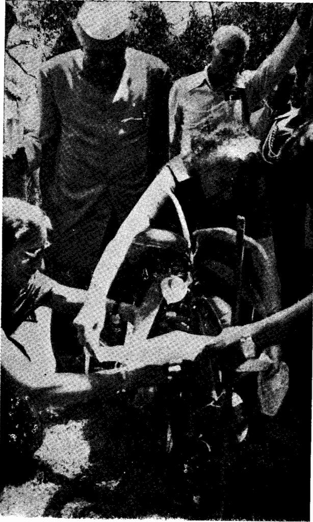
Smt. Indira Gandhi, Prime Minister of India, planting a sapling in the compound of Sikkim Research Institute of Tibetology at the commencement of the Silver Jubilee Celebrations of the Institute.