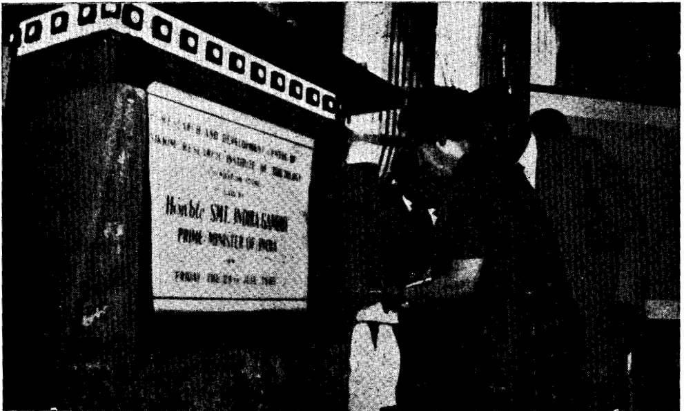
Prime Minister after unfurling the plaque marking the Silver Jubilee Celebrations at the entrance of Sikkim Research Institute of Tibetology before entering the building. ( Top )