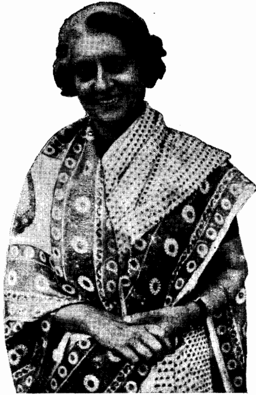
PRIME MINISTER INAUGURATES THE SILVER JUBILEE CELEBRATIONS