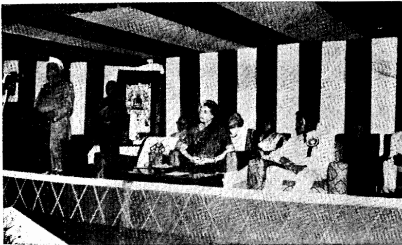
Governor welcoming the Prime Minister.