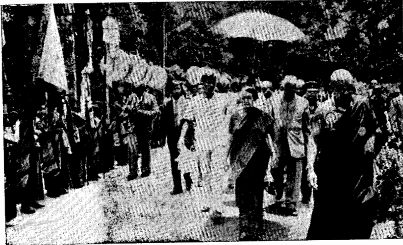
Prime Minister being taken in procession by lamas in traditional colourful costumes and music of trumpet to the shamiana for the main function.