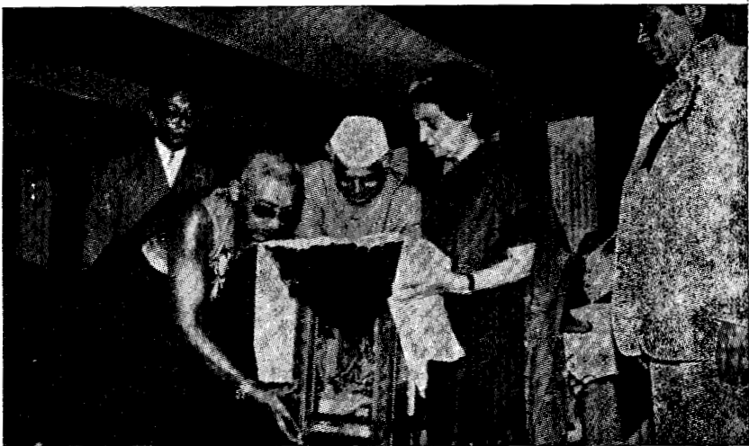
The Governor presenting the bronze image of Guru Padma Sambhava to the Prime Minister. Shri N. B. Bhandari, Chief Minister of Sikkim is looking on.