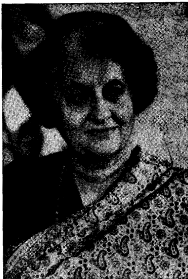
PRIME MINISTER INAUGURATES THE SILVER JUBILEE