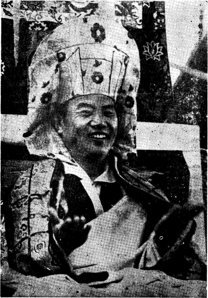
His Holiness the XVI Gyalwa Karmapa (1924 - 1981 A. D.)