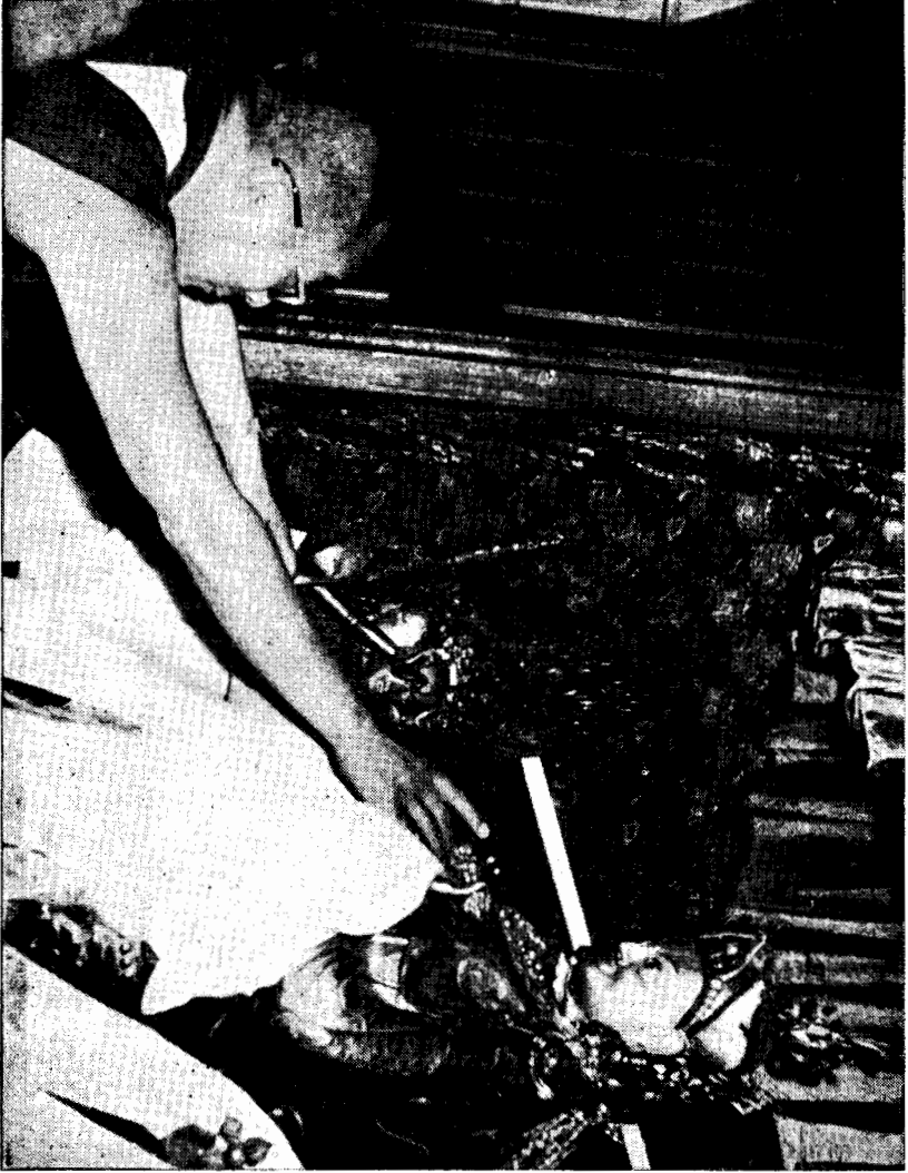
His Holiness The Dalai Lama offering scarf to the image of Padmasambhava.