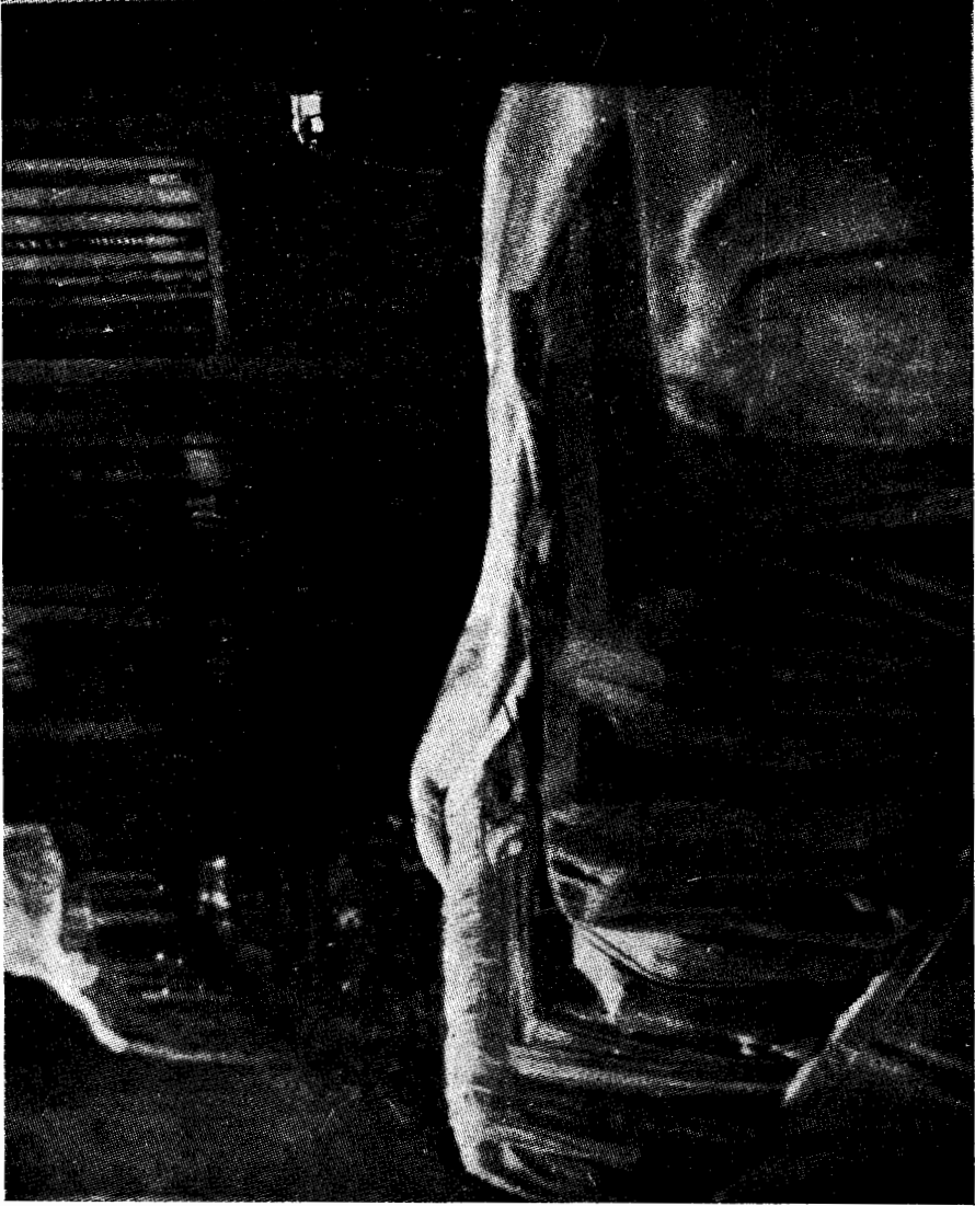
Tibetan Kanjur and Other Tantric texts on the table for presentation.