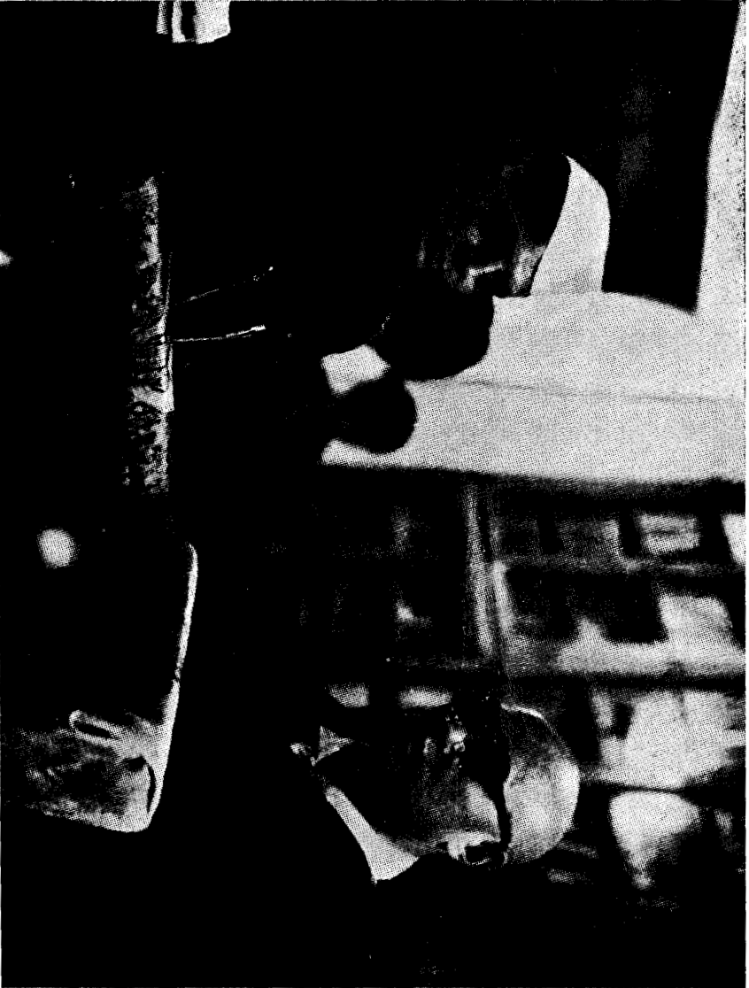
H. H. Gyaiwa Karmapa handing over the scriptures to the H. E. Governor of Sikkim/President : SRIIT