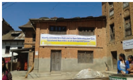
Nala is an open defecation free zone.

A community-led total sanitation approach has been developed with the Nala Water and Sanitation User committee (WSUC). This involved building storm drainage in the village to take away rain water and prevent flooding during the monsoon season. A sewer network was also installed and connected to 355 homes giving everyone in the village a toilet. The sewers were paid for by WaterAid and the local partner and the villagers bought their own squatting latrine for 1000 rupees.