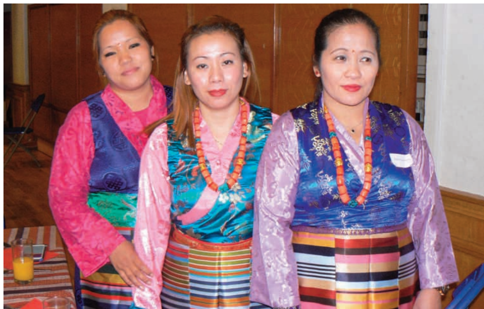
Our entertainers at the supper.