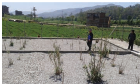
Nala's reed bed sewage system.