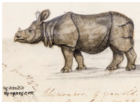
Asian one-horned Rhino from the Hodgson collection.

This talk summarises two centuries of Anglo-Nepali relations, divided into five periods. In the first phase the Gorkha unifiers of Nepal and the East India Company (EICO), equally bent on territorial expansion, clash over three rounds of warfare that conclude with the former forced to accept the terms of the Treaty of Segauli, ratified at Mukhwanpur in March 1816, with the loss of plains territory and the imposition of a British Resident in Kathmandu.