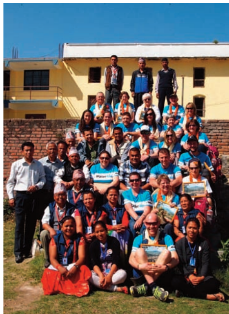
The WaterAid group with the Water & Sanitation users committee in Nala.

The sewer network feeds into a reed bed treatment plant on the edge of the village. Effluent flows through three settlement chambers where solids settle out before going through a larger reed bed, finally going out into the local watercourse. All the design and operating parameters are painted on the wall next to the plant so everyone knows how it works. The reed bed has been in operation for a year and