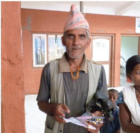
Male patient with medicine.

I was also able to participate in a BNMT health-camp at Sipaghat in Sindhupalchowk, about five hours drive