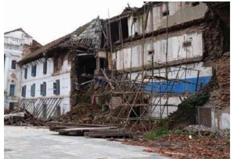
Damage near the Durbar Square.