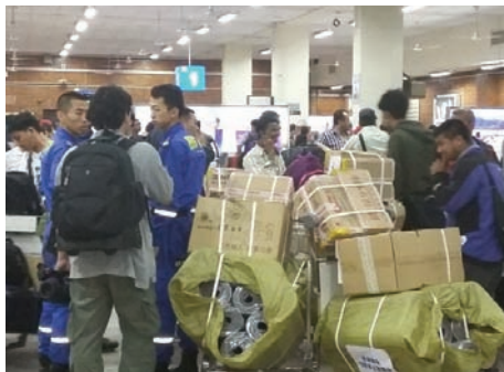
Equipment at the airport.

Immediately after the earthquake, a BNMT team went to Bhaktapur, one of the worst affected areas in Kathmandu valley. Aside from the destruction of many of the monuments in the main Durbar square – a UNESCO world heritage site and important tourist attraction – there were 15,000 families rendered homeless who are now housed in 42 tented camps in and