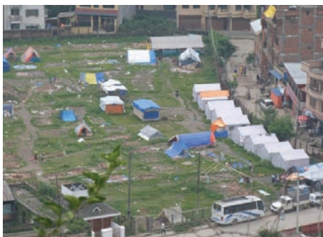
Tented camp in Kathmandu.

In the immediate aftermath of the earthquake relief agencies set up temporary toilets for many of the tented camps in and around the Kathmandu valley. This was