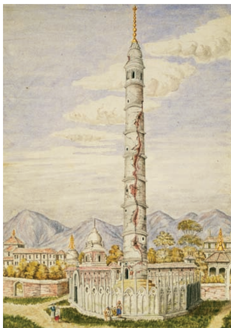
The second Bhimsen Tower c 1850.

The Dharahara Tower or Bhimsen's Tower or even Bhimsen's Folly as it is sometimes known is now no longer a part of the Kathmandu skyline. It was a casualty of the earthquake that shook Kathmandu on 25th April. Over recent years, although it had been restored, it had been masked by the surrounding development. I remember very well my first flight in an aging Dakota into Kathmandu from India in 1962. As we broke through the clouds the city was laid out below. Was this to be a real 'Shangri La'? One could see a fair sprinkling of large white 'palaces' built by the Shahs and Ranas and amongst them a tall white tower, somewhat like a minaret. On my visits in 1962-63 I was able to climb the tower. It was close to the