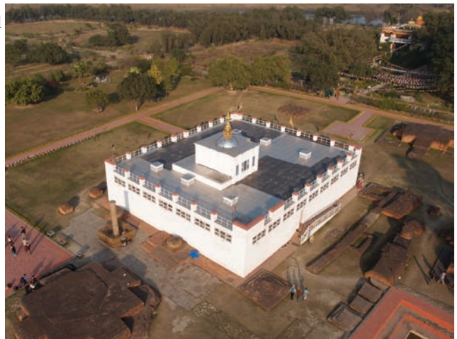
Aerial view of the Maha Devi temple.

Unfortunately, against the recommendations of a UNESCO Monitoring Mission, a new girder and brick shelter was erected over the Asokan Temple in 2002. It subsequently produced a damaging micro-climate for the archaeological remains within and increasing pilgrim numbers to Lumbini accelerated the detrimental effects of the humidity within the Temple shelter, causing further degradation of the Asokan brickwork. In response, UNESCO, the Government of Nepal and the Lumbini Development Trust launched a new project in 2011 to enhance the protection of the site and design a new conservation program. Funded by the Japanese-Funds-in-Trust-for-UNESCO and led by Professor Yukio Nishimura of the Tokyo University, the program also undertook to evaluate the presence of subsurface early