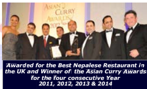
Awarded for the Best Nepalese Restaurant in the UK and Winner of the Asian Curry Awards for the four consecutive Year 2011, 2012, 2013 & 2014

Everest Inn caters for any occasions to your requirements and your budget.