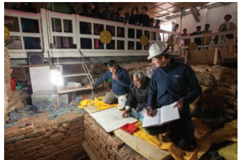
Excavations within the Maha Devi temple.

The focus of our fieldwork has now moved towards the wider Natal landscape of the Buddha, again generously sponsored by the Japanese-Funds-in-Trust-for-UNESCO, the LDT and the Hokke Shu with the support of UNESCO and the Government of Nepal. In an article in this Journal in 1998, we reported on non-intrusive archaeological investigations, which had successfully