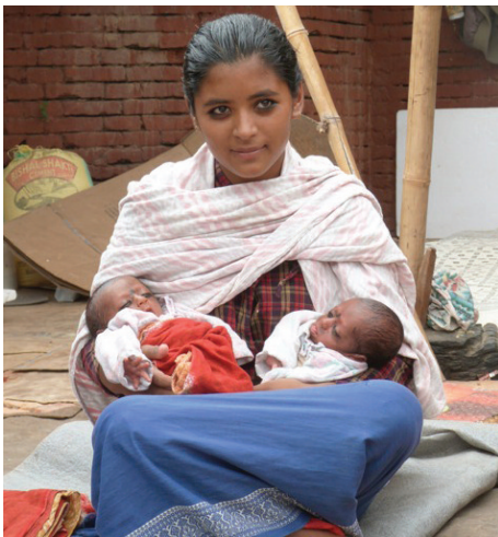
Patient with twins.

really important as both the population pressures within the valley and the impending monsoon meant it was important to ensure at least basic sanitation facilities were available for the displaced and homeless. Lack of sanitation poses a big threat of diarrhoeal and other infectious diseases spreading. BNMT knows from previous work that there is a real need to address gender in toilet and sanitary provision – ensuring security, privacy and dignity for women, girls and children. This has become an even bigger challenge in the stressed environments that many people currently live in. BNMT has been working through local government over site selection and engineering design for the construction of community toilet blocks for the tented camps in and around the Kathmandu valley. A users committee is formed at each camp and charged with the responsibility for the building work and oversight for the maintenance of the construction subsequently and our collaboration with local government ensured that the toilet blocks all have a water supply. By working with local communities in this way we assure local