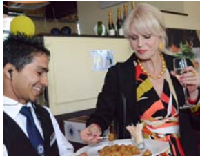
"Magnificent food, excellent staff and professional service, 10 out of 10. Love and respect" Joanna Lumley OBE