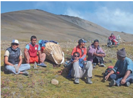
On the Jang La