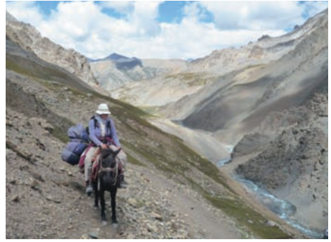
On the high trail

After lunch at 12 noon we set off, the kitchen party along the river and ourselves