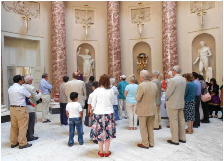
Members being briefed at Stowe.