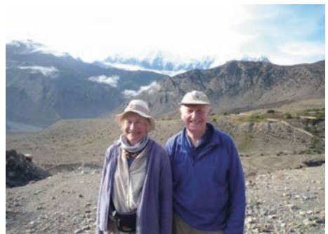
At Phalyak on the morning of Day 24

It was a sunny day and as we set off many ladies were walking up to Phalyak to help with the harvest. It was a long ride down to the bridge; we crossed the Kali Gandaki and proceeded on the road to Jomsom. There were many 4-wheel drive vehicles taking pilgrims to and from Muktinath, and a good number of motorbikes. A big bulldozer had fallen into the river at one stage, where the road had given away. We rode through Jomsom, said goodbye to our horses, and had lunch in the Dancing Yak Hotel. We had arrived a day earlier than planned so our booked flight out was in two days’ time. Santosh had long discussions on the phone with our trek manager’s wife Nima about the possibility of getting a flight out the next day. We were suddenly checked in for the last flight of that day, and our baggage was put on an earlier flight. Then our flight was cancelled, so Nima, Sam and Santosh set about getting us an early flight the next day, as we had lost our baggage. They were successful. We spent the afternoon in Jomsom. We met a group of 32 Medical trekkers from the US who were going to Mustang (on horses) and planned to stay a