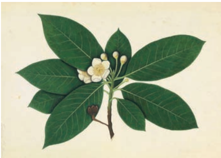
Figure 4. Chilaune, Schima wallichii