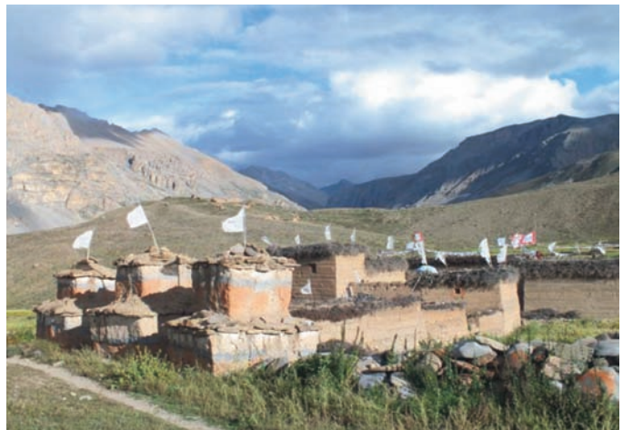
Chortens and houses in Koma

a beautiful spot, with excellent views, a gompa and chortens and an interesting old village below. We had a 5 – 6 hour day in beautiful weather.