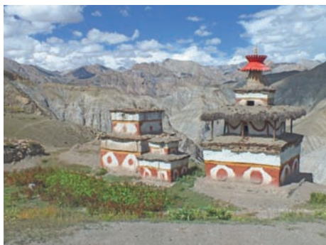
Chortens above Saldang