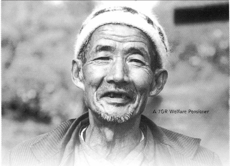
A 7GR Welfare Pensioner

The day will come when an entire generation will exist who will be unaware of the debt of honour owed to the Gurkha soldier; a generation which cannot remember, as we do, the brave and loyal service Gurkhas have given to the British Crown over nearly two centuries.