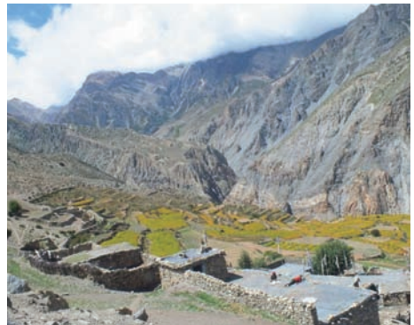
Buckwheat in Sangdak, the Khag La in view just below the clouds

In Sangdak there were various groups of men playing a very noisy Tibetan gambling game on the roofs. Some were traders or middlemen, for the goats and