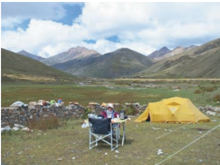
Relaxing in Tarap valley

The big day arrived, with light early rain. The Great Lama was due to arrive about 11am. The local people in their traditional costumes were all lined up in the valley, on the path from the helicopter pad to the School. They included Ama who had ridden from Tingkhu the previous day. Lama Nyamgal was busy issuing instructions to everyone! Shortly after 11am a helicopter arrived with the new Tulku and another lama. They were served tea and milk while the helicopter returned to Dunai to collect Rabjam Rinpoche. He arrived at 12 noon and was accompanied by one of the Brigade of Gurkhas Buddhist Lamas who was in Nepal on