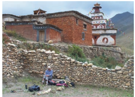
Picnic at Ribo gumpa