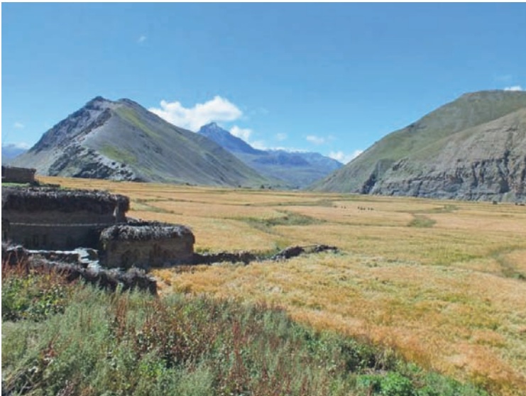
Barley ripening in Tingkhu