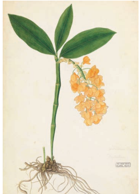
Figure 3. Sungabha , Dendrobium densiflorum

Soon after returning to Calcutta the Governor-General appointed Buchanan-Hamilton as his personal Surgeon and placed him in charge of the Barrackpore Menagerie. The Menagerie was one of Wellesley's grand schemes, aiming to display and be a base for cataloguing the wildlife of the Company's dominions. This was a golden opportunity for Buchanan-Hamilton, as he had a team of artists at his disposal and leisure time to work on his natural history collections. In gratitude to his patron he directed his artists to prepare a full-colour set of his Nepal drawings for Wellesley, and another