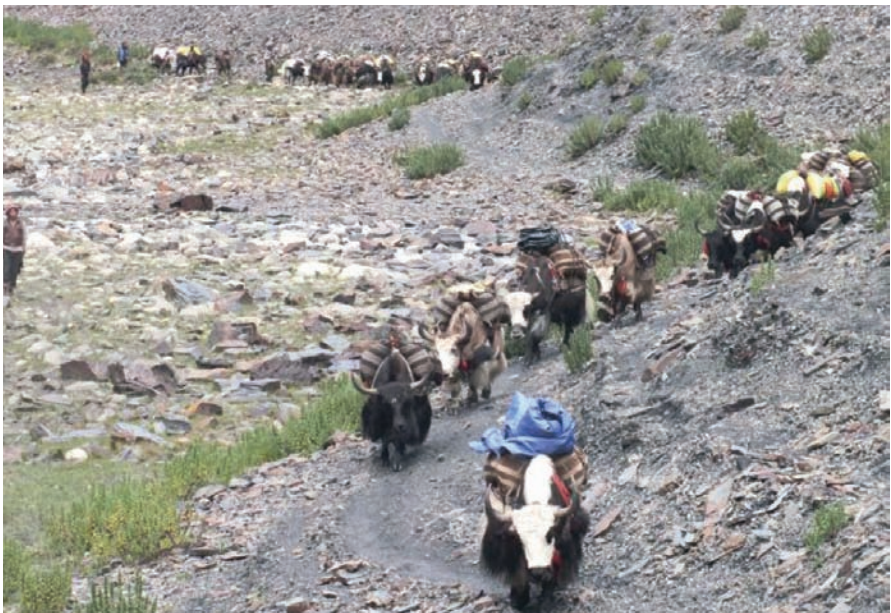
Yaks on the trail

used airstrip which was not there in 2002. We realised that the village had expanded considerably. We descended the path behind the chorten where we had camped and crossed the old bridge, high above the river into Tingkhu. A young boy met us and we crossed towards Norbu's house, which was at the end of a long path. We had to wait for a long caravan of yaks to make their way through a narrow passage of stone walls. Finally we climbed and climbed in the rain to the campsite near Norbu's house. The mules and kitchen staff had just arrived, and we sheltered in the dining tent. Dawa invited us into his mother's house to have Tibetan tea and soup. The tea was very good, but the soup was quite strong with mutton meatballs. It was warm and dry in his house. We then went back to our tent for tea and later our evening meal. This was an 8 – 9 hour day, with some bad weather.