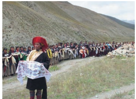
Waiting to greet the Great Lama