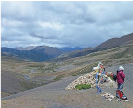
On the Mola looking north

We had good weather and the first part of this trail was very gentle and we walked part of the way. Then streams came in from the right and we mostly rode the horses, except where the trail was very