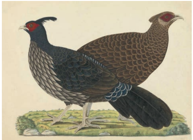
Figure 2. The Kalij Pheasant, Lophura leucomelena

In the field of natural history Buchanan-Hamilton made his usual detailed observations, took meticulous records and pressed hundreds of herbarium specimens. His Indian artist prepared coloured drawings of the most interesting, especially orchids, succulents and other plants that would not make good dried herbarium specimens. There are also