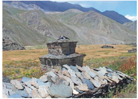
Old mani wall and chorten