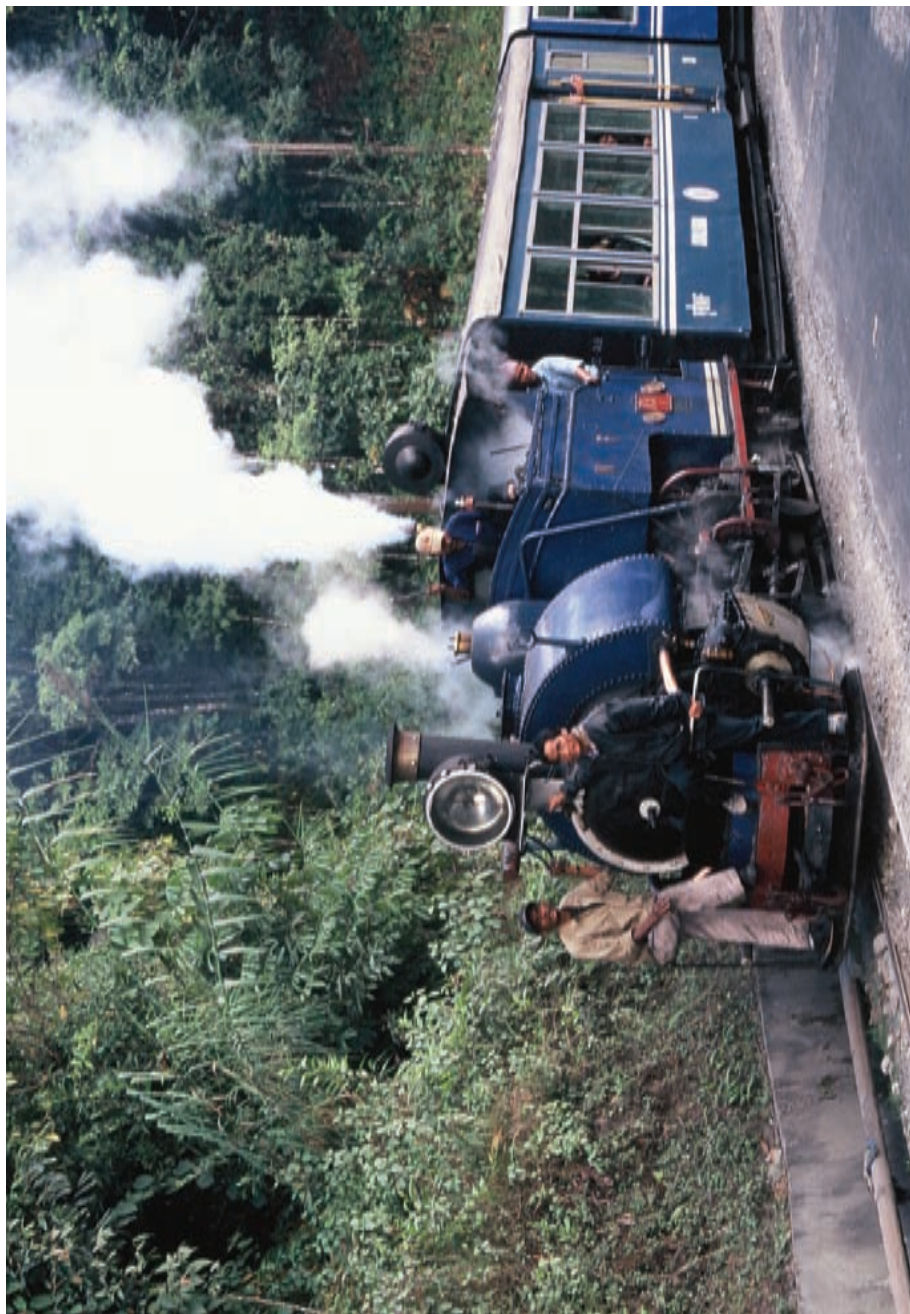
The Darjeeling 'Toy Train' – full steam ahead.