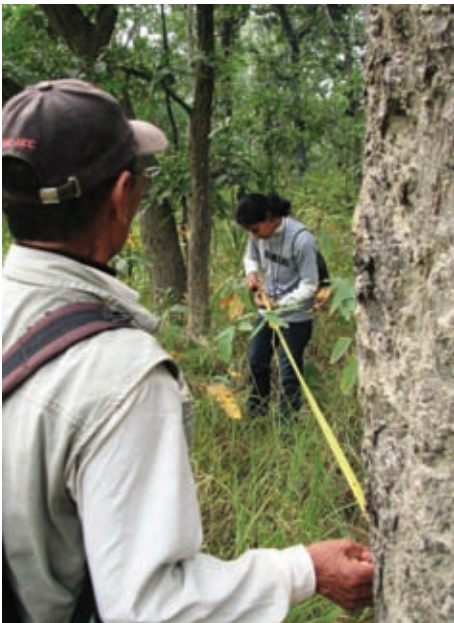
EDGE workers surveying.

To illustrate the theory that was being taught, participants visited a number of the conservation initiatives that are taking place in the Chitwan area. Having spent