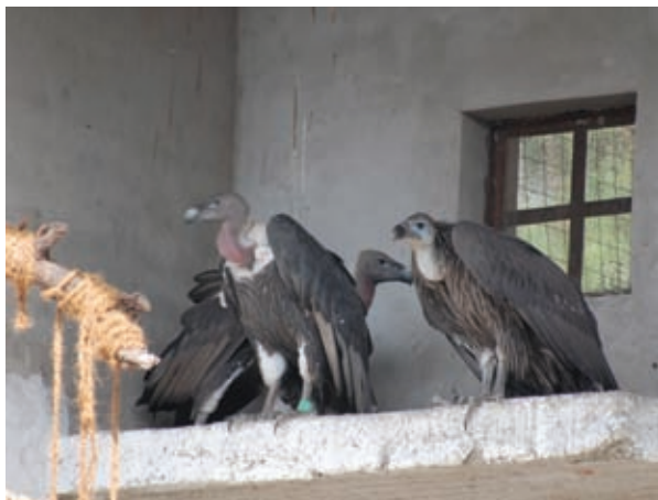
Family of vultures.

Bald-headed, bloodied from thrusting their beaks deep into carcasses, vultures are a vital part of the food chain: a flock of vultures can strip the corpse of a cow to a skeleton within an hour. Their role as nature's clearers of the dead is central to maintaining a healthy and safe environment, keeping down populations of dogs, flies and diseases. In India and Pakistan, the Oriental White-backed Vulture used to be so populous that it was probably the most common large bird of prey in the world: vultures have enjoyed an abundance of food in south Asia, where livestock numbers exceed 500 million. Their numbers were high enough for Parsi communities to practise the sky burial required by their religion with ease. Between 1991-2000, the population of the Oriental White-backed dropped by 96%; less severe but still devastating declines were also observed in Long- and Slender-billed Vulture populations.