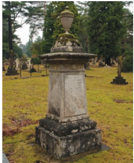
Edward Gardner's Grave at Brookwood.

As the photo shows, the memorial is rather grand, with a marble plaque inset into a square tapered column surmounted with a fine urn. The memorial reads simply "In memory of the Honourable Edward Gardner, 5th Son of Alan 1st Lord Gardner, Died Oct 6th 1861, Aged 77 Years". The grave is in generally in good condition, although the column leans slightly, perhaps indicating some