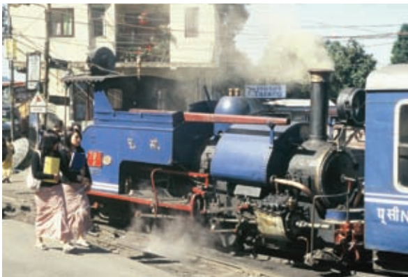
Students and shunting. The loco dates from 1914.

the performance and reliability of the British-built steam locomotives. Made in Manchester and Glasgow (the oldest dating from 1892) the fleet was showing clear signs of old age: the railway's management had the good sense to realise that, over the years, many of the old skills in looking after them had been lost as loco crews and workshop staff had retired. Fortunately, amongst our membership we had two