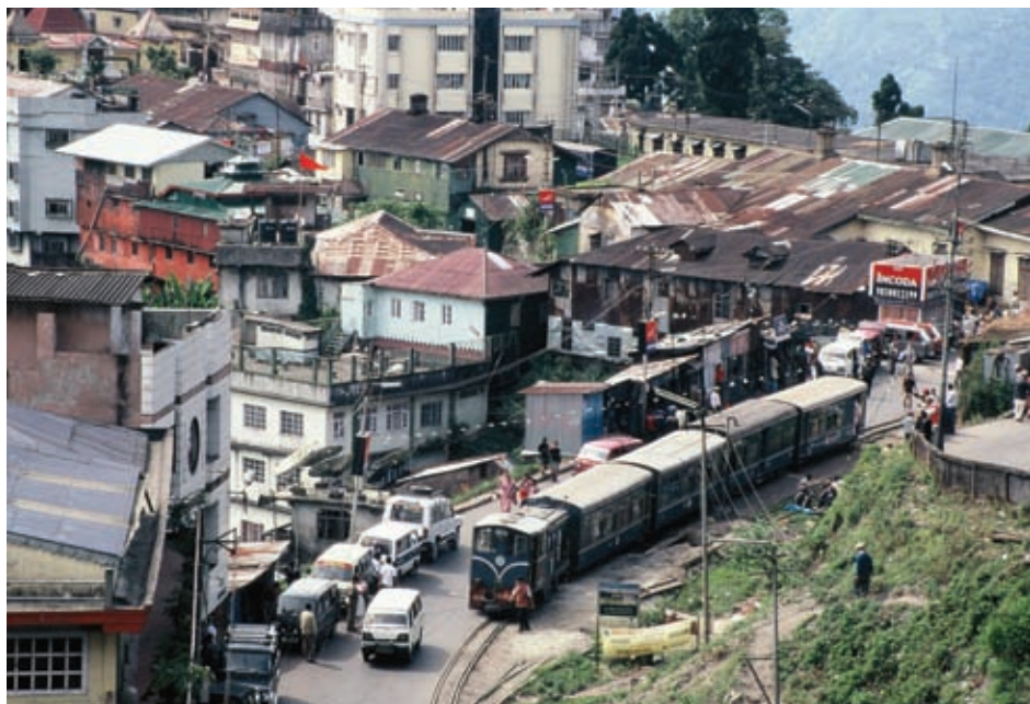
The daily diesel Darjeeling to Kurseong.