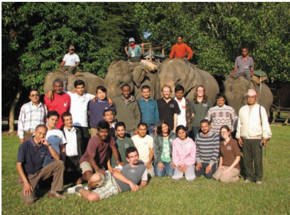
EDGE Participants and their 'transport'.

ZSL carried out a similar training course in Mongolia last year, and it is hoped to carry out such training courses on an annual basis at its field project sites around the world.