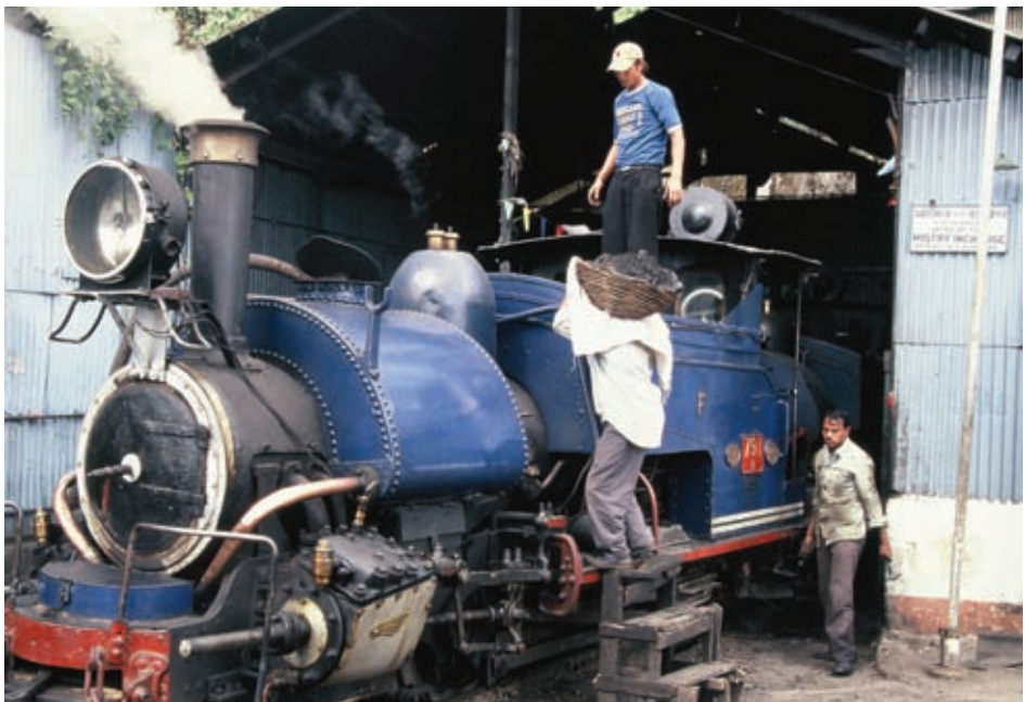
Cooling by hand at Kurseong engine shed.

Since World Heritage recognition, Indian Railways has committed very