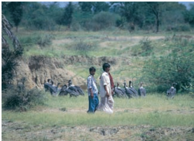
Villagers with vultures.

Although vulture populations may never reach the levels that existed before the crash, their situation is slowly improving – most recently with the news of the successful fledging in 2010 of ten vulture chicks (all three species) at captive breeding centres in India ( And in Nepal. See Journal No 33. Ed. ) for the first time. Captive breeding for eventual release into the wild is the only way the total extinction of these majestic creatures will be prevented, and although it is a long battle, it will work – if the use of diclofenac can be entirely eliminated from veterinary and everyday farming practice.