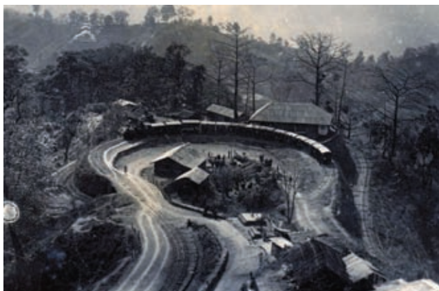
Archive picture of the Chunbati loop.

Of course, the prime reason for the DHR's construction was freight traffic. Uphill would go foodstuffs, coal and machinery whilst downhill would come the steadily increasing loads of tea as the estates expanded. Today, tea is still a hugely important part of the local economy with 80 tea estates employing