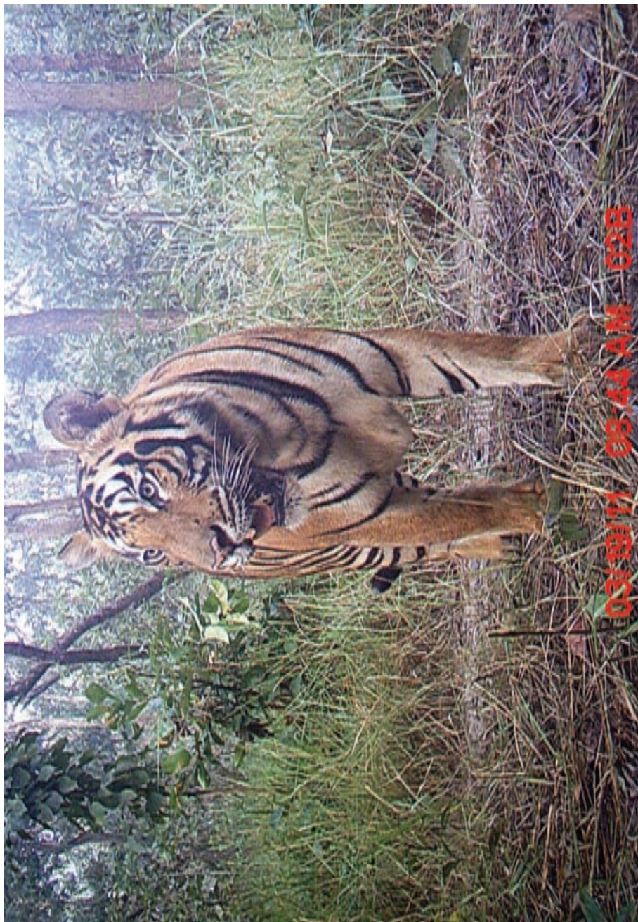
Possibly the best tiger camera trap photo?