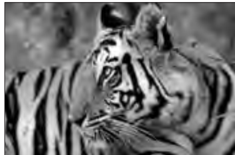
Royal Bengal Tiger. (Alex Sliwa)

The Chitwan-Parsa-Valmiki forests together form the territorial area of many tigers. The cross-border movements by the animals increase during the breeding season. During the summer there is a general move north into Chitwan by the beasts inhabiting the northern side of Valmiki. The Indian paramilitary forces deployed along the border in response to the Maoist rebellion in Nepal have also noticed these movements – they file reports, for example of a ‘Nepali tiger’ entering the Valmiki or an ‘Indian tiger’ moving north into Chitwan. Of course the international frontier has no meaning for the big cats. They have no citizenship: they simply traverse the habitat that evolution has ordained as their own.