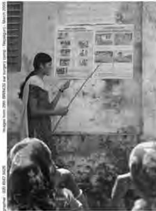
Image from 20th BRINOS ear surgery camp - Nepal - March 2008