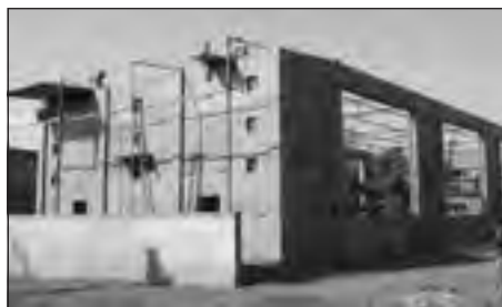
Constructing the aviary.

Despite the progress made over the past 2 years or so, the scale of the challenge faced cannot be under-estimated. India, Nepal and Pakistan make up a huge area, the majority of which had vultures until relatively recently. To ensure those areas with remnant populations are free of diclofenac is almost impossible in a short time frame so the only real option in the short term is to bring the birds into captivity and safety. This is a costly operation but if it can be done to the scale recommended the future of these species of vulture can be assured. Remember this is not just a project to save a few birds, it is a huge programme