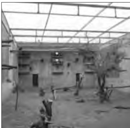
Inside the colony aviary.

hold 25 pairs and to establish breeding colonies of each of the three species. With the limited availability of wild vultures this is already a challenging target. If successful, however, these centres could be holding up to 200 birds or more which, in itself, puts huge demands on resources to staff and run the centres. This has not been done before to such a scale. The Eurasian griffon vulture and the Californian condor programmes did not work with numbers anywhere near these targets but these numbers are required because of the scale of declines in South Asia.