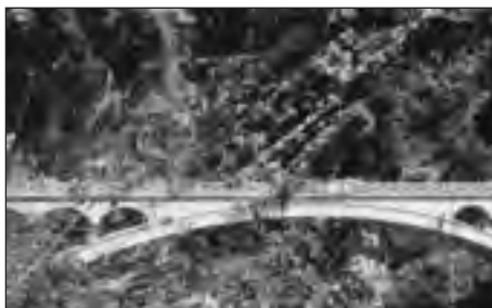
Friendship Bridge. (GDB)

The residents of all four border villages were given the choice: either stay put and accept Chinese or Nepali citizenship by virtue of location, or move across the new border in order to maintain previously existing citizenship. Families often made mixed decisions and many are now split across the border, with some family members possessing Nepali nagarikta (citizenship) certificates and others Chinese identity cards. This situation proved traumatic during the Cultural Revolution in the late 1960s and early 1970s, when the border remained closed. With the liberalisation of the Chinese economy in the late 1980s, conditions have improved. The 1992 implementation of a Sino-Nepalese treaty, which allows citizens of either country who reside within 30 km of the border to cross freely without a passport or visa, has allowed many families to reunite. The provision has also proven an advantage to some families, who have been able to establish joint-venture businesses.