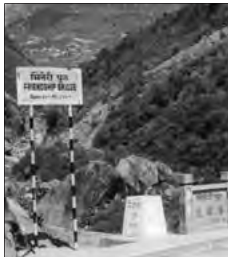
Friendship Bridge looking northwards to Khasa/Dram/Zhangmu.

established Dram as the official crossing on their newly built road in 1960, the now-thriving town consisted of little more than a cluster of shacks. More important settlements in the area were the villages of Gosa, Lishing and Syolbugang.