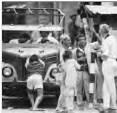
The Nepalese Customs post. (GDB)

term ‘Sherpa’, for example, used today by the inhabitants of Lishing and Syolbugang to describe themselves, has differing implications in Nepal to those in the TAR. The Chinese government classifies the Sherpa (or Xiaerba) as a dzu , or ‘less-developed ethnic people’. This classification falls short of the full status of minzu , or ‘ethnic nationality’, which defines larger Chinese minority groups such as Tibetans and Mongolians. The Sherpa do not qualify for minzu status, first, because their population is so small (approximately 1600, according to the most recent Chinese census); and second, because they have neither a distinctive writing script nor other cultural practices notably different from those of mainstream Tibetans.