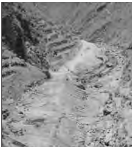
Constructing the 'dagger' in 1964. (GDB)

Nepalis, both male and female, have taken this route. There is another, back-door option, however: changing one's name to 'Sherpa' upon crossing the border and hoping to be mistaken for a Xiaerba. This is why members of other regional Nepali ethnic groups (such as the Thami and Tamang, found across the border in Nepal) are difficult to locate in Khasa – most introduce themselves as 'Sherpa'. Some go further by dressing in a 'traditional' style that few Sherpa themselves do, or by pretending that they do not understand Nepali.