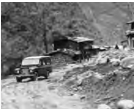
The Kodari Road after a monsoon landslide.

Such attention includes educational and civil service quotas for dzu citizens; with such a small population the competition is minimal. Dzu students also receive extended time to complete their examinations and are graded on a more forgiving scale.