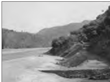
Constructing the approach to the Indrawati River Bridge 1964. (GDB)

But there are also those who seek to capitalise on their Nepali heritage. In Khasa and Nyalam, Nepali food is perceived to be cheap and healthy. To emphasise their Nepali-ness and draw customers, many Nepali eateries display photos of the royal family or play Nepali pop music. Ironically, these are precisely the symbols of dominant culture from which ethno-politically active Sherpa or Tamang inside Nepal seek to distance themselves.