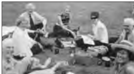
Elements of the committee at the summer outing enjoying their picnic.