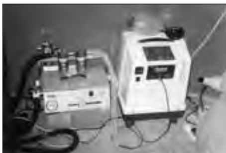
Donated anaesthetic equipment

During our time in Nepalgunj we have learnt of the provision of primary care in the field of eye disease. They have a strong successful community eye worker programme supported by volunteers from each village. In March 2000 we supported the appointment of the first community ear worker (CEW) who since has established himself in five village development committees (VDC's) and has trained 60 volunteers to assist him. He in turn is supported and was trained by the local ENT surgeon in Nepalgunj who in turn refers more complex surgical cases to our twice yearly ear surgery camps. This project has proved to be sustainable and self supporting and has already linked with the Banke branch of the King Mahendra Trust and is shortly to be reproduced in conjunction with the Community Health Unit of the Nepal Medical College. This year we have trained our CEW in hearing testing and in the care, maintenance and provision of hearing aids.