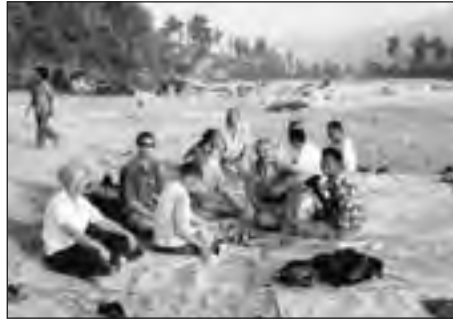
A relaxing day off

We see this model as one which reaches out completely to the people of Nepal and is driven by them as the initiative and demand for ear care comes from the volunteers to whom the people turn.