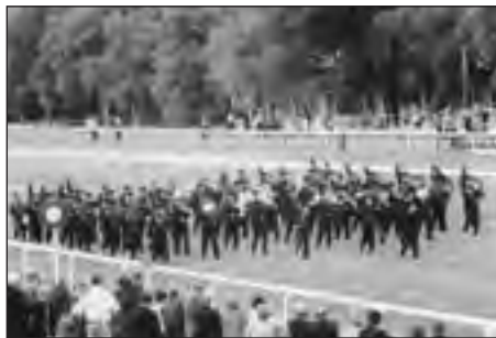
The Band and Pipes & Drums of the Brigade of Gurkhas on the Course at Newmarket