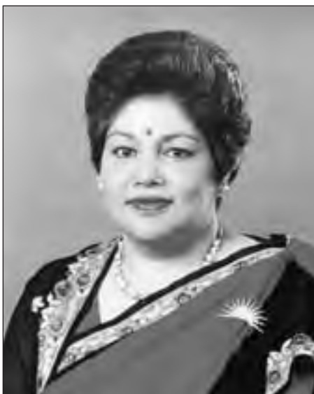
HM Queen Komal Rajya Laxmi Devi Shah