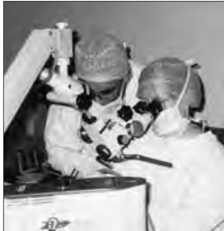
Ear surgery in progress

So far 23,000 patients have been seen and treated and 2,370 operations to prevent the development of life threatening complications and restore hearing have been performed. At each camp we have the opportunity to work closely with Nepali ENT surgeons and to contribute to their training.