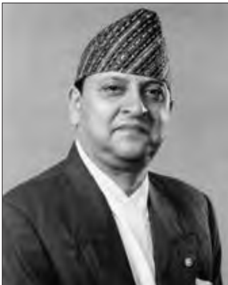
HM King Gyanendra Bikram Shah Dev