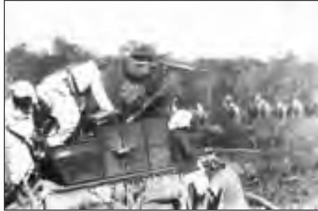
'Ready, aim, fire!' Shooting from the howdah. Terai, c 1920

In February 1963, I was included among the four foreign Military Attaches in Kathmandu who had the honor and good fortune to be invited to participate in the elegant and most exciting tiger shoot of HM King Mahendra Bir Bikram Shah Dev, who died in 1972 and was succeeded by his son Birendra.