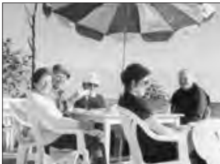
The 'recce party' relaxing over breakfast at Nagarkot

At Nagarkot, at the Chautari Hotel, we saw a marvellous sunset - the whole face of Langtang seemed to have a red hot