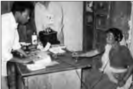
Hearing testing performed by the Community Ear Worker in a village screening camp

We were very conscious at the beginning that we were seeing the end stages of ear disease. Whilst these patients could not be ignored and were much in need of active surgical treatment we knew that about 50% of the problems we were seeing were in reality preventable.