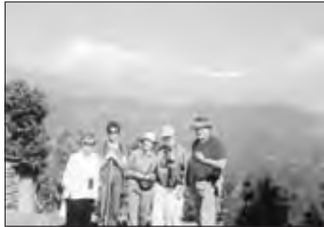
The 'recce party' at Naudanda with the Annapurna range in the background

2002 tour. The mountains had not been visible for four days but our luck was in and the skies cleared giving us a view of the Fishtail in all its glory, with both points of the tail clearly visible from this excellent vantage point.