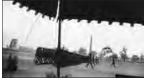
Parade on the Tundikhel - March 1933

By April the planes, to my intense relief, had flown over Everest and returned safely