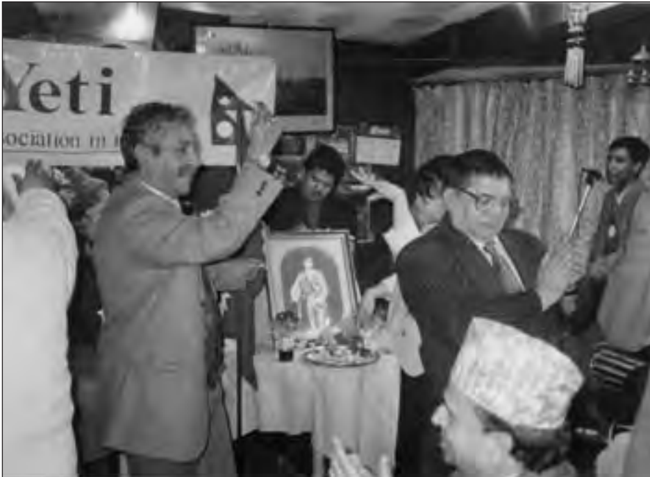
Yetis celebrating Democracy Day

original route finding, fortunately resolved by the Yeti’s excellent mobile phone network, all met on the sea front. The bracing air and bright sunshine was enjoyed by all, and some of the younger members braved a swim in the sea. For the Democracy Day celebrations some had travelled long distances but all managed to pack into the Johnnie Gurkha Restaurant in Aldershot. The afternoon started with a display of respect to HM King Birendra Bikram Shah Dev. This was followed by speeches, some of which were kindly given in English for our benefit. Music, singing and a buffet curry lunch meant that the celebrations proved to be happy and enjoyable for both adults and children alike.”