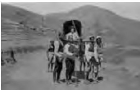
On the way to Kathmandu: an example of the litters in use c1933.

large hood above and a place for one's feet below. Two very stout poles on either side of this contraption would rest on the shoulders of the porters. As soon as I was seated, it was raised up and the porters set off. Padmimaya's litter did not have a hood and was obviously lighter than mine, however I heard the panting of the porters who, trudging behind, had to bear her ample weight. Our path looked well-trodden though rough; it was more a track than a road. I had one small piece of luggage for my immediate use, the heavy ones were conveyed to Kathmandu on the ropeway built in 1923 with great skill and imagination by Sir Daniel Keymer of Keymer Son & Co Ltd, London. At the time it was regarded in technical ropeway circles as being a very notable piece of engineering in the world. It carried goods into Kathmandu over 14 miles of semi-mountainous areas and was maintained by the dedicated care of the late R G Kilburne MIEE, (his widow was one of