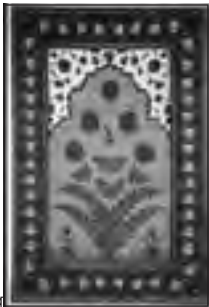
Augusta Prayer Rug

An established weaving house specialising in one-of commissions, producing any design using pashmina, silk or ?Best? Tibetan wool, up to an amazing size