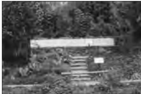
The chautara at the Gurkha Memorial Garden

I am pleased to be able to report that the 2000 summer outing was a success. We travelled down to Winchester and visited the Gurkha Museum followed by a buffet style lunch at a new Nepalese Restaurant in Winchester, called the Gurkha Chef. Following this tiffin, we made our way to the Hillier Arboretum and Gardens near Romsey, and in particular to visit the Gurkha Memorial Garden which has recently been