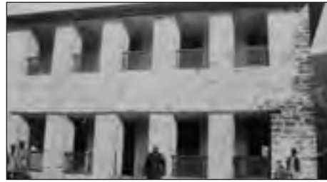
The rest house at Chisapanighari

It was late afternoon when we reached Sisaghari (official name Chisapanighari).