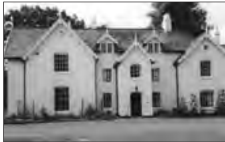
Jermyns House at the Hillier Arboretum

Members will already have noted that the Committee is planning a Society tour to Nepal in November 2001. Plans will include special visits that can only be arranged through Society contacts. Interested members may wish to contact me, so that I can give them an outline of possible events likely to be included in the proposed itinerary.