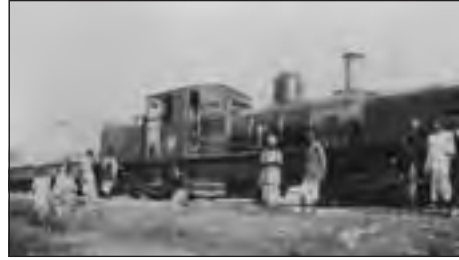
Nepal Government Railway engine at Raxaul station

After breakfast next morning we walked to the tiny Raxaul station. People were waiting to board the narrow gauge train pulled by an engine called Mahabir. As we were escorted to our compartment, I noticed the profusion of poppies growing beside the track in colours I had not seen before, ranging from pure white through to shades of pink and peach to the traditional red. The train set off at a cheery pace, but after a