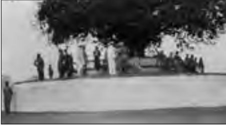
The Commander-in-Chief with senior Generals of the Royal Nepalese Army on the Tundikhel - 22nd March 1933

the first Nepalese Minister to be accredited to Britain and he opened the Legation, now Embassy, in Kensington).