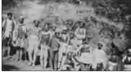
The porters and sepoy guard below the Chandraghiri pass

We stopped for a while at the village of Khulikhani. I was surprised to find that the village shop had a good supply of cigarettes. I bought the entire stock for my porters who