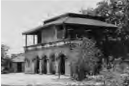
The old railway station at Amlekhganj - 1992 (GDB)

large hood above and a place for one's feet below. Two very stout poles on either side of this contraption would rest on the shoulders of the porters. As soon as I was seated, it was raised up and the porters set off. Padmimaya's litter did not have a hood and was obviously lighter than mine, however I heard the panting of the porters who, trudging behind, had to bear her ample weight. Our path looked well-trodden though rough; it was more a track than a road. I had one small piece of luggage for my immediate use, the heavy ones were conveyed to Kathmandu on the ropeway built in 1923 with great skill and imagination by Sir Daniel Keymer of Keymer Son & Co Ltd, London. At the time it was regarded in technical ropeway circles as being a very notable piece of engineering in the world. It carried goods into Kathmandu over 14 miles of semi-mountainous areas and was maintained by the dedicated care of the late R G Kilburne MIEE, (his widow was one of