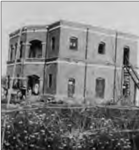
Guest house at Raxaul