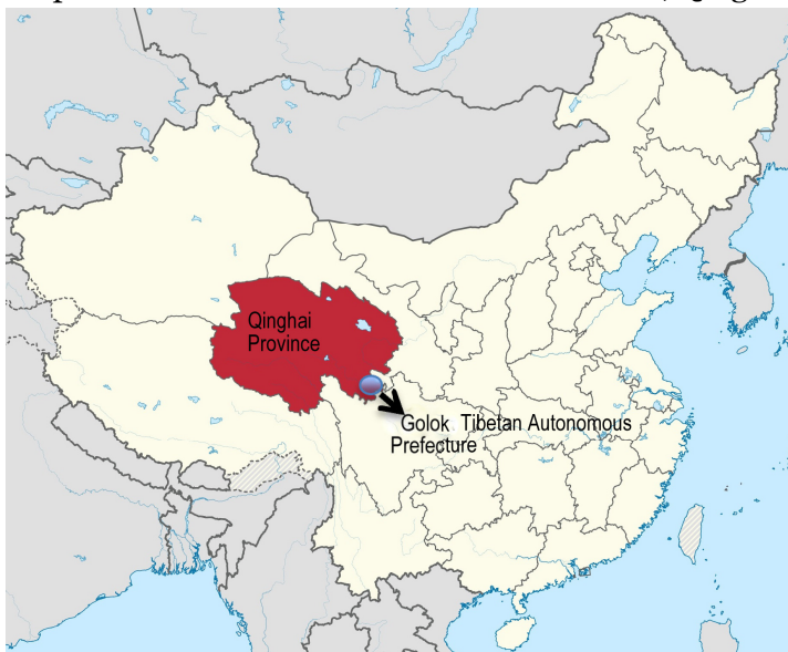
Map 1. Golok Tibetan Autonomous Prefecture, Qinghai Province. 5