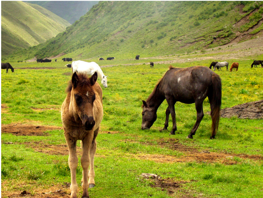
My family's horses (July 2010, Pema County).