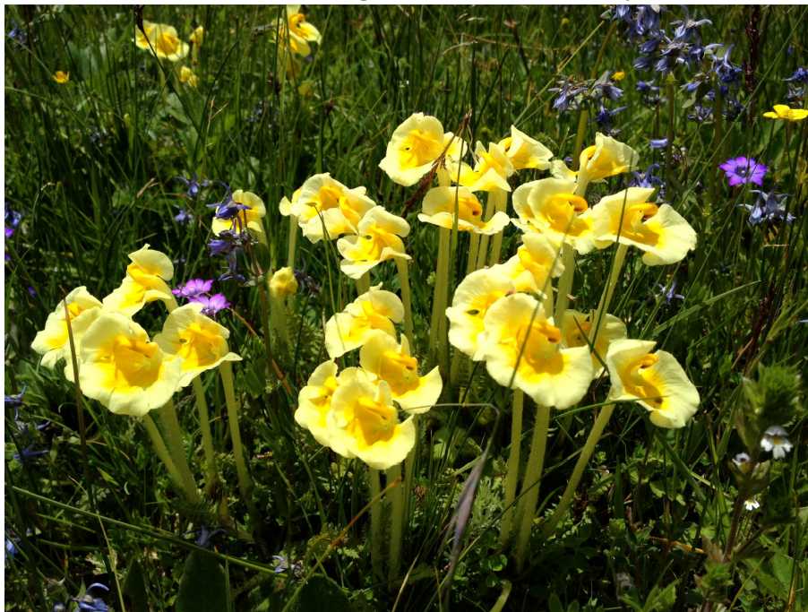
Wild flowers (August 2014, Pema County).