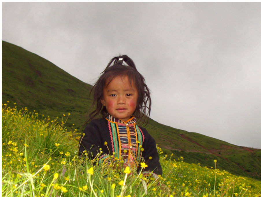
A little girl (July 2010, Pema County).

with each other. If I don't play with my brothers, I won't have much fun."