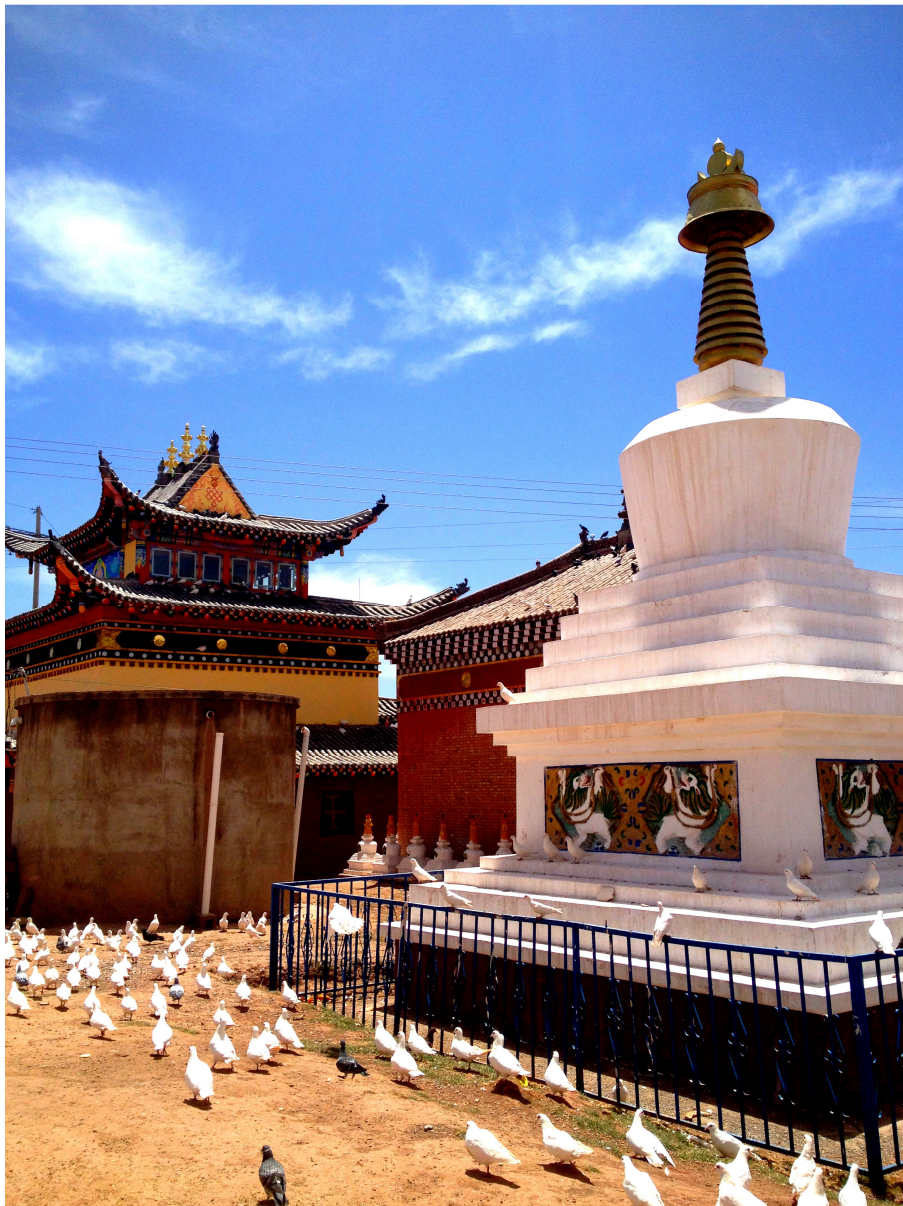
A temple (May 2014, Golok Prefecture Seat).

middle school. She knitted a woolen sweater for me. These kind deeds made me feel like I was a part of her family. I didn't want to disappoint my family members with low marks so I studied diligently.